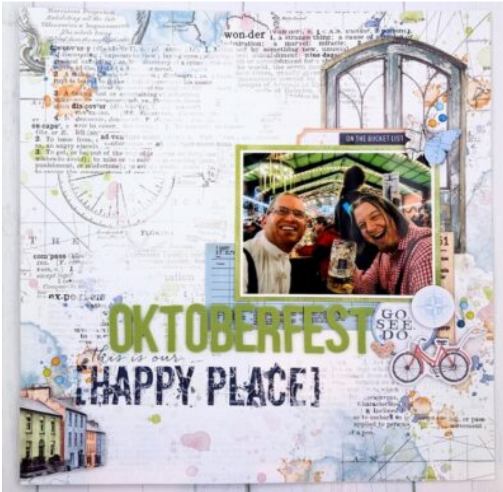
Layout by Veilman