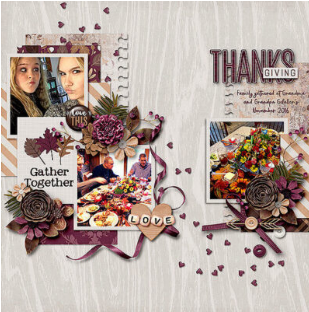
Layout by AmaneseFe