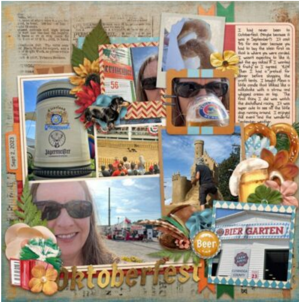
Layout by Lynn