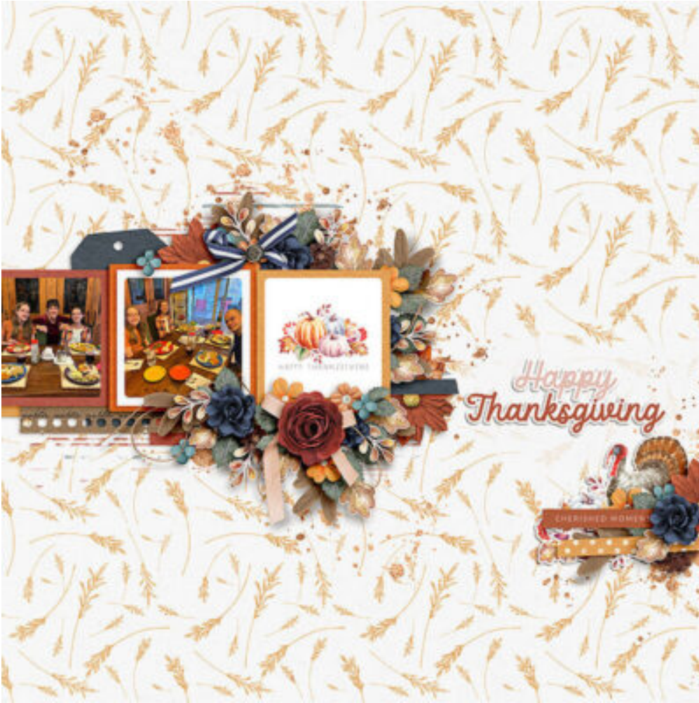
Page by Cassie