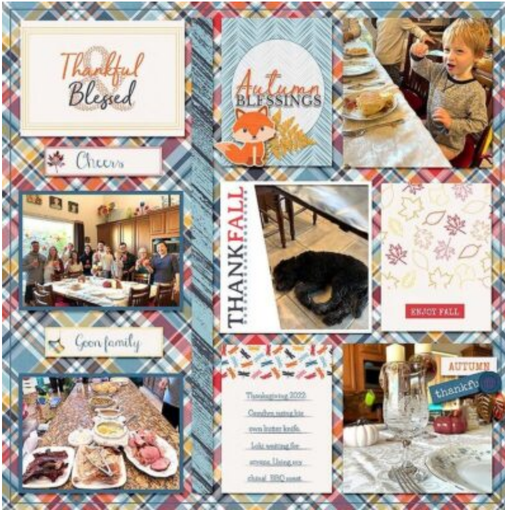
Layout by Kim