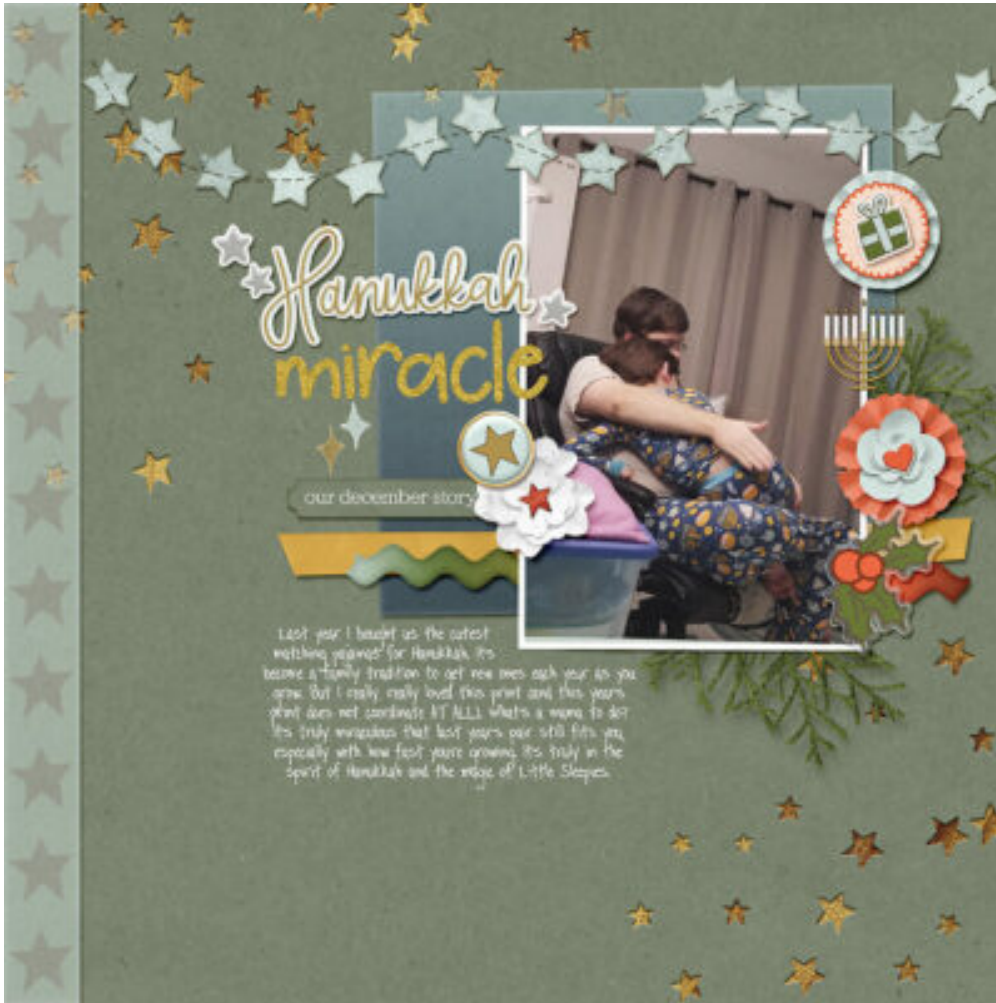
Page by Brendazzle