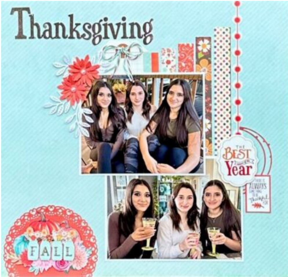
Layout by Trish