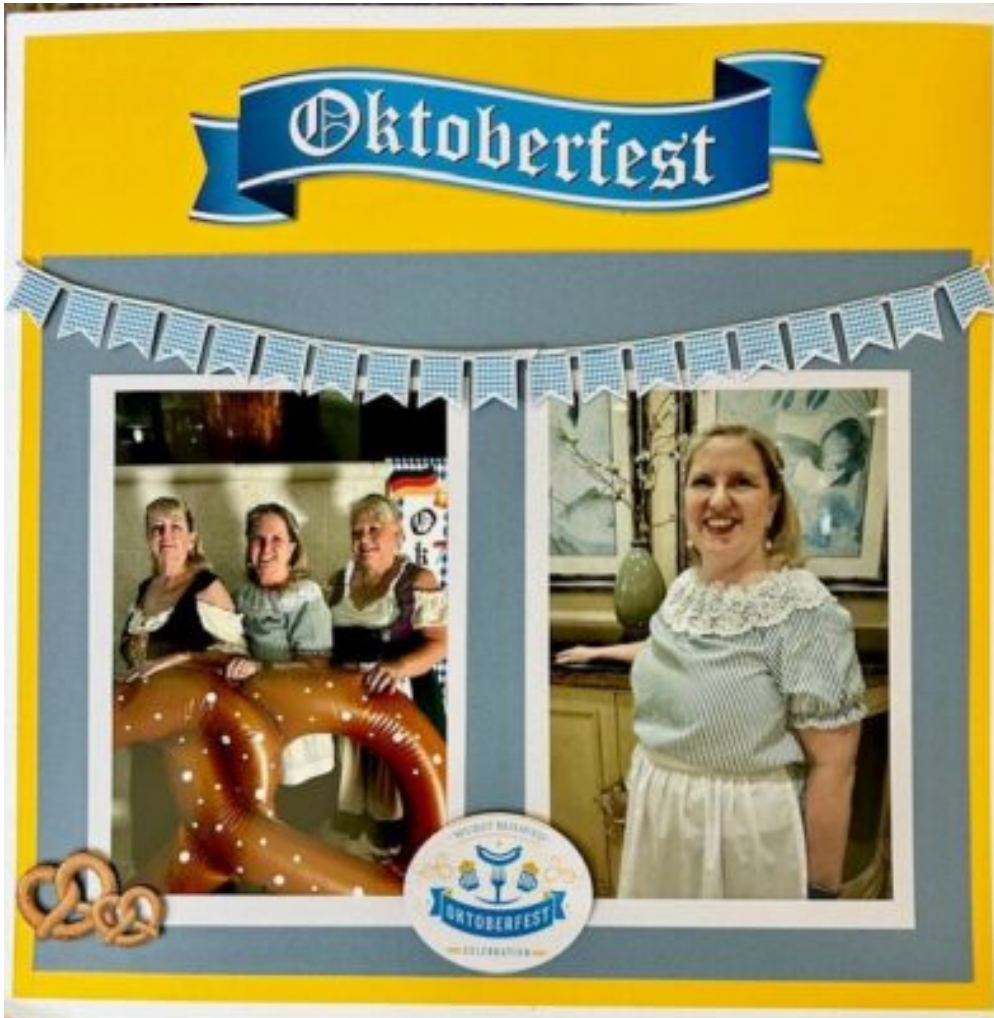
Layout by Beverly