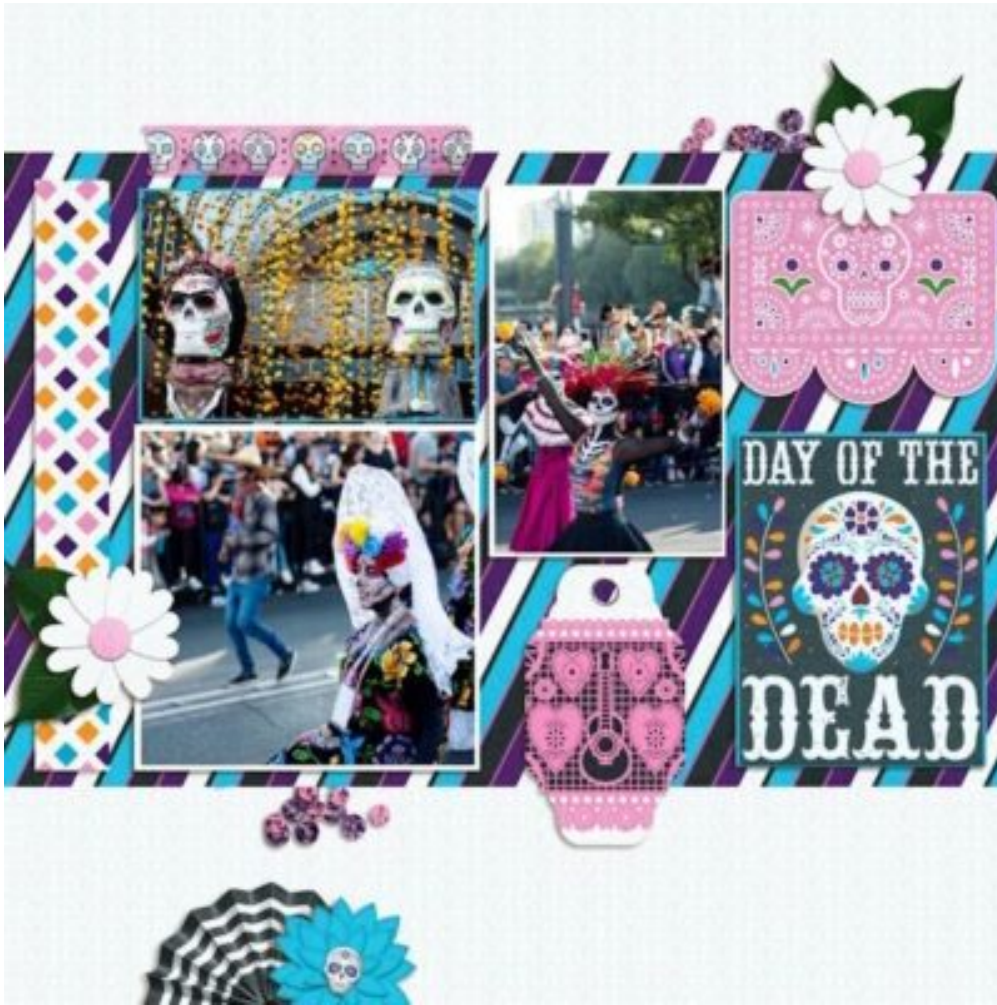
Page by Lou