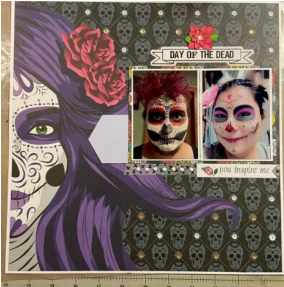
Layout by Tisha