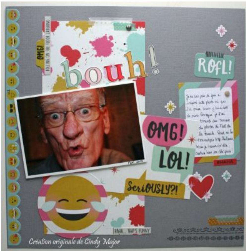
Layout by Cindy