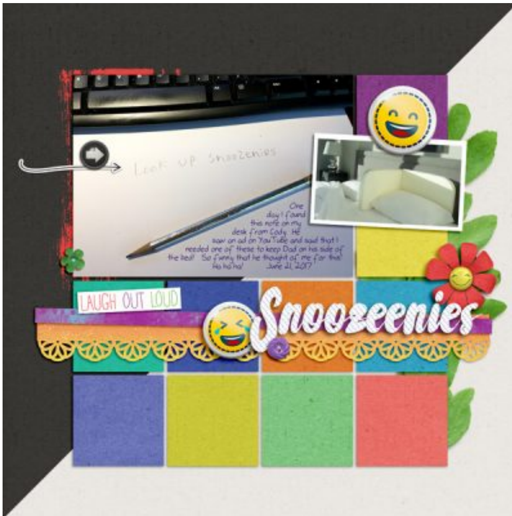
Layout by Karen