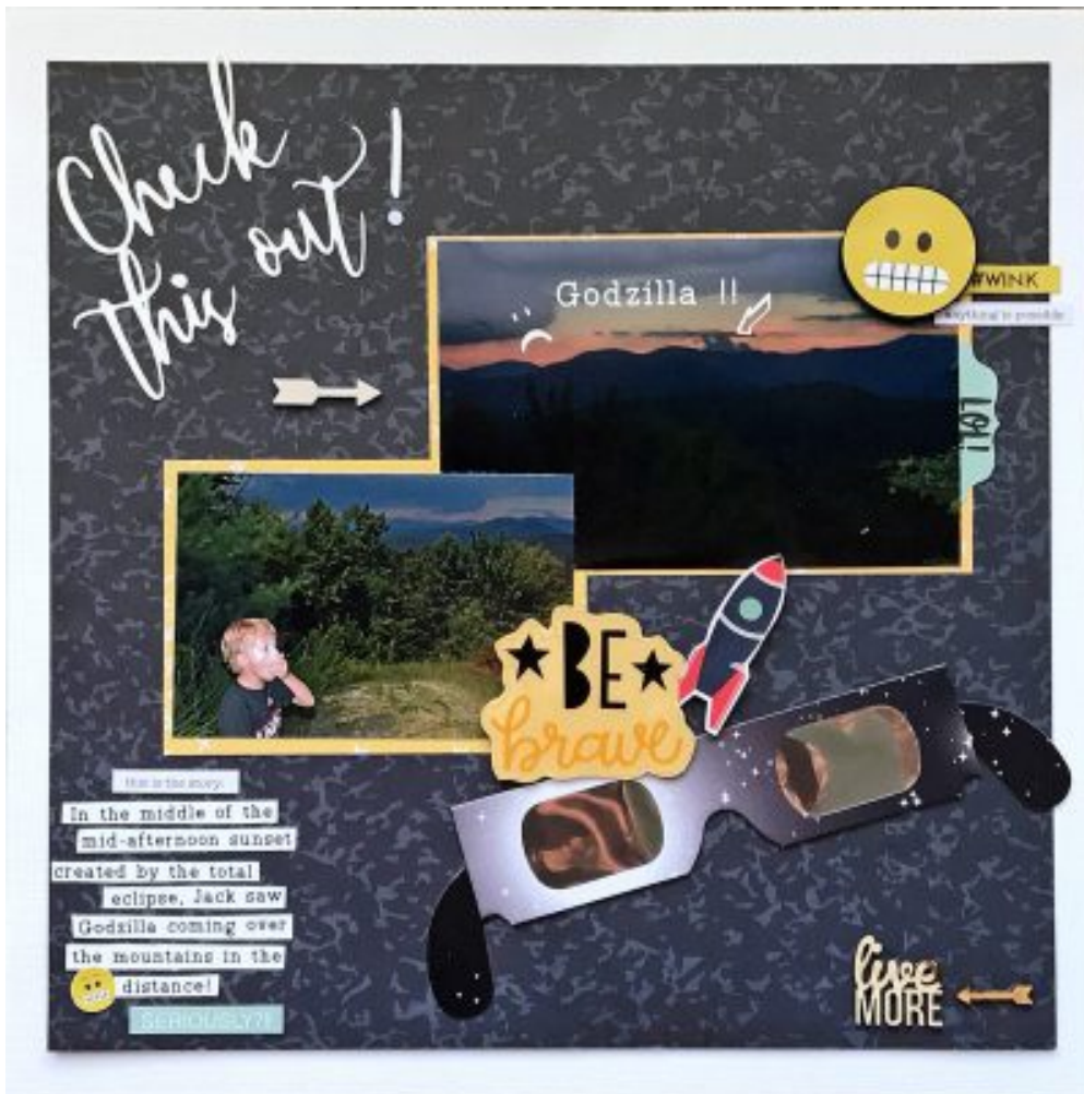
Layout by Dottie