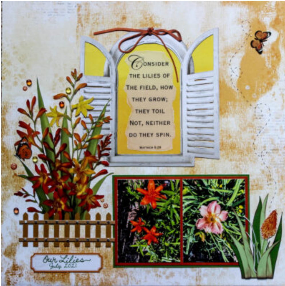
Layout by Betty