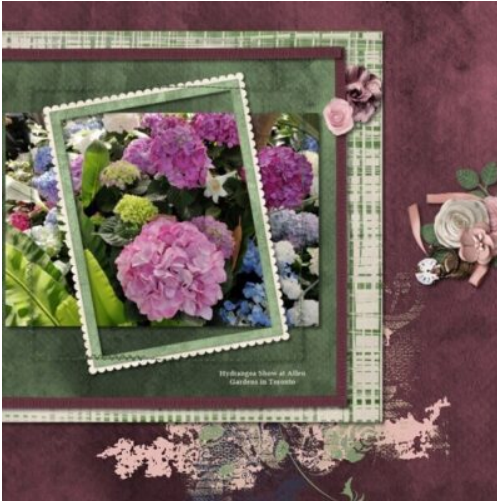
Layout by Maureen