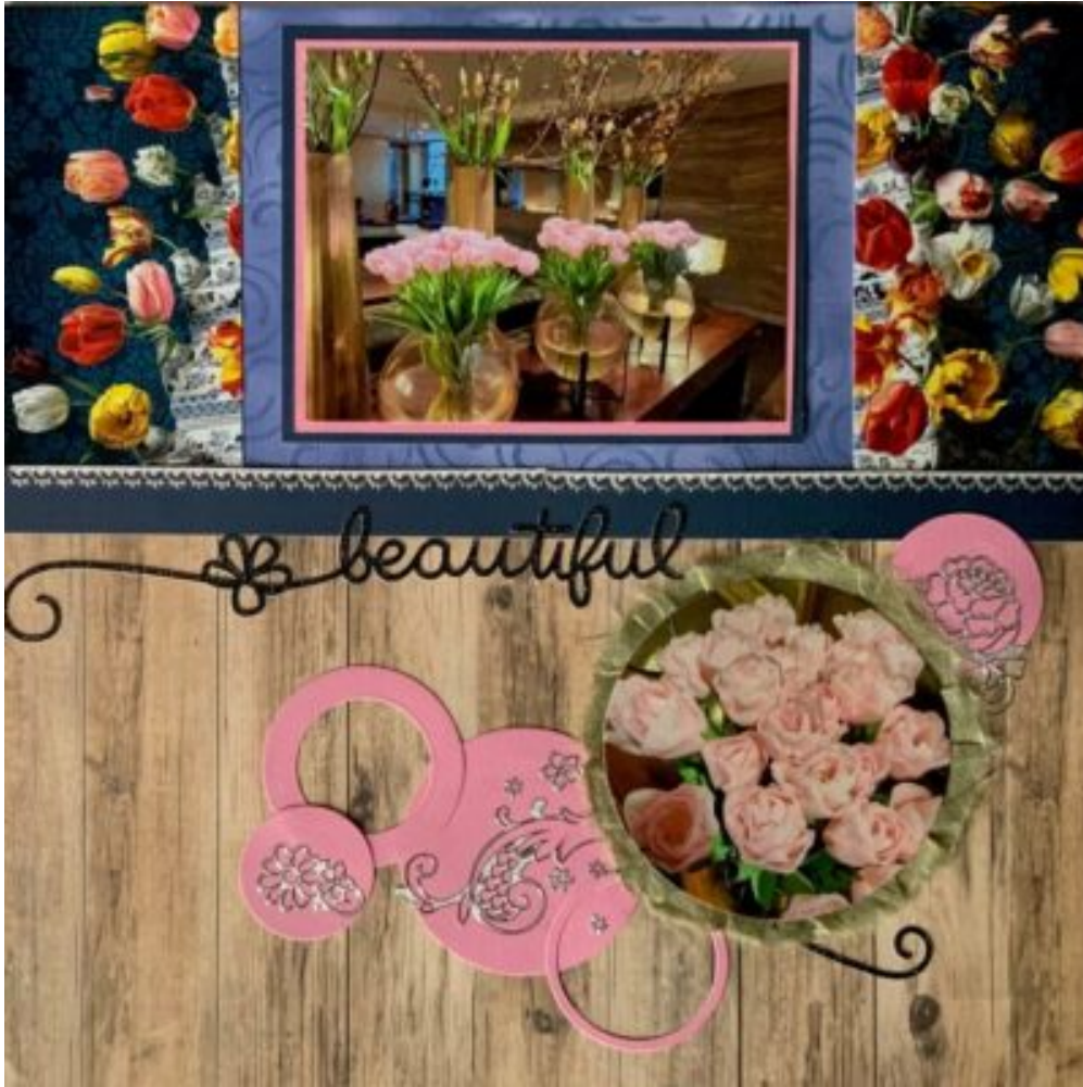
Layout by Lis