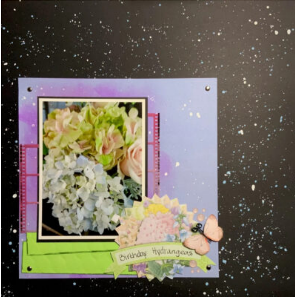
Layout by Lis