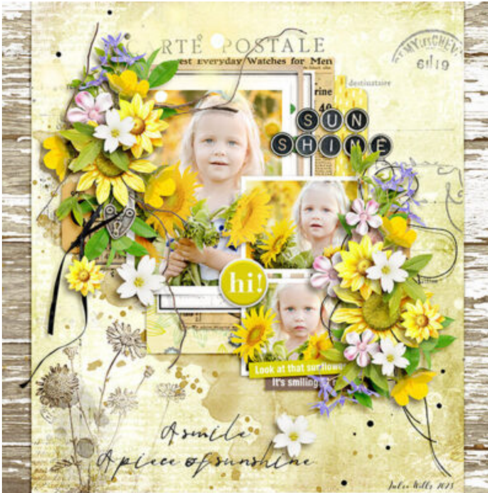
Layout by Julie