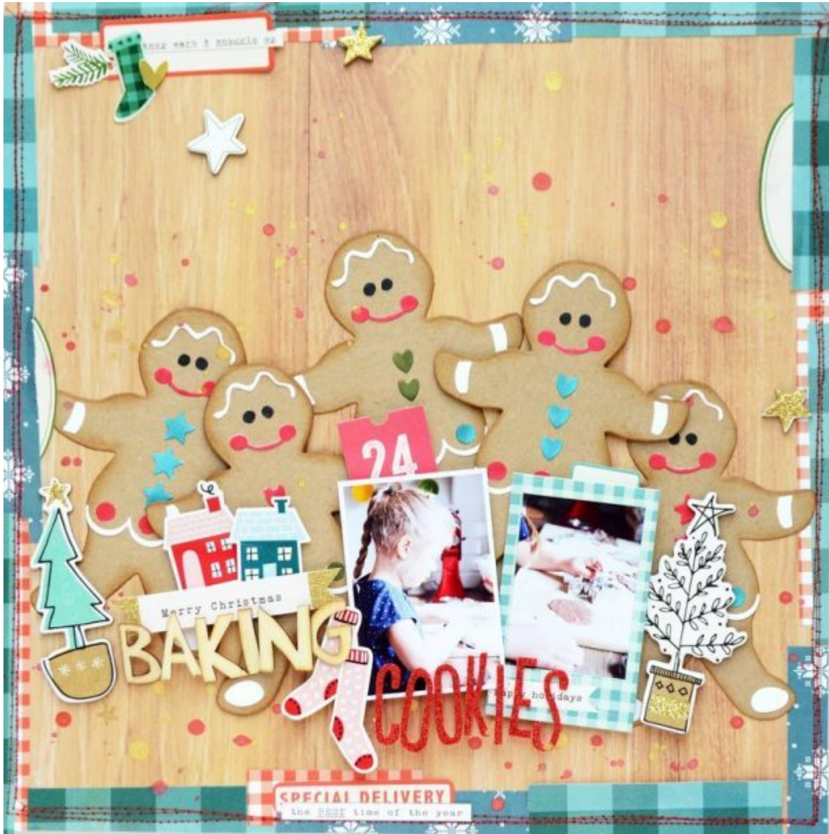
Layout by Anna