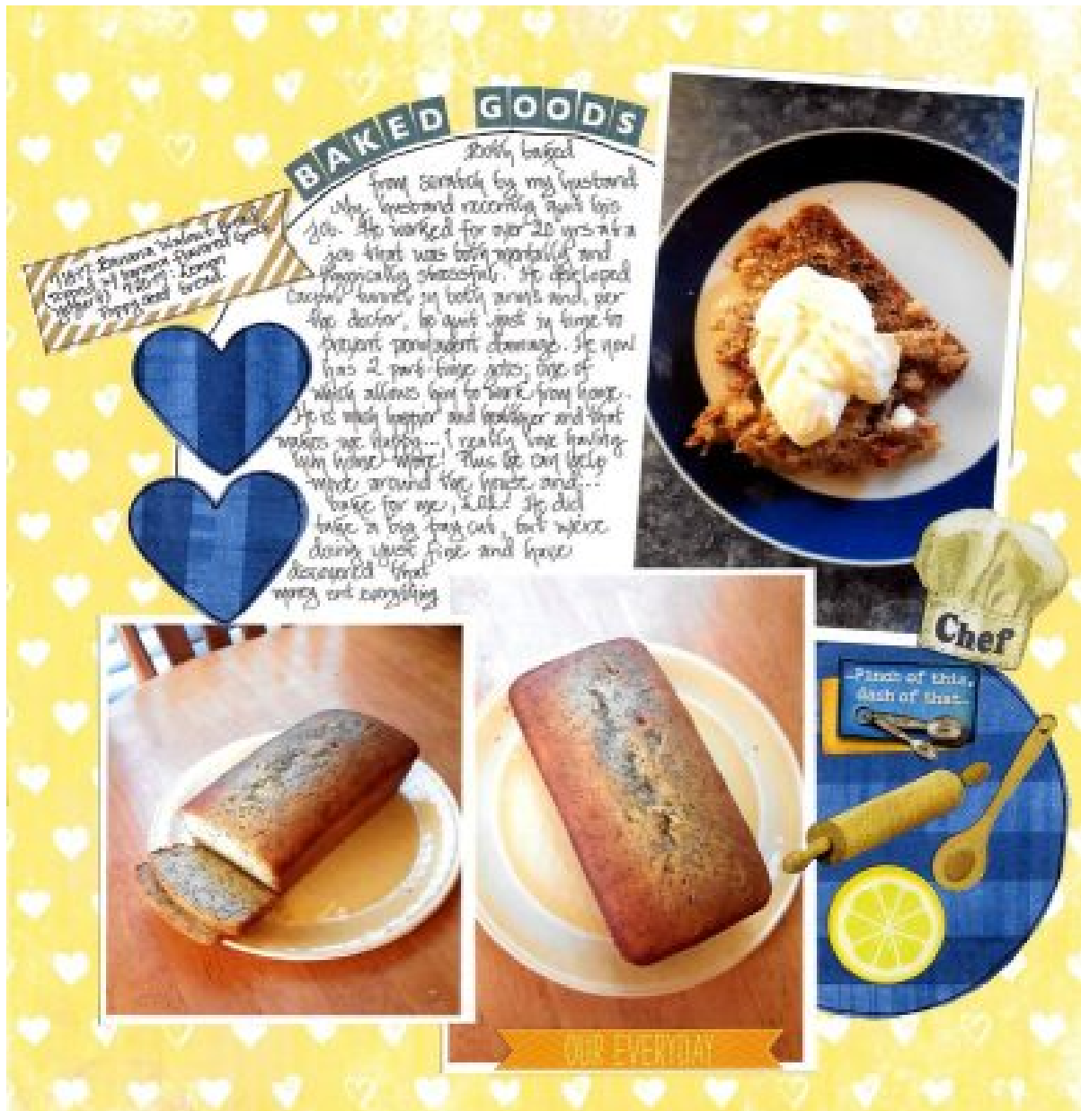
Layout by Doreena