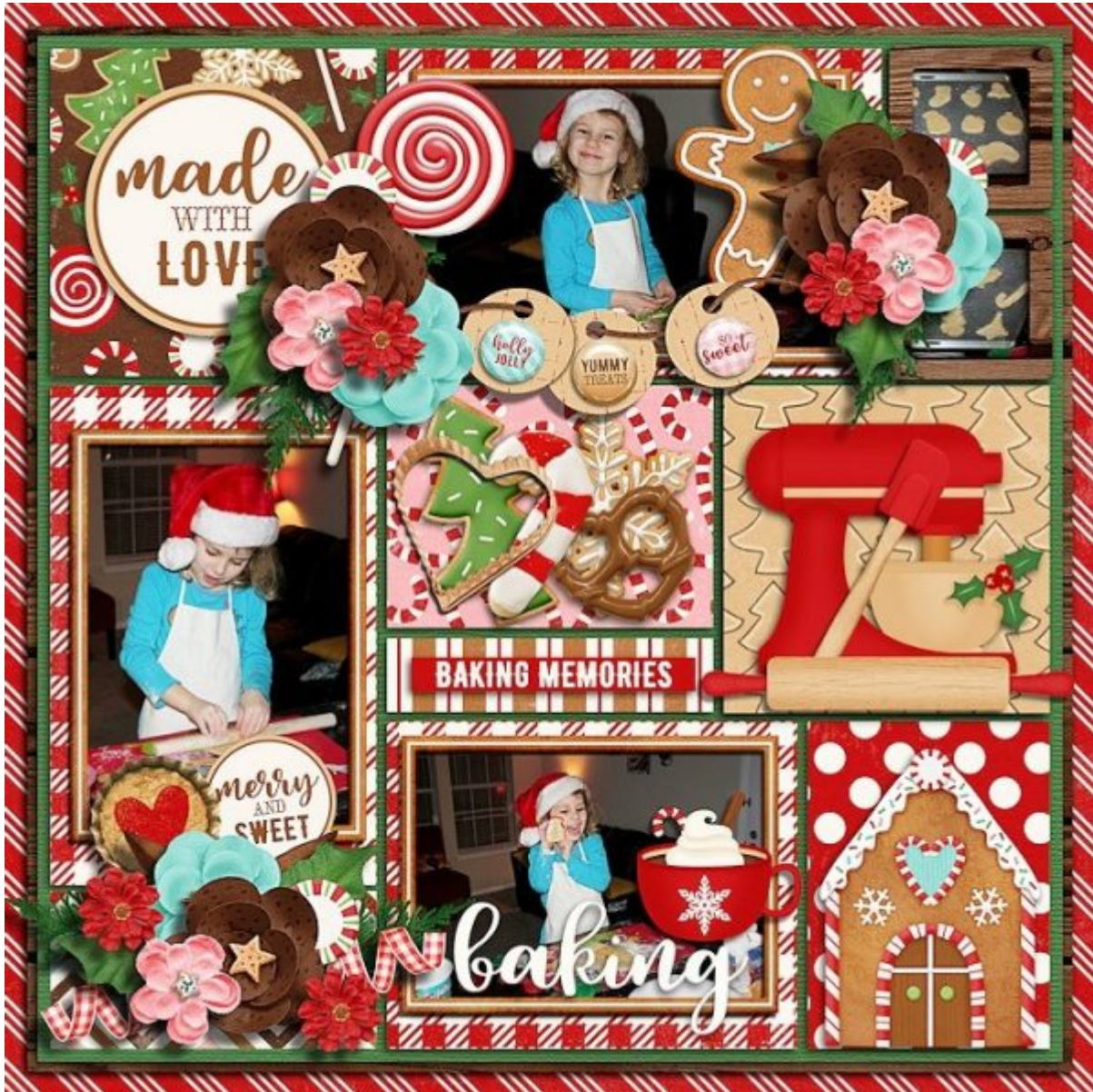
Project by Ellaspace