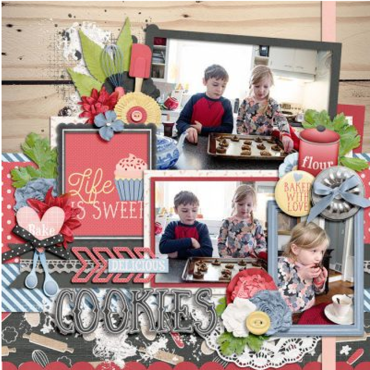
Layout by Allyson