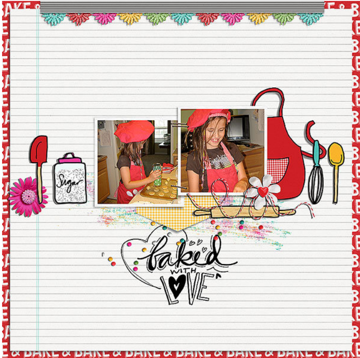
Layout by Chigirl