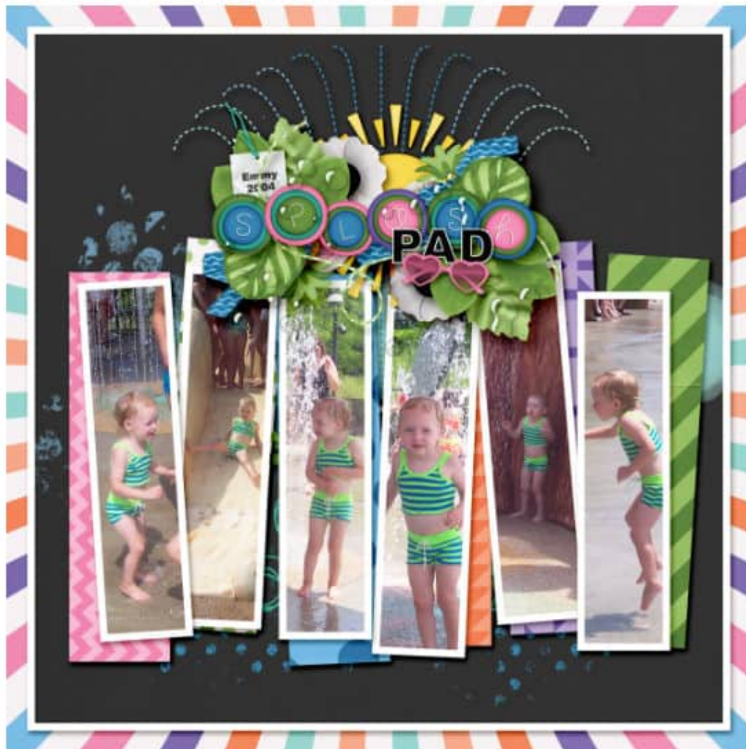
Layout by Yvonne Pucket, with a kit from Scraps'n Pieces

Since it is so easy to get a raffle of photos, you can also display several photos that are quite similar, without being totally identical.