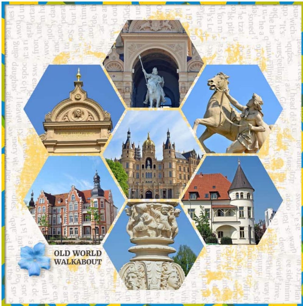
Layout from Bina Greene

One of the best things about scrapbooking is that it allows you to be creative with your photos and memories. Repetition is one element that you can use to add interest and visual appeal to your pages. Whether you repeat colors, shapes, patterns, or even photos, repetition can help your scrapbook pages come to life. So, next time you're stuck on how to create an interesting scrapbook page, consider using repetition to add that extra touch.