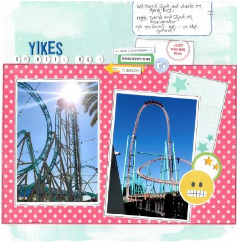
Page by Doreena