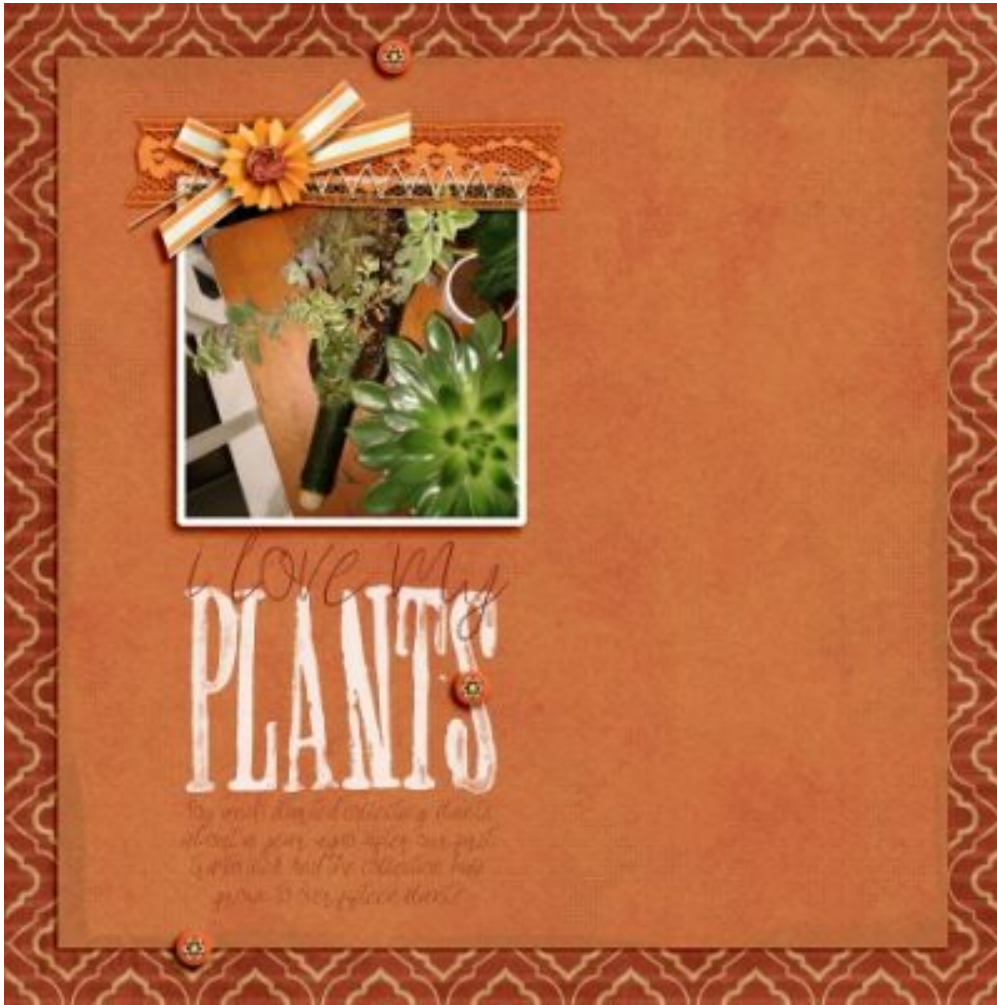
Layout by Rachel