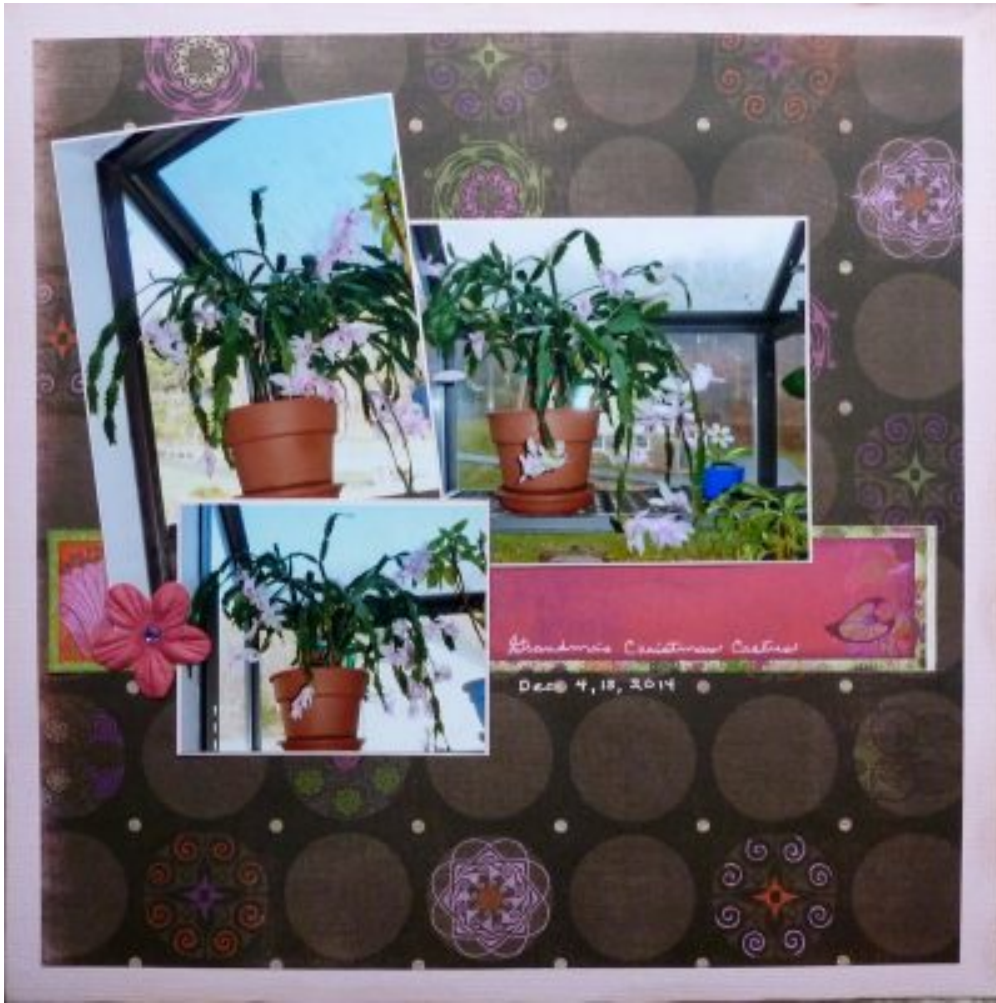
Layout by Bev