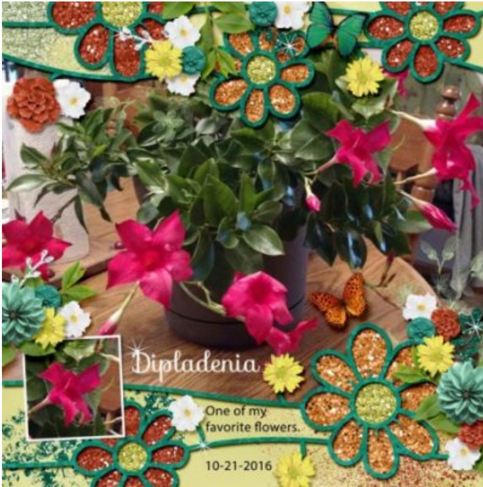
Layout by Kathy