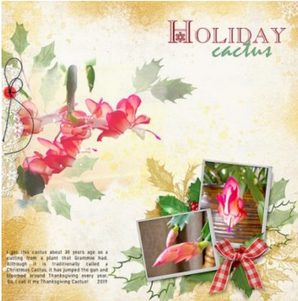
Layout by Angie