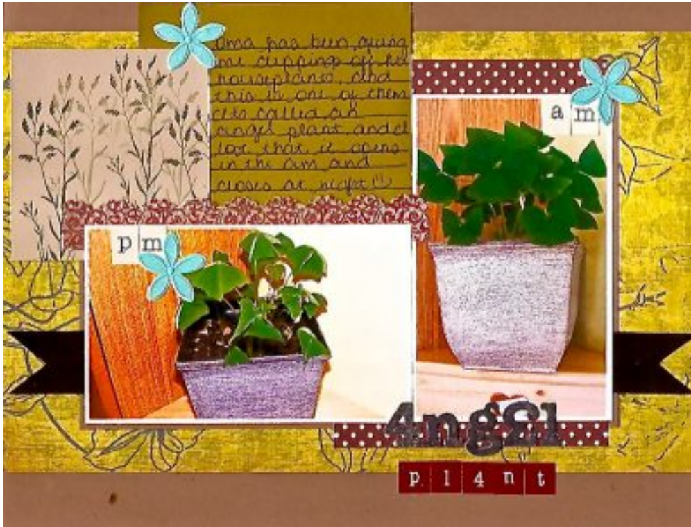
Layout by Twinlets Mama