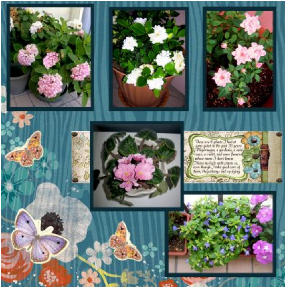
Layout by Ana