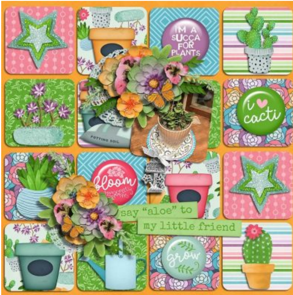
Layout by Ellaspace