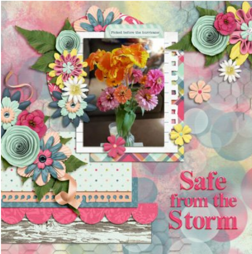
Layout by Betsyfru