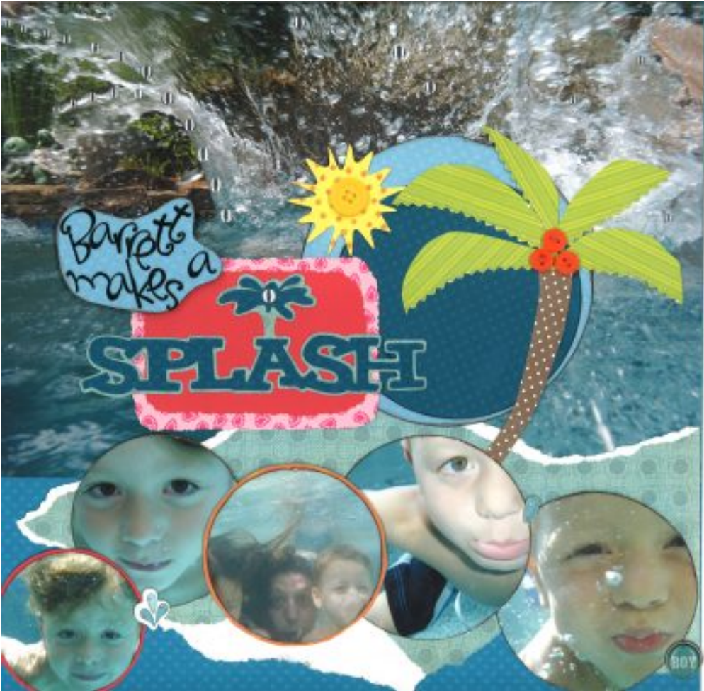
Layout by Kathy