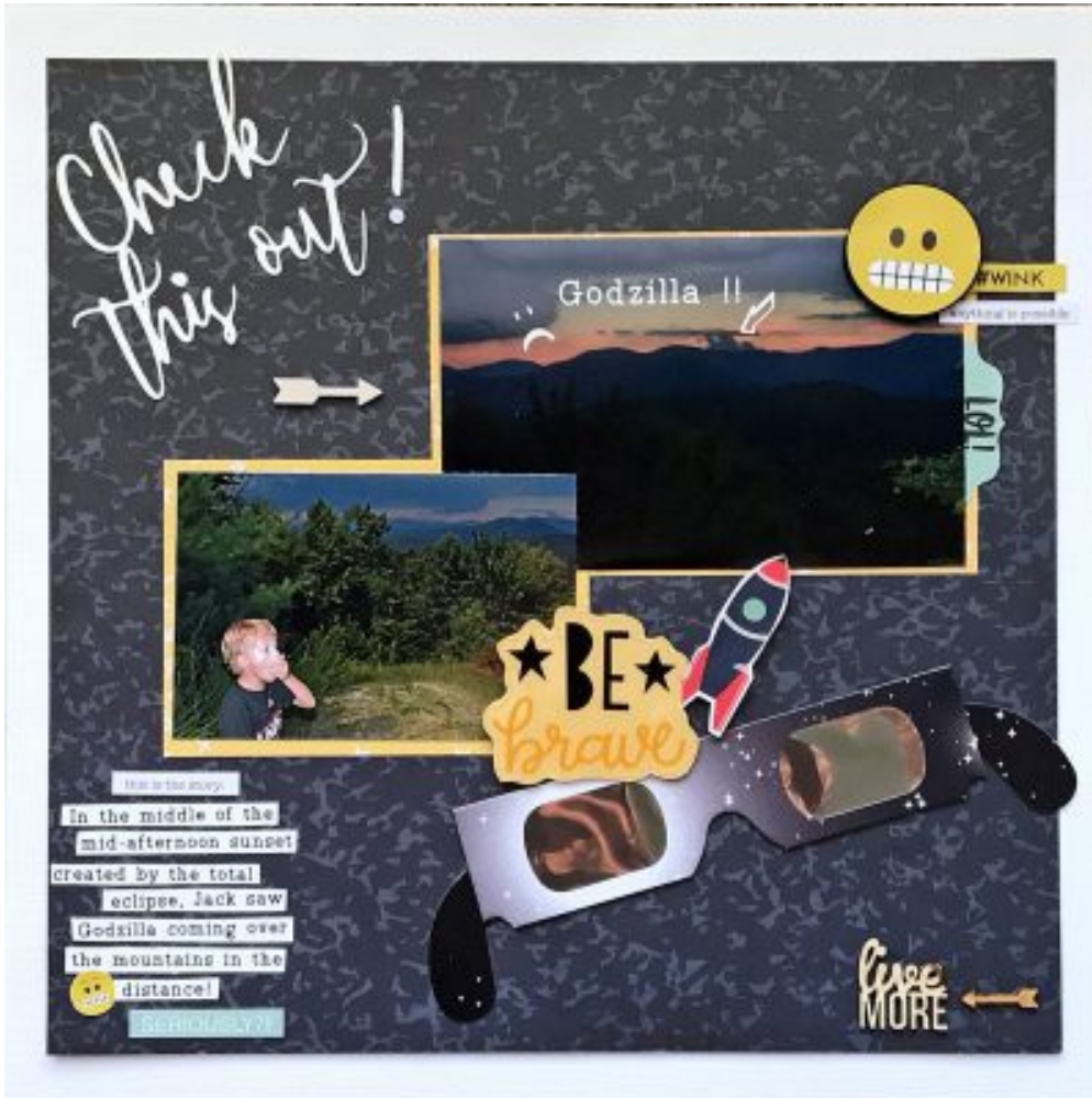
Layout by Dottie