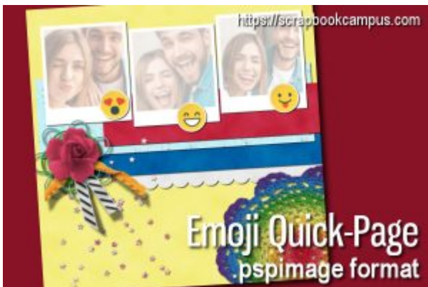
Layout by Rachel

With PaintShop Pro 2020, some tubes that came as part of