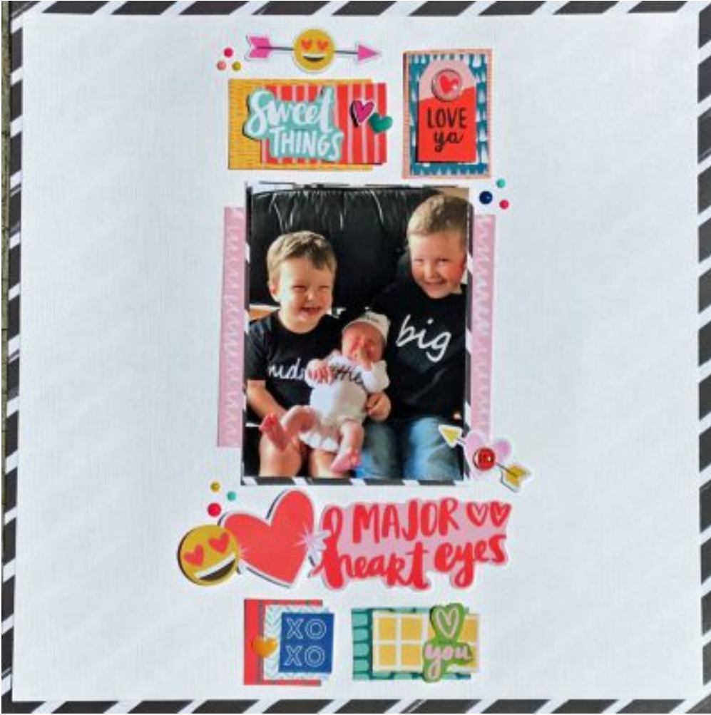
Page by Dottie