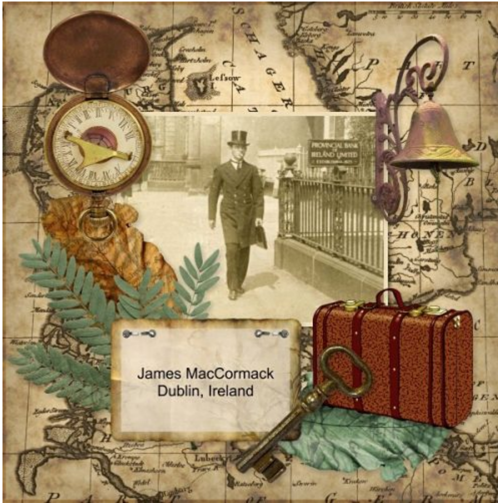
Layout by Lil