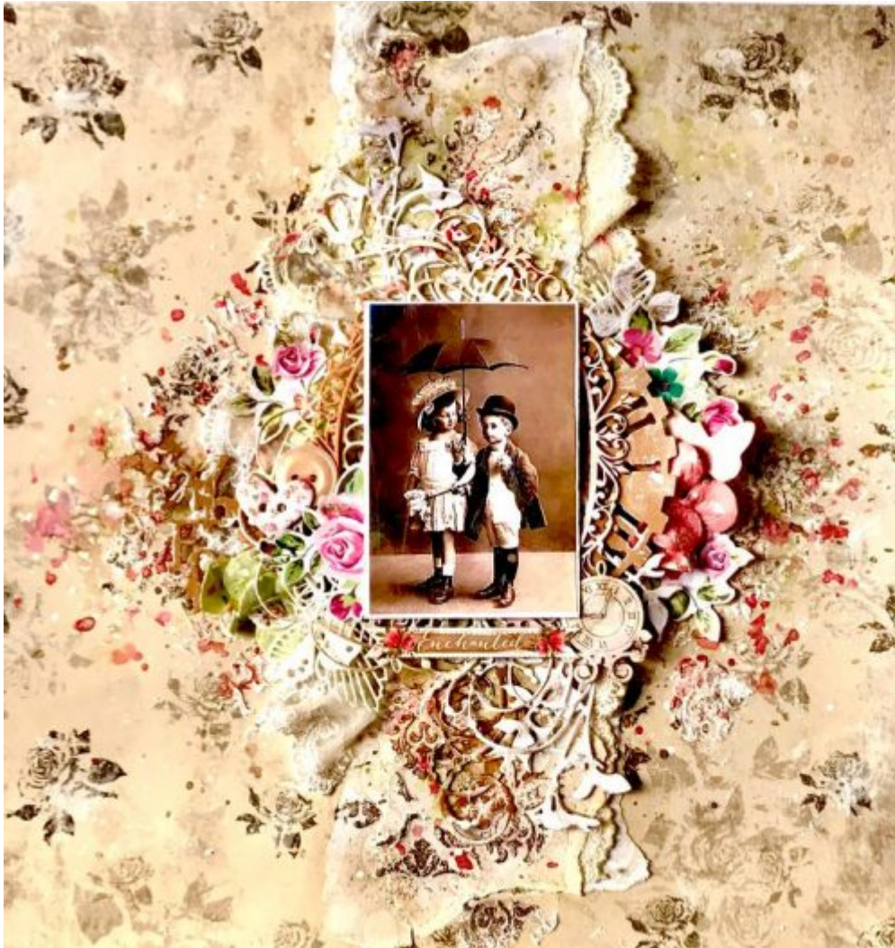
Layout by Anat