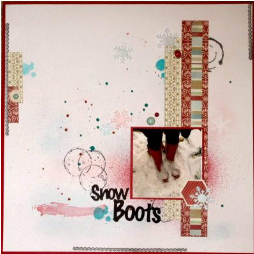
Layout by Norma