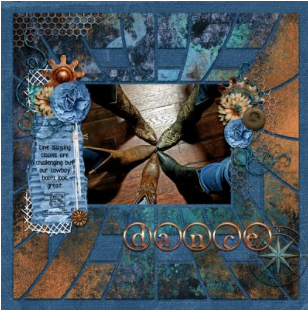
Project by Hawkgirl