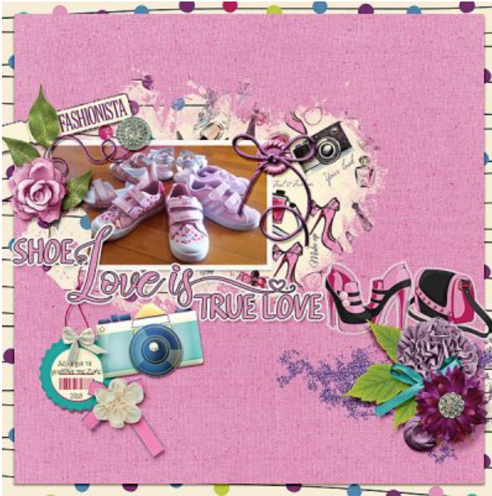
Layout by Cinderella_cindy