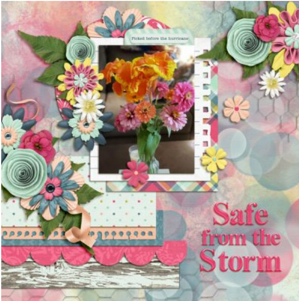
Layout by Betsyfru