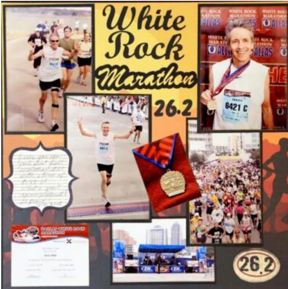
Layout by Anajul