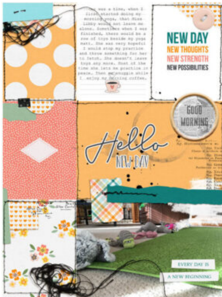
Layout by Candy