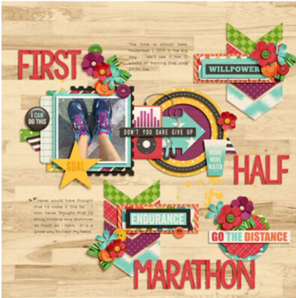
Layout by Carrie1977