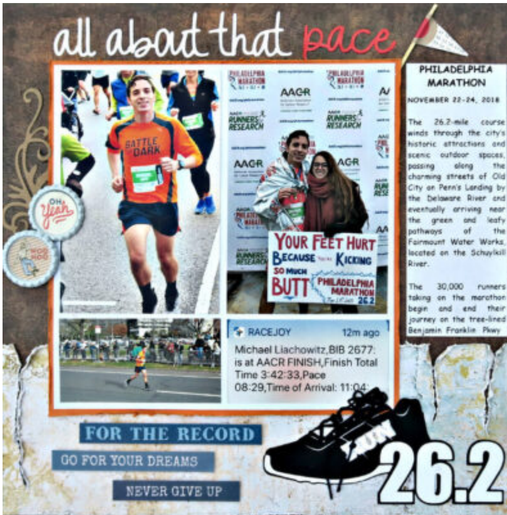
Layout by MarcilB