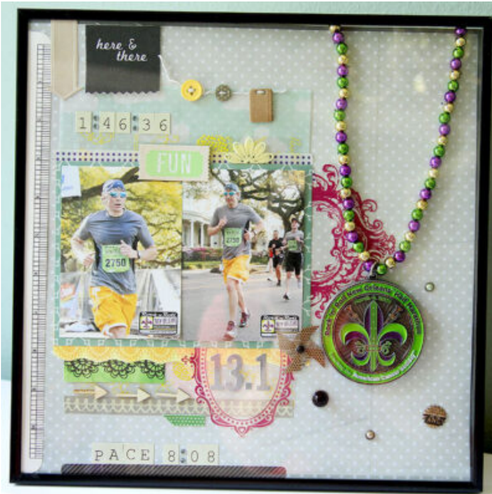
Layout by Patricia