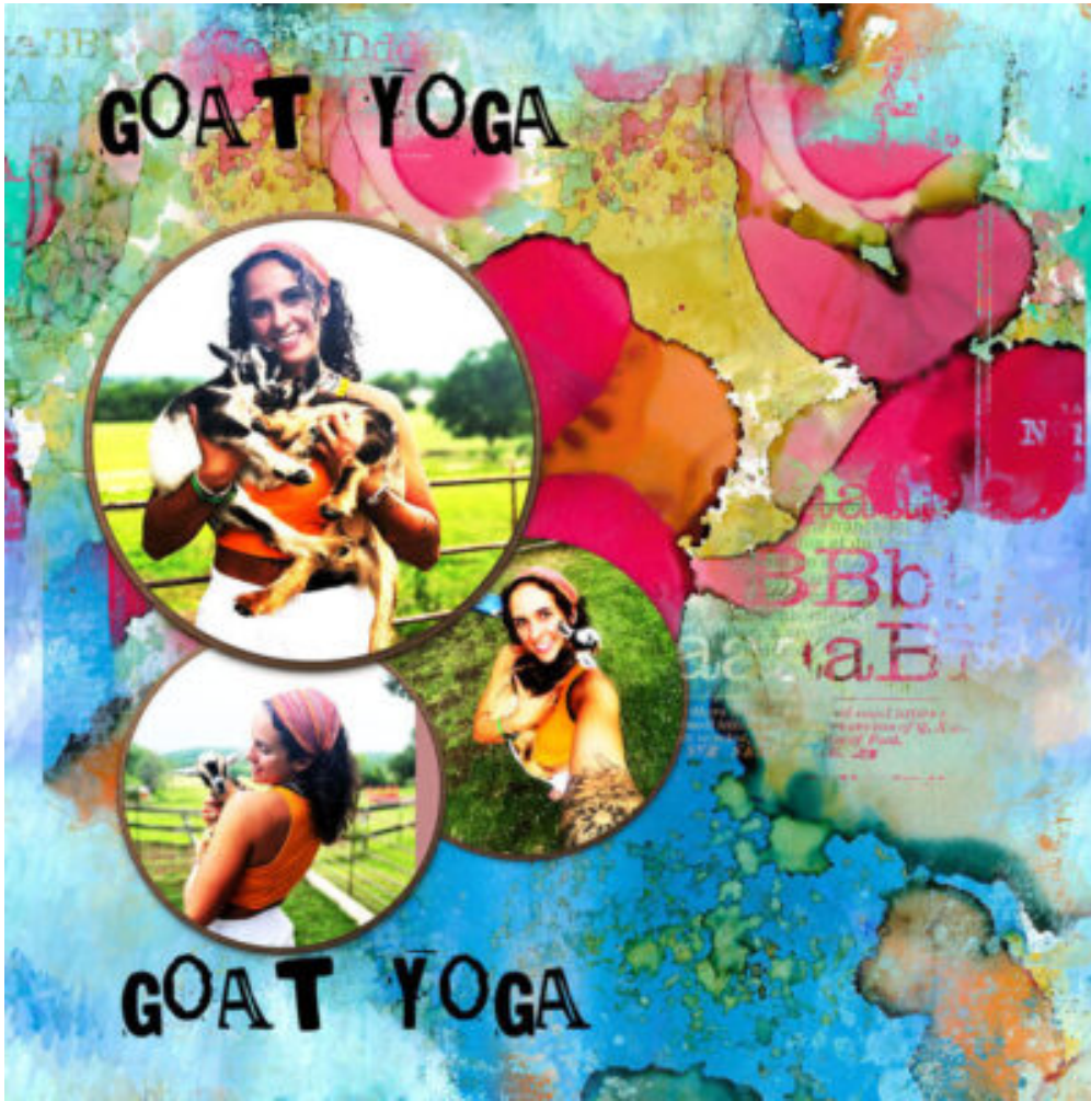
Layout by Cheryl