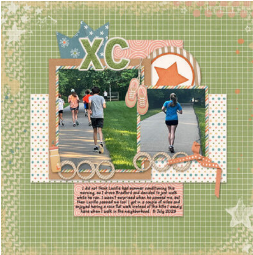
Layout by Lorraine