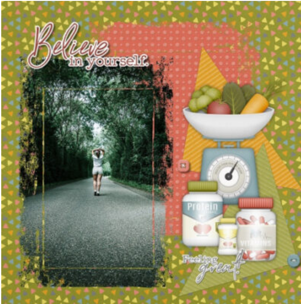
Layout by Denise