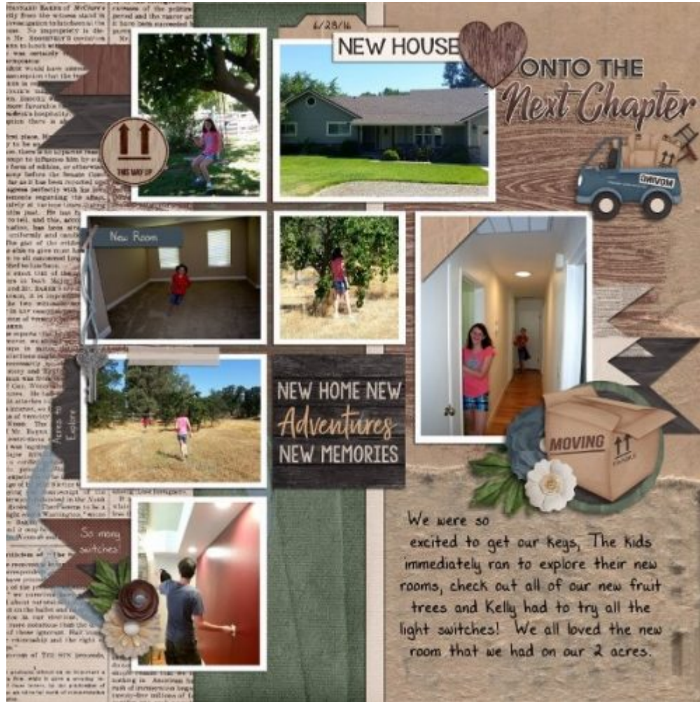
Page by Meagan