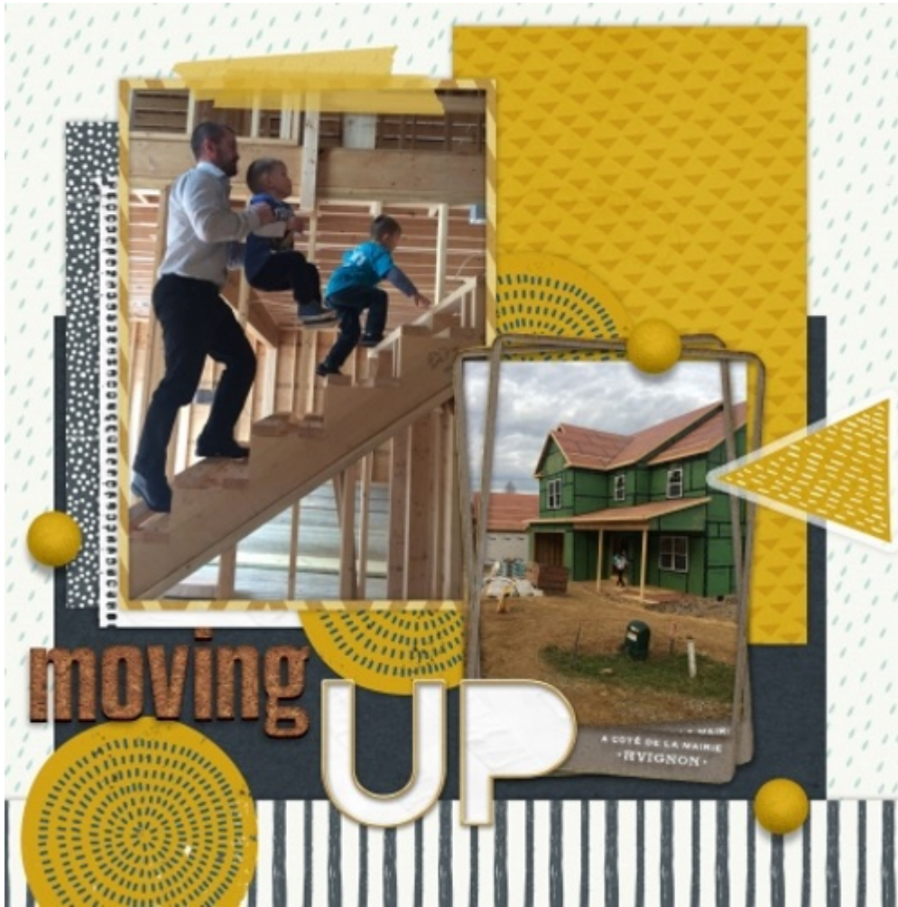
Layout by Erin