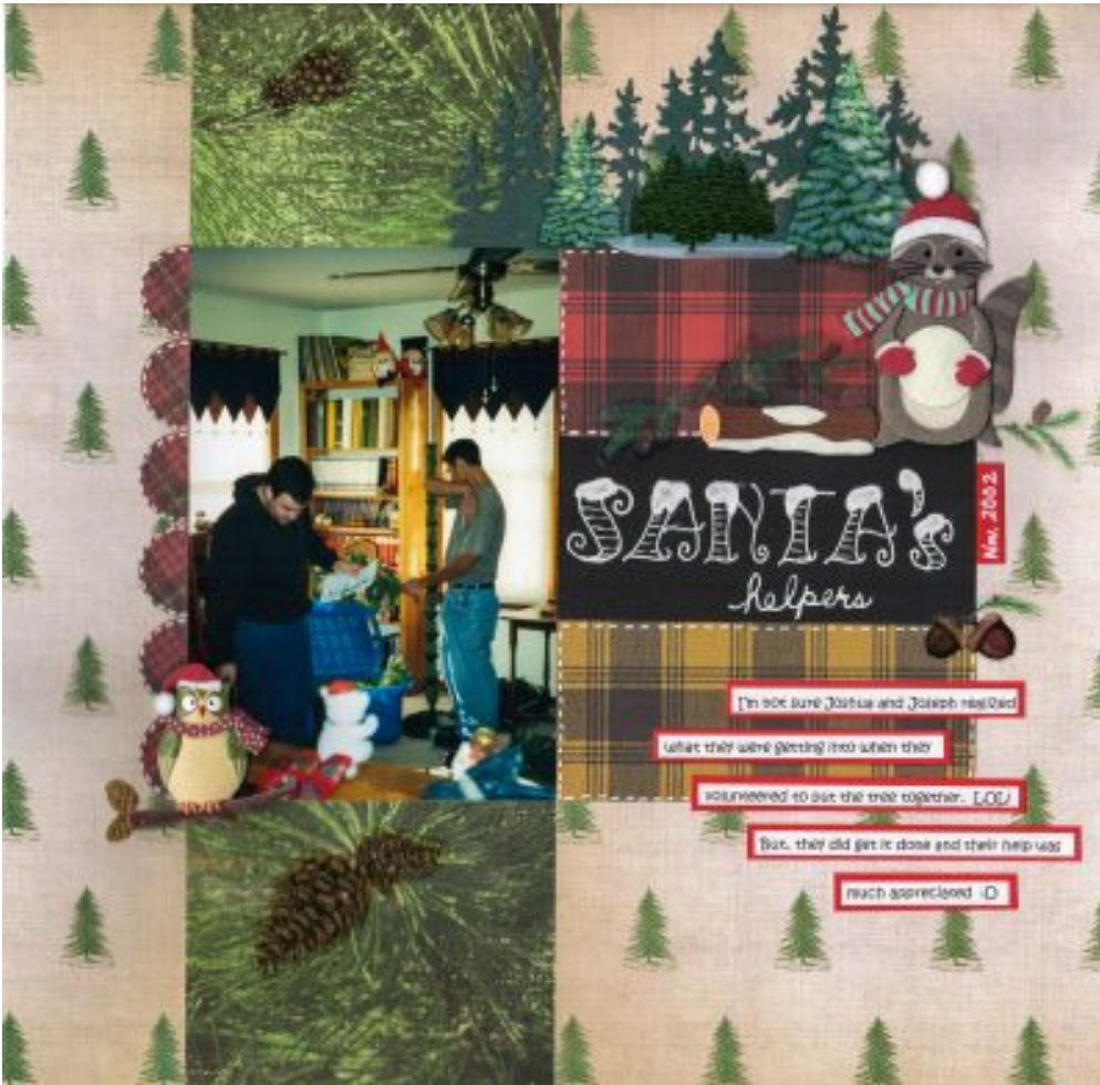
Layout by Betty