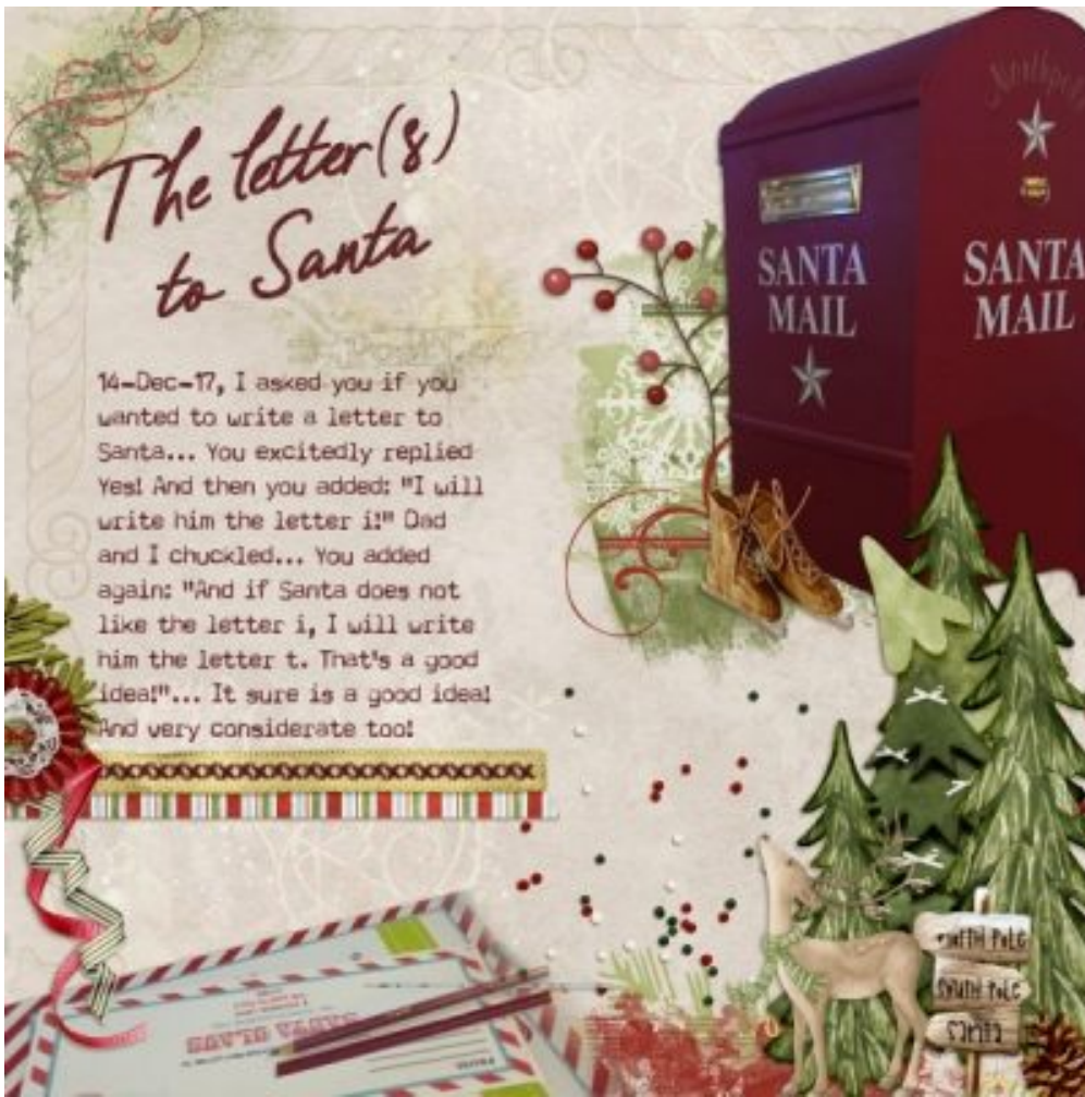
Layout by Lou