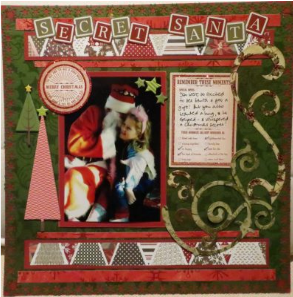
Layout by Rachel