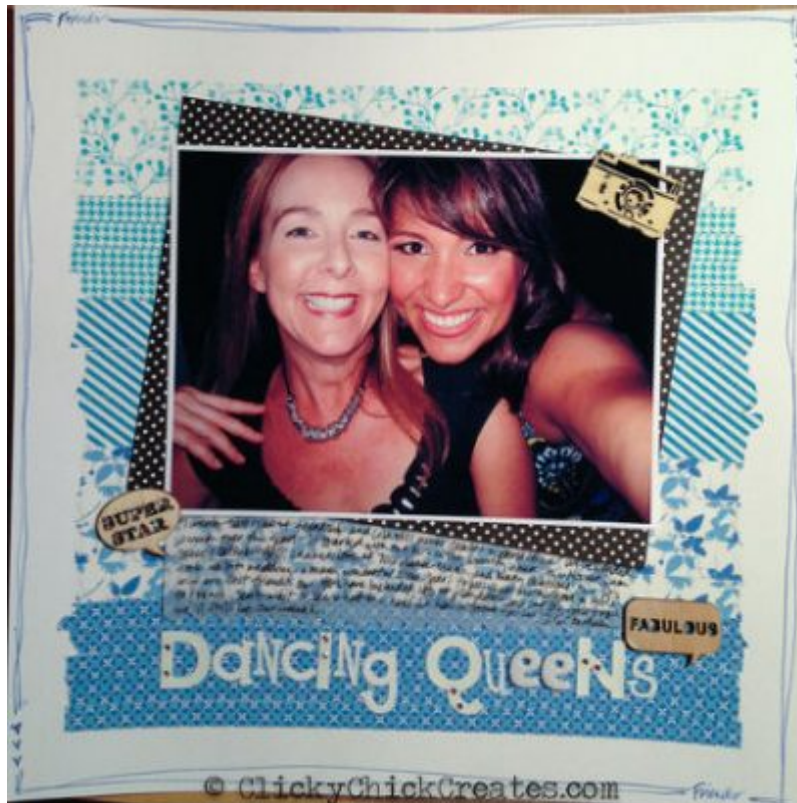
Song title Layout from Connie Hank