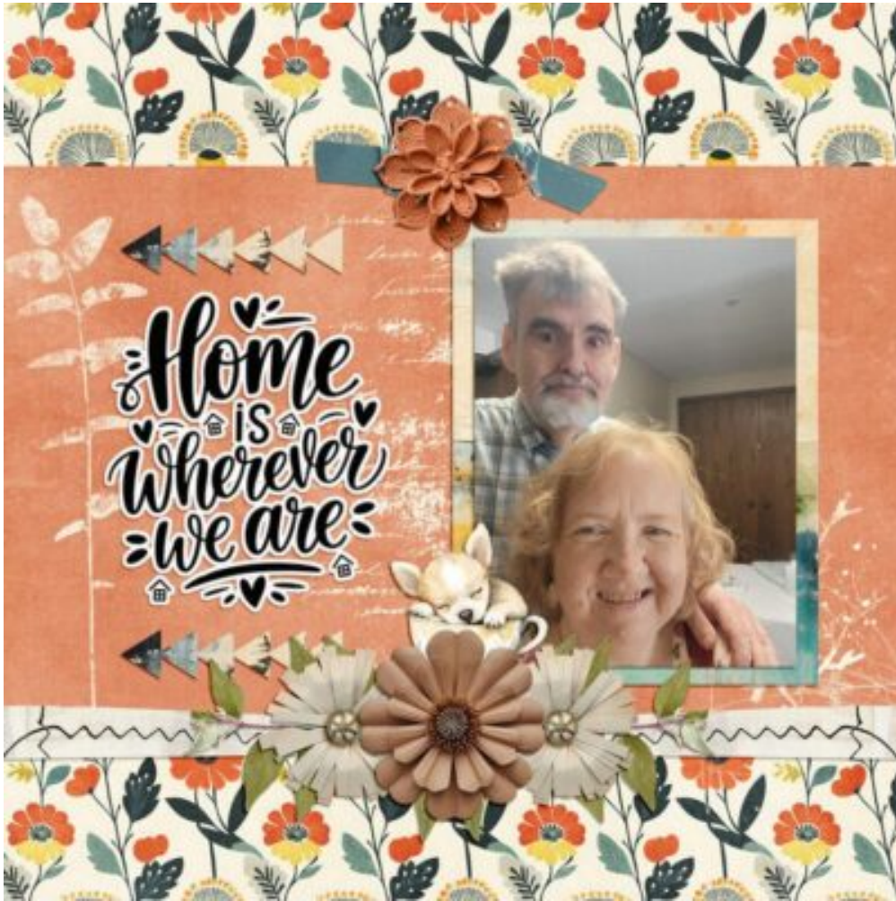
Page by Scribler