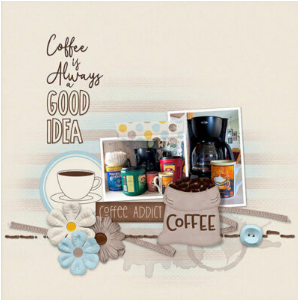
Layout by Joyce