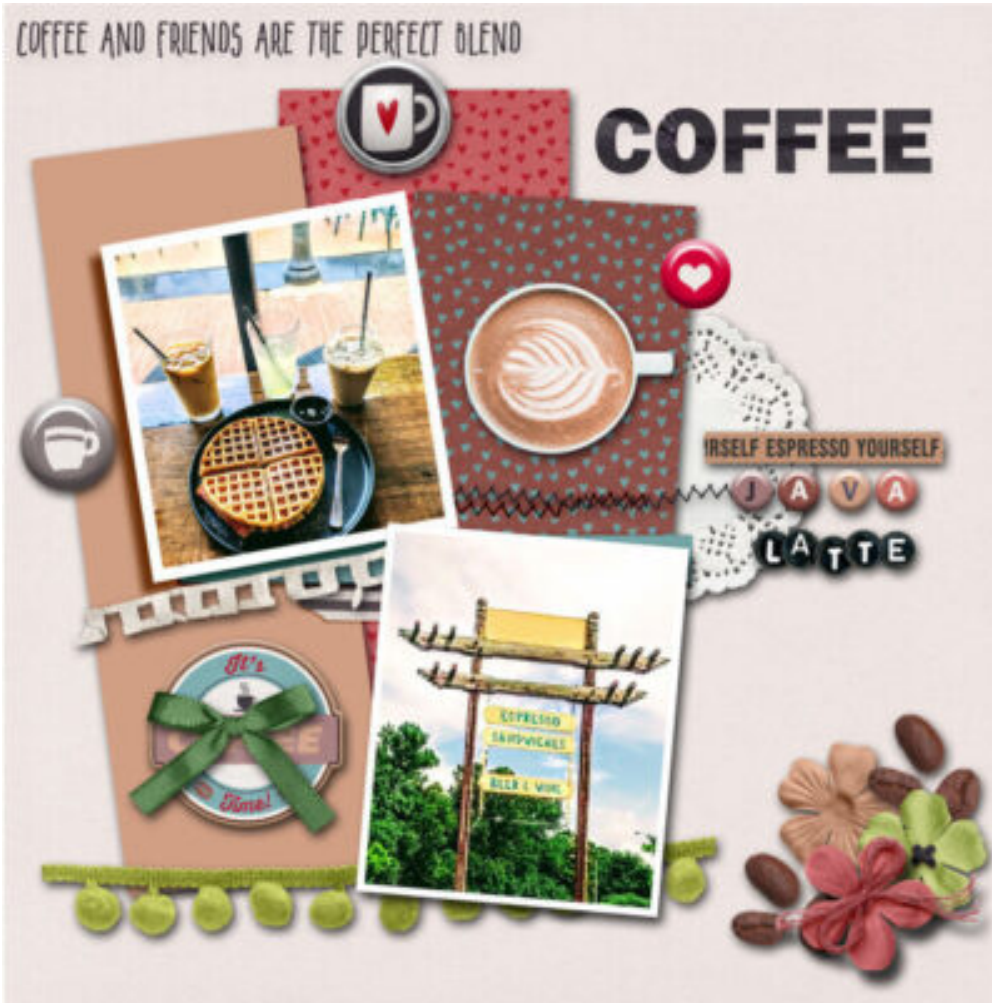
Layout by Cheryl