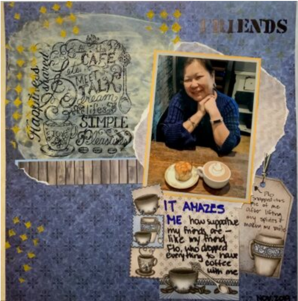
Page by Elissa