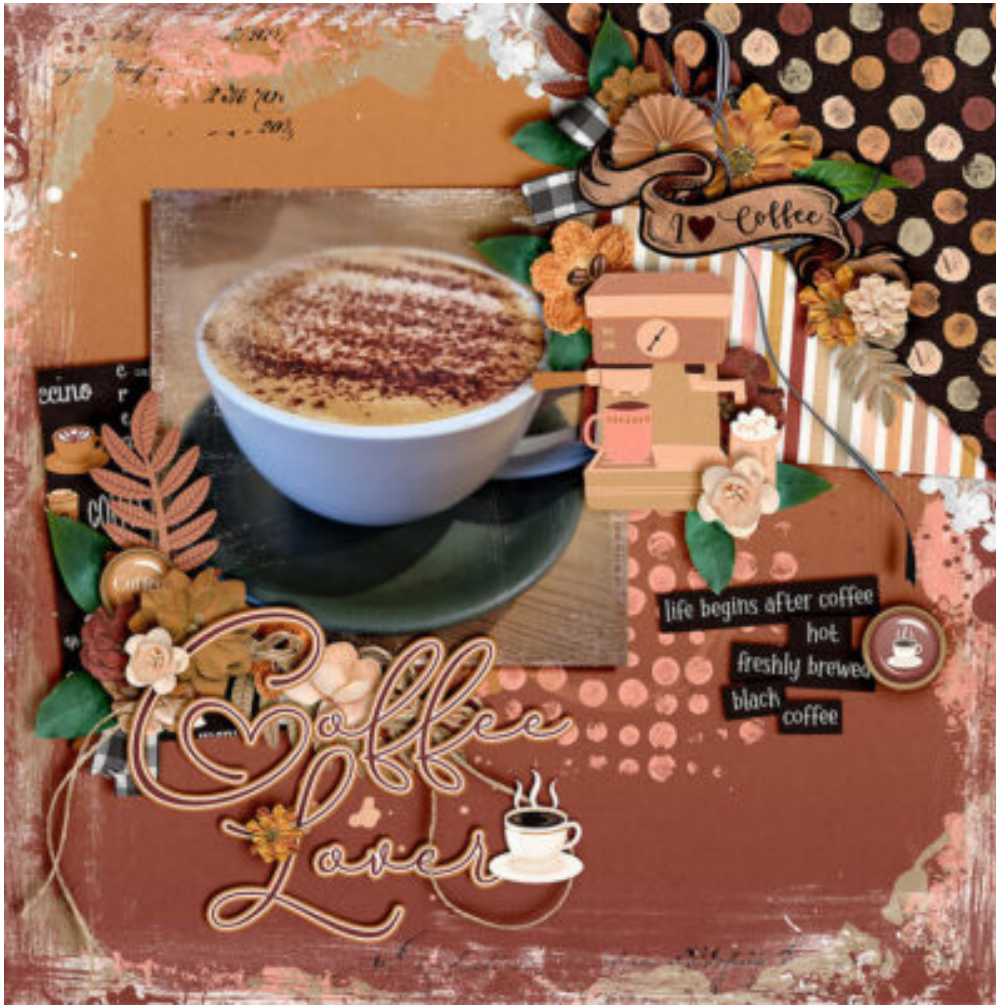
Page by Christelle vandyk