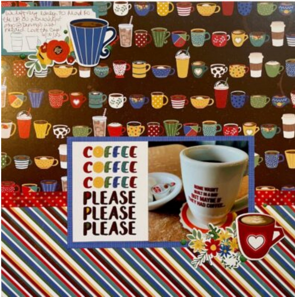
Layout by KeddyO