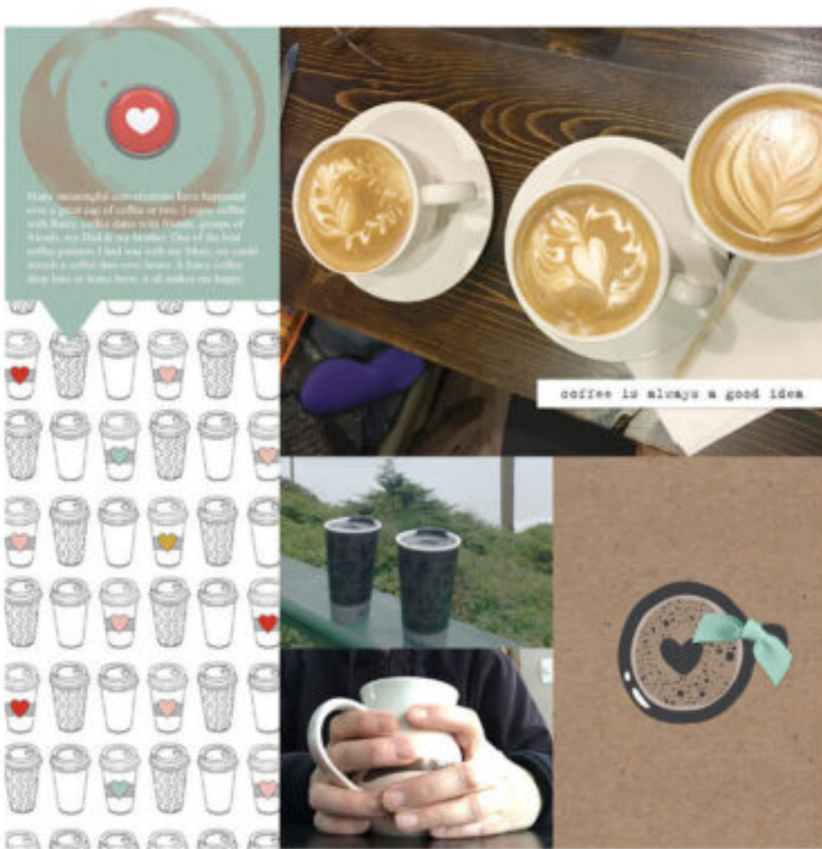
Layout by Candy