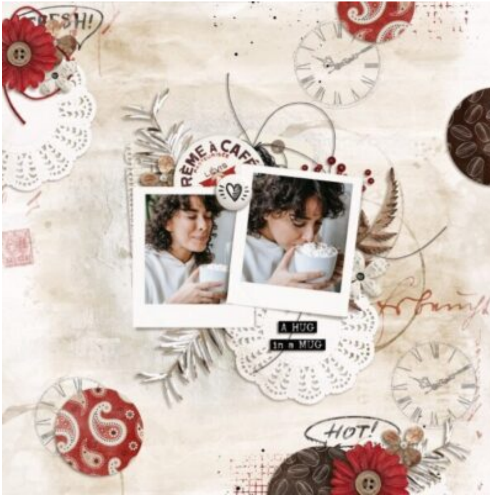
Layout by Lou