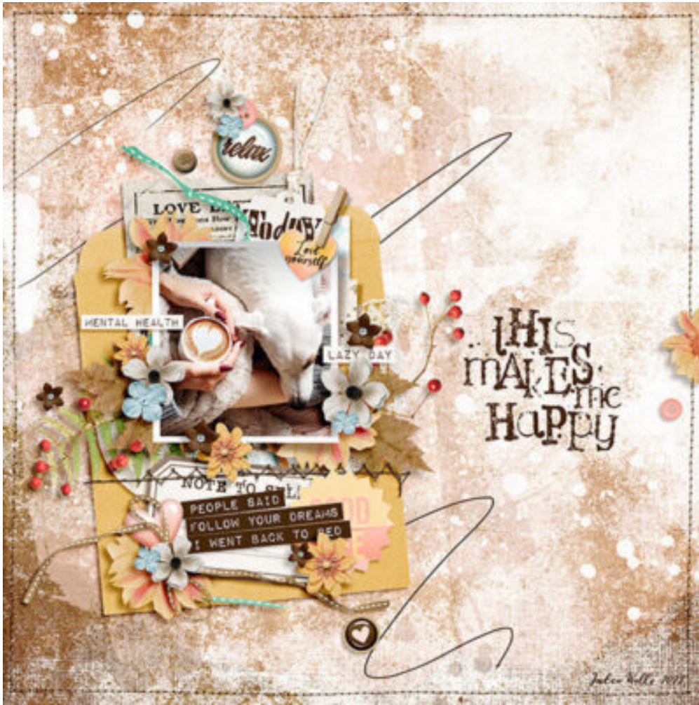
Layout by Julie