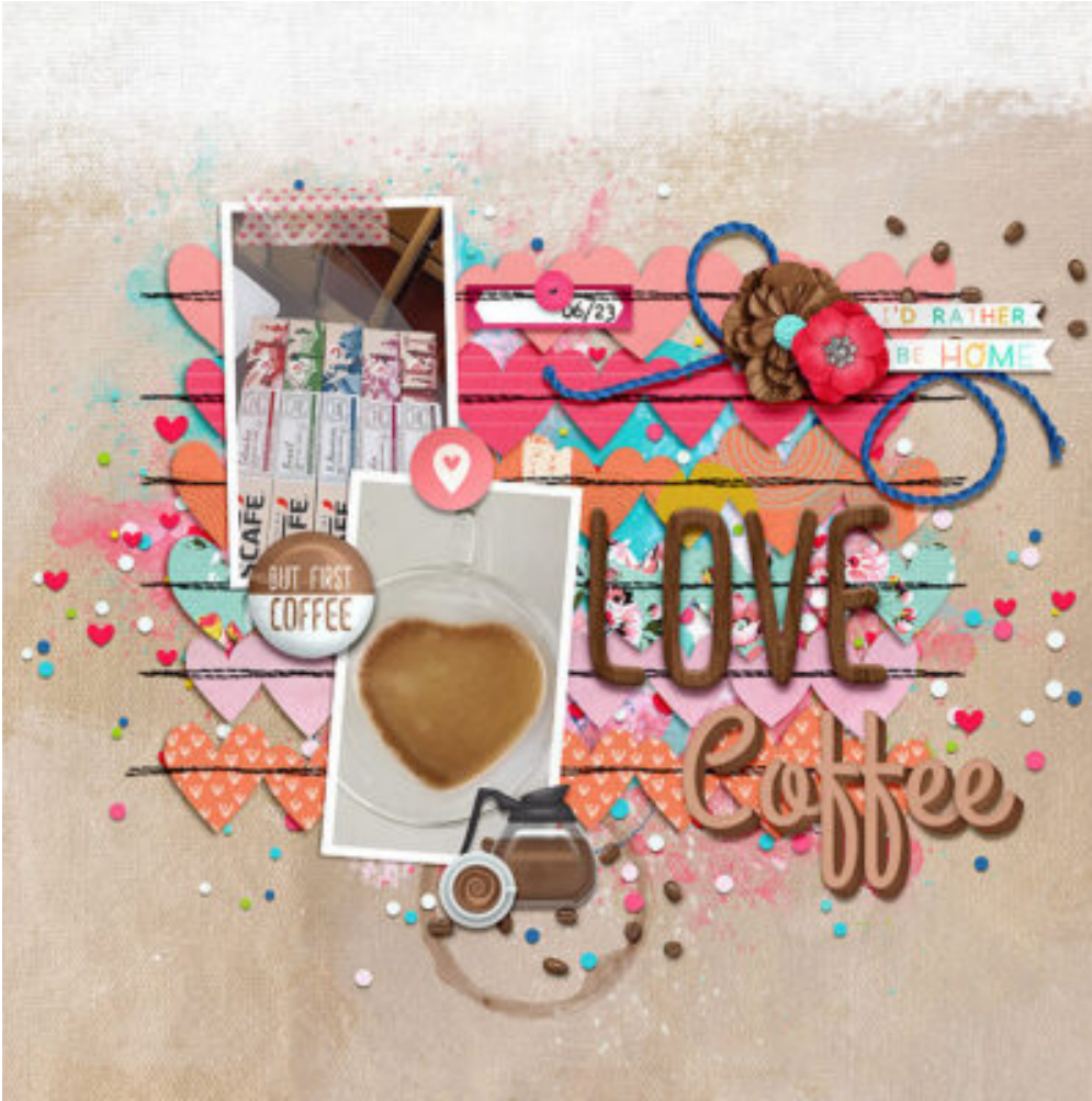
Layout by Ferdy