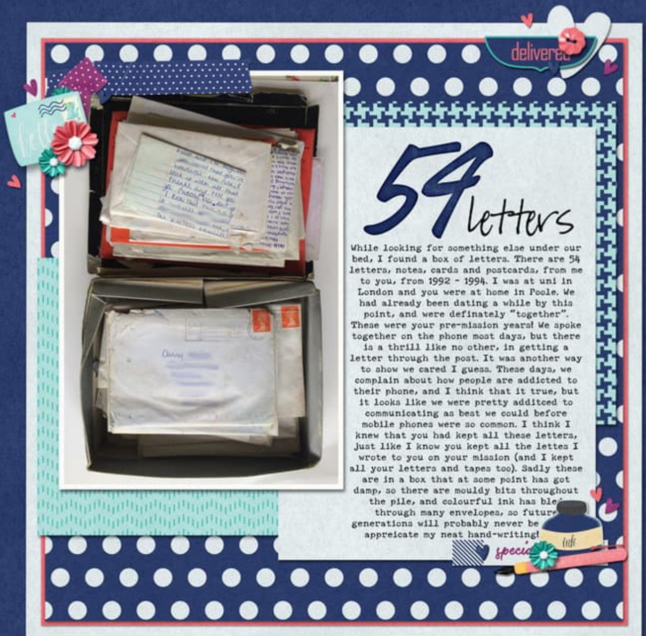
Layout by Corrin