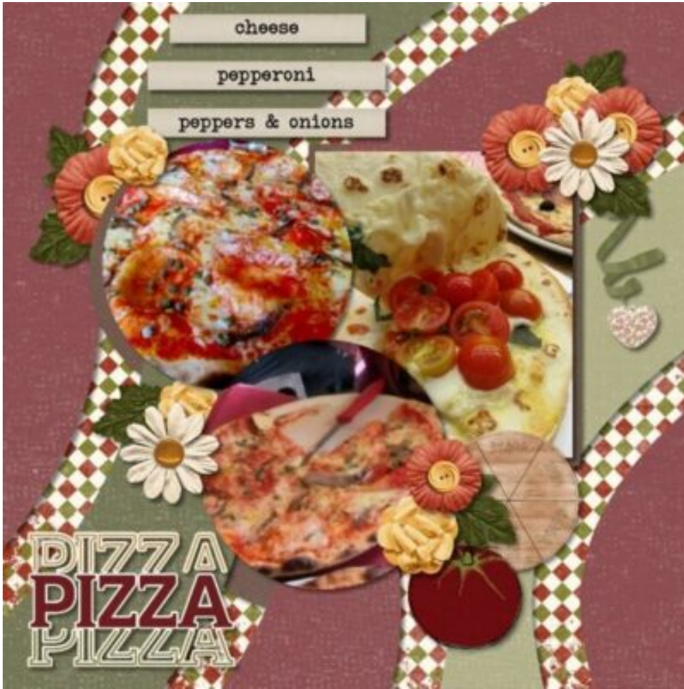
Layout by Maureen