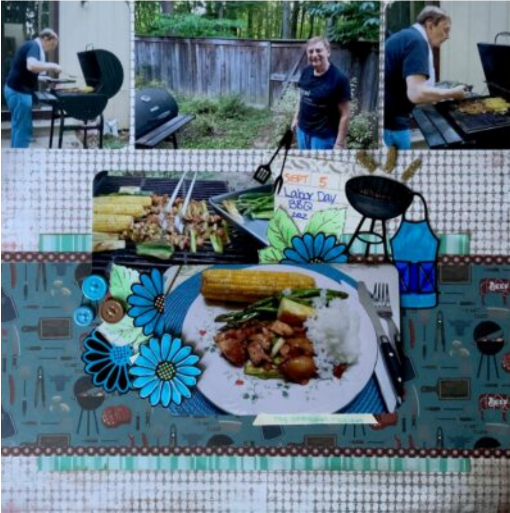
Page by Lis