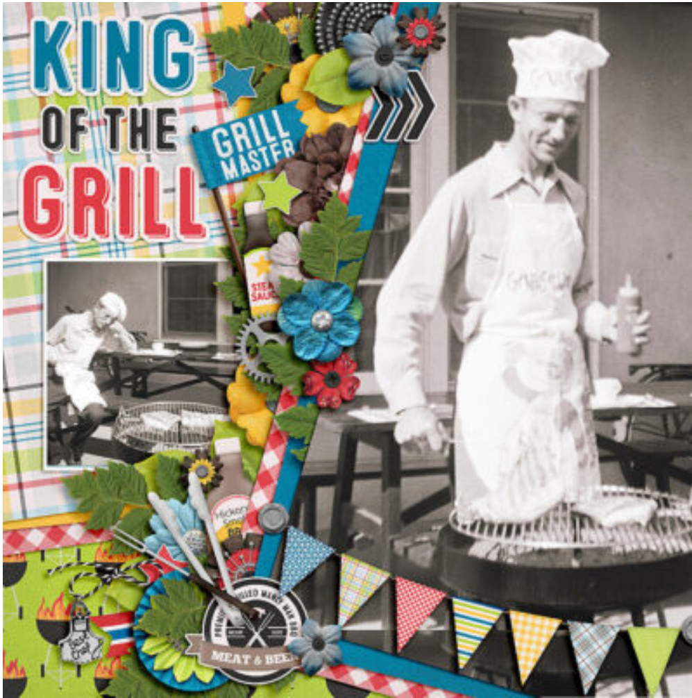
Layout by Tammy