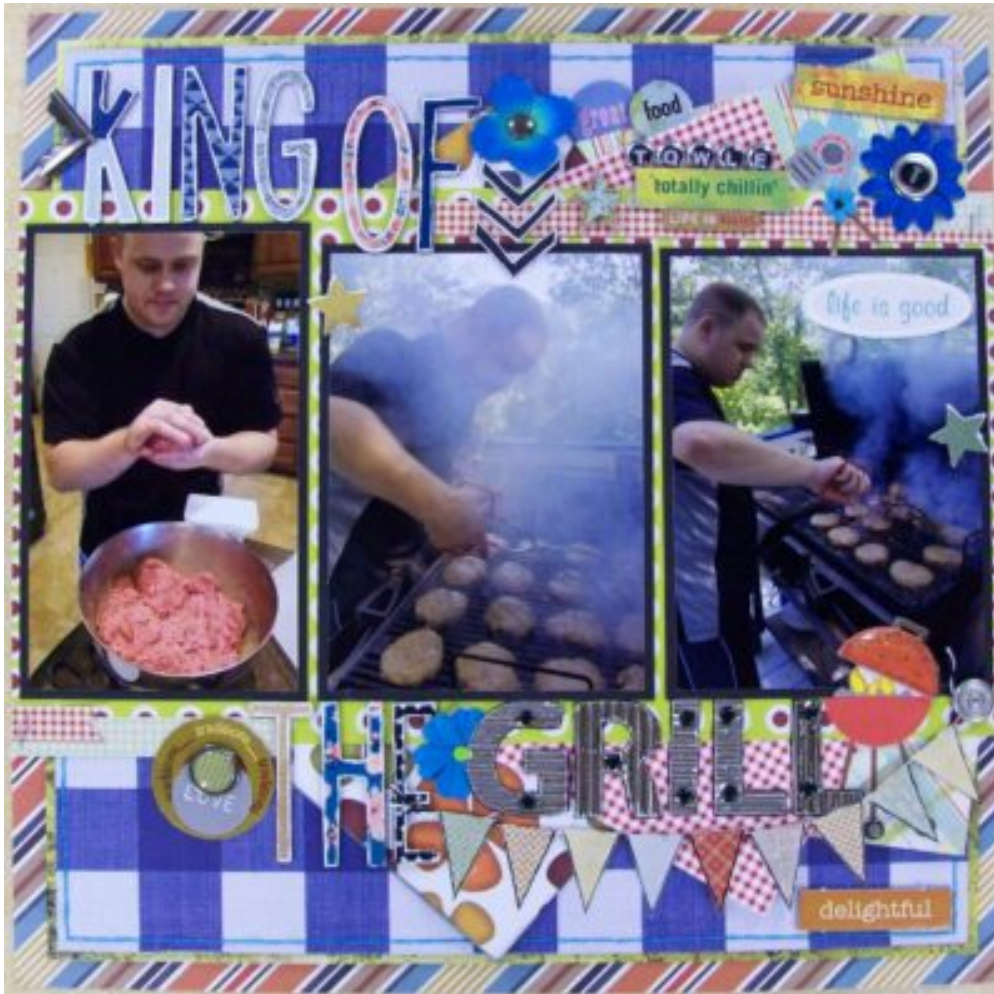
Layout by Justowen