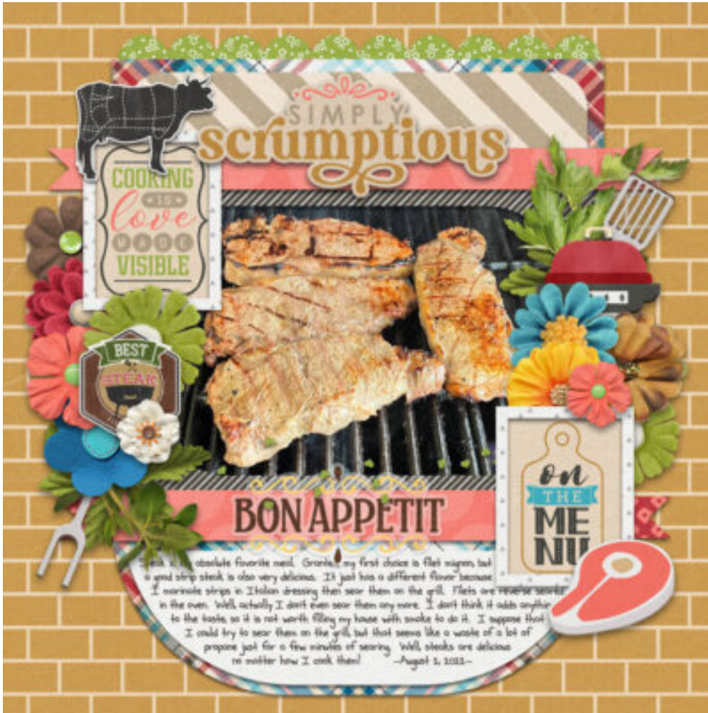
Layout by LynnZant