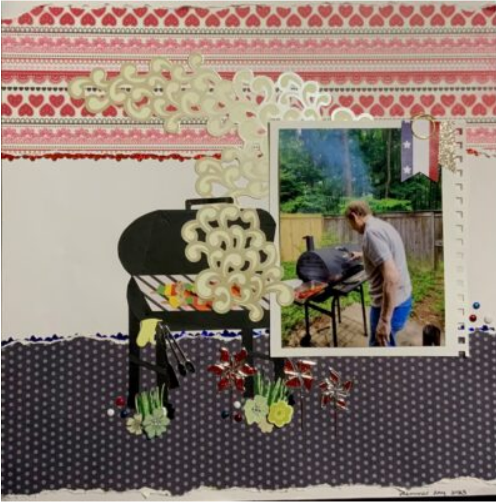
Layout by Lis