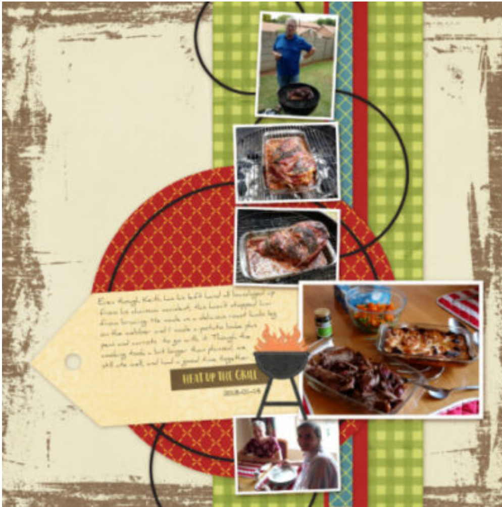
Layout by Cathy