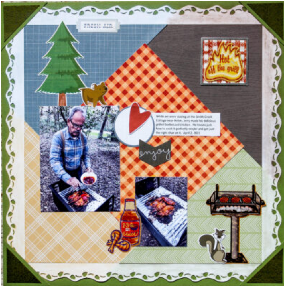
Layout by Betty