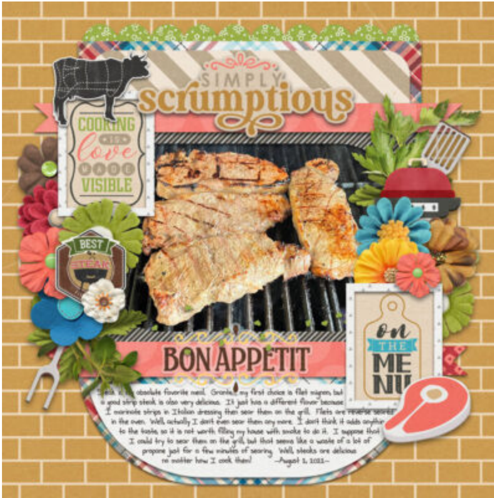
Layout by LynnZant