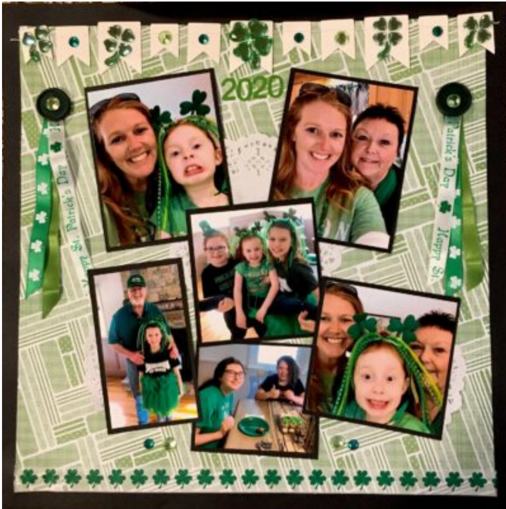
Layout by Grammy Scrapper