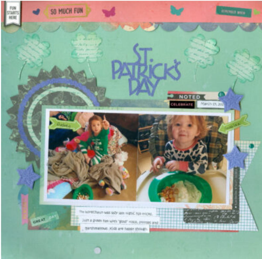
Page by Pam