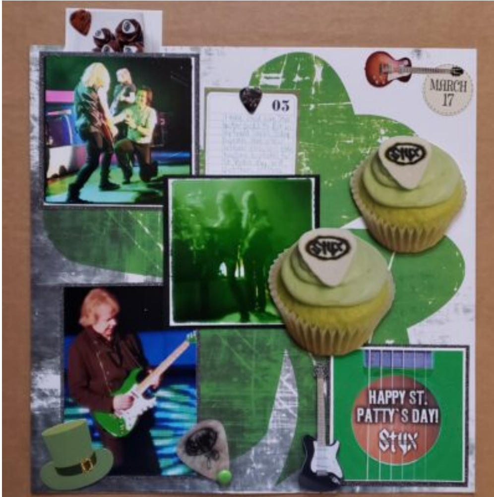
Page by Patti