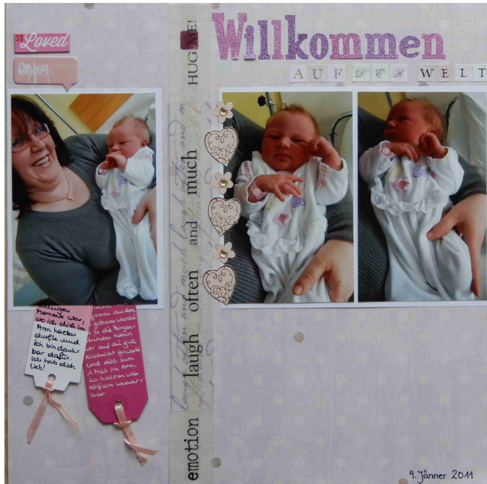
Layout by Susi