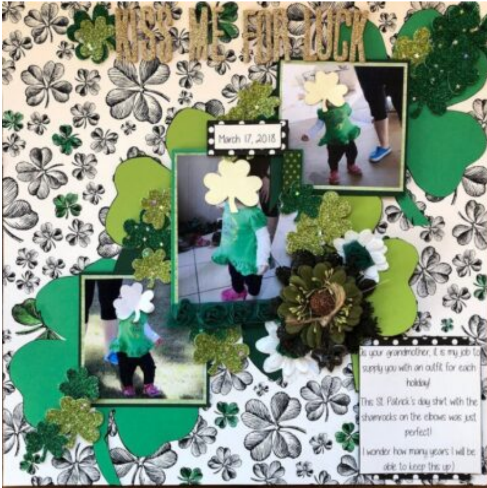
Layout by Jean