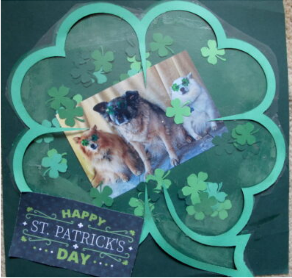
Layout by Cloverlady