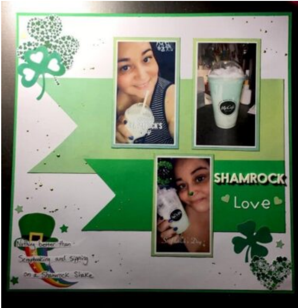
Layout by Ozelle