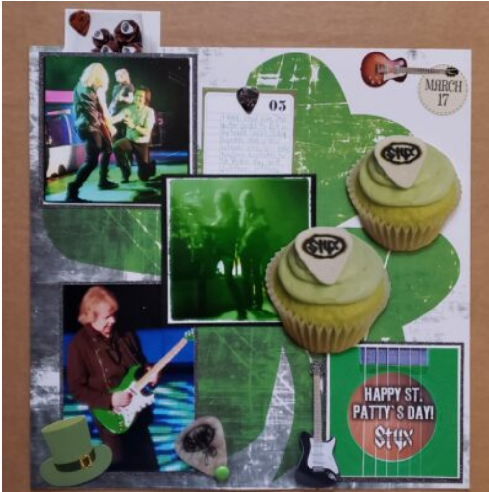
Layout by Patti