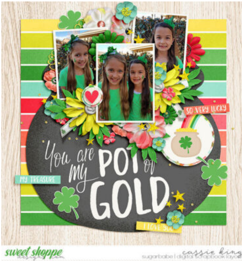
Layout by Cassie