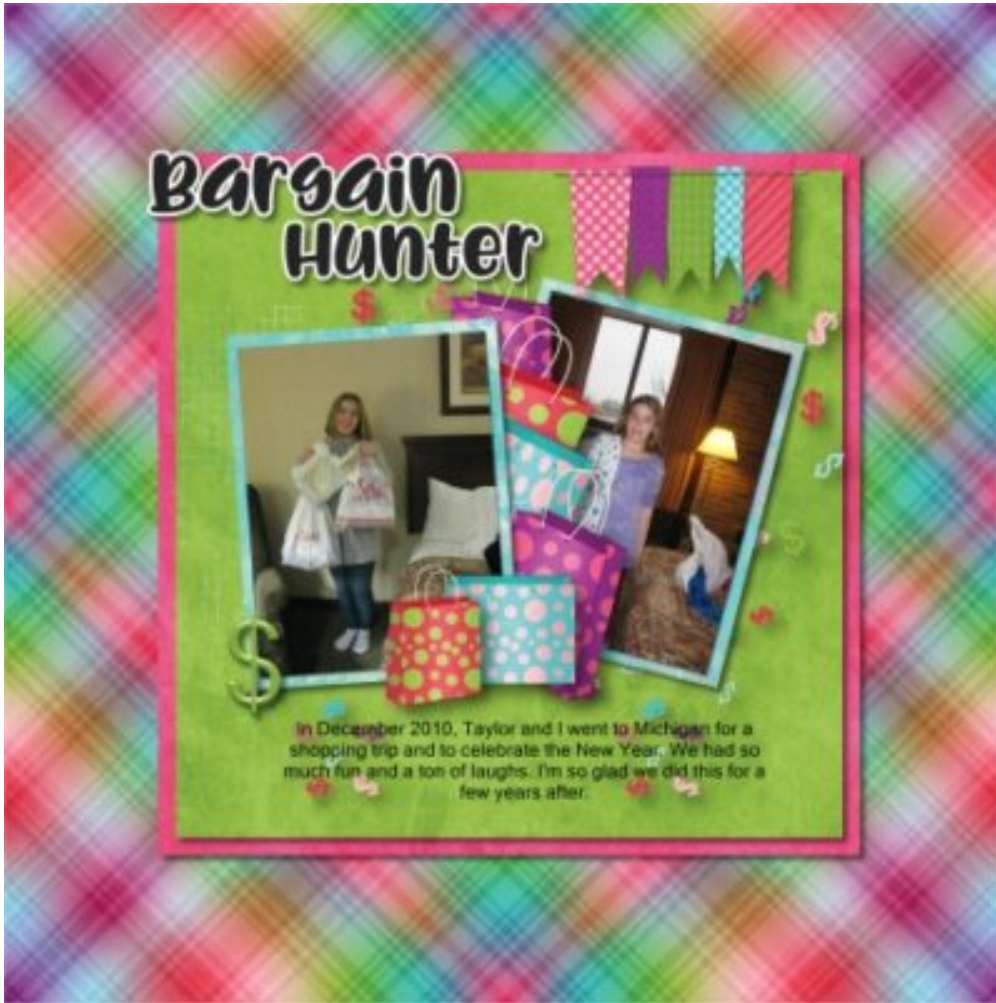
Layout by Ruth