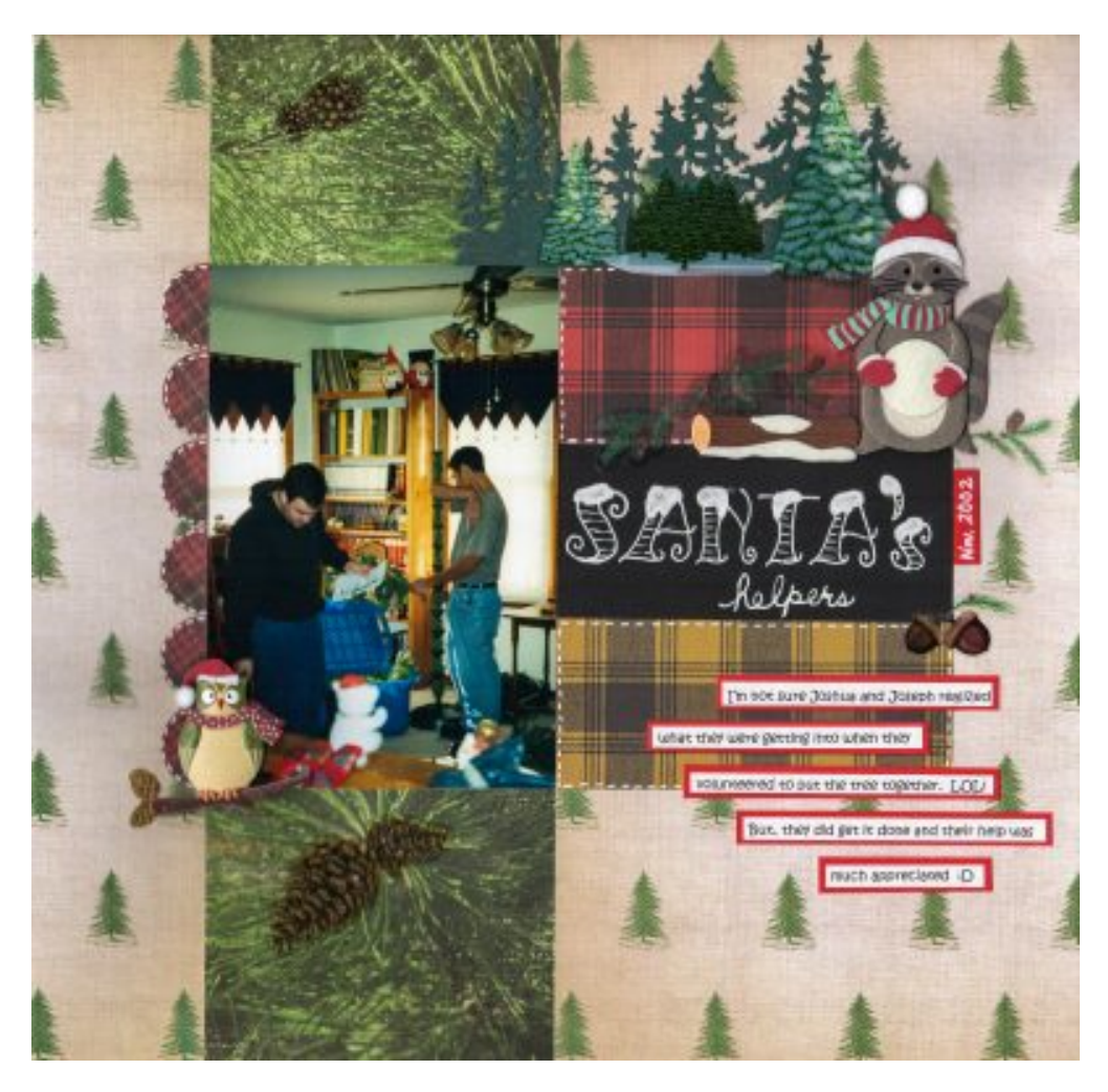
Layout by Betty