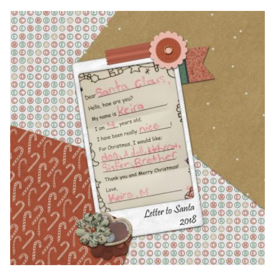
Layout by Shannon