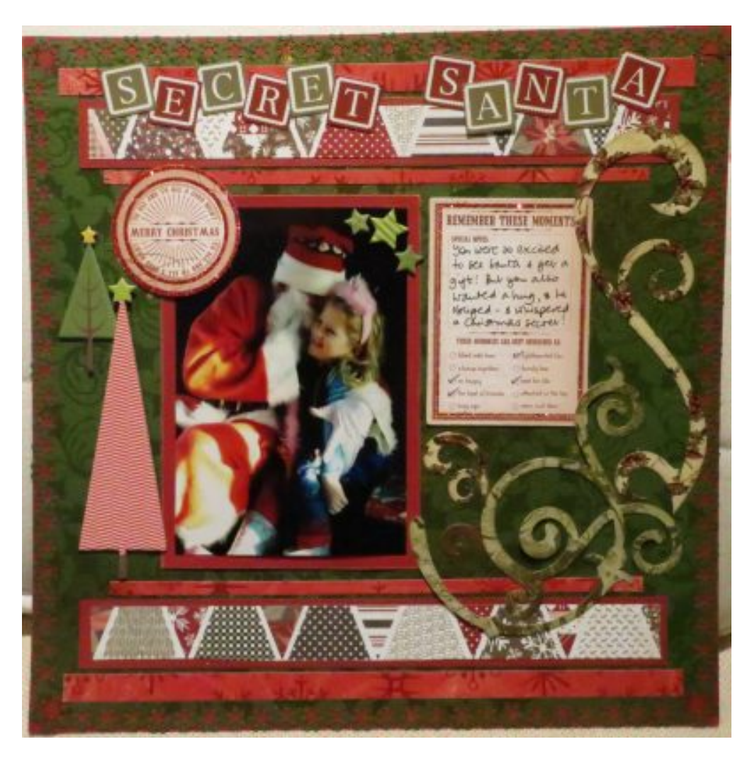
Layout by Rachel