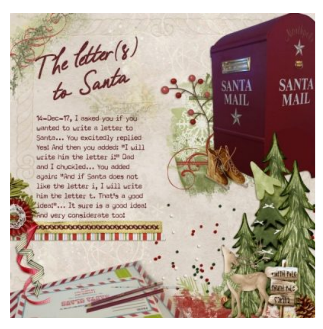
Layout by Lou