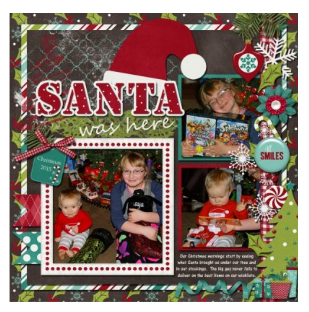
Layout by Dee