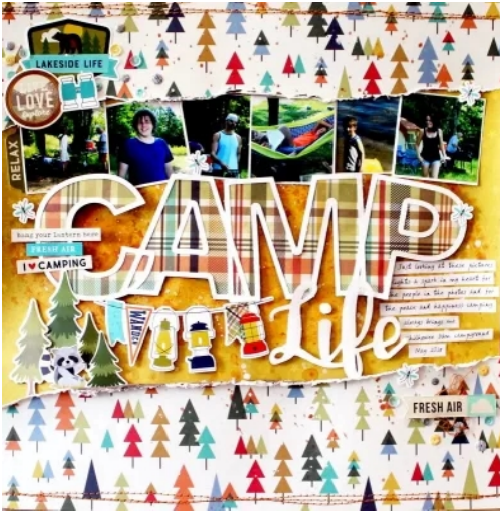
Layout by RhondaR