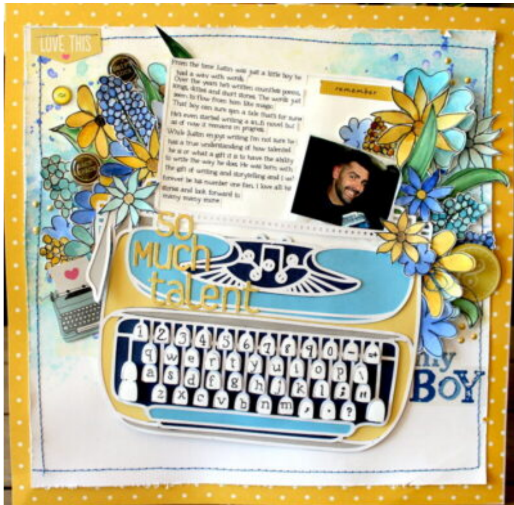
Layout by RhondaR