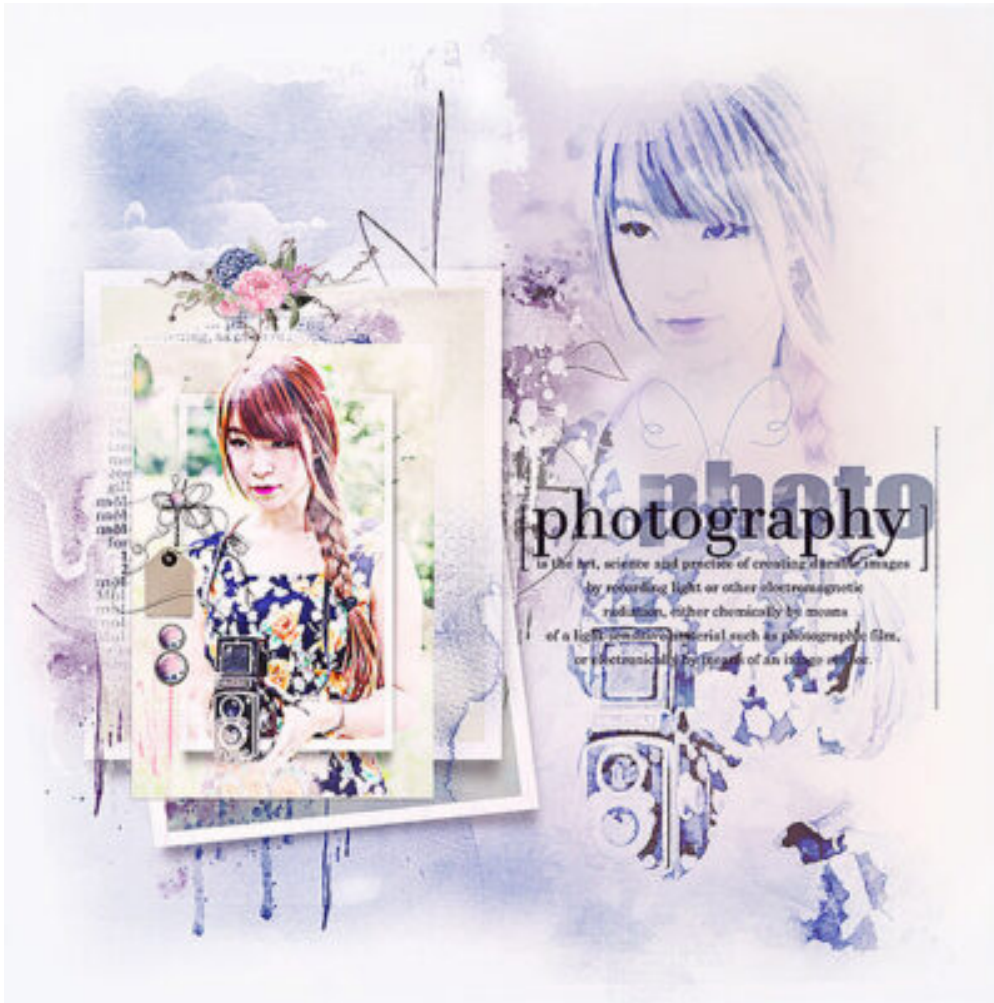
Layout by Marianne