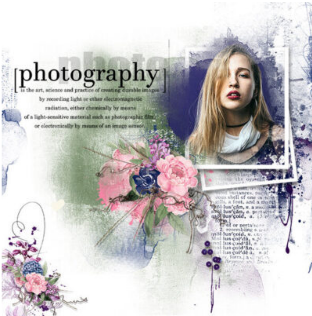
Page by Sylvia