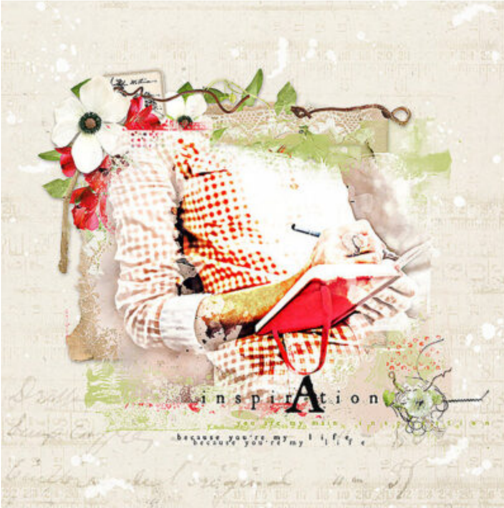
Layout by Marianne