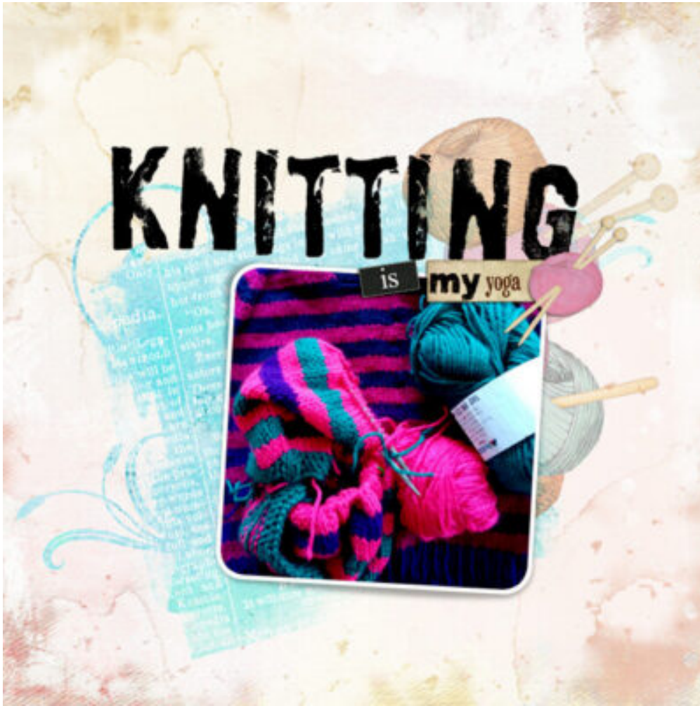
Layout by Eva