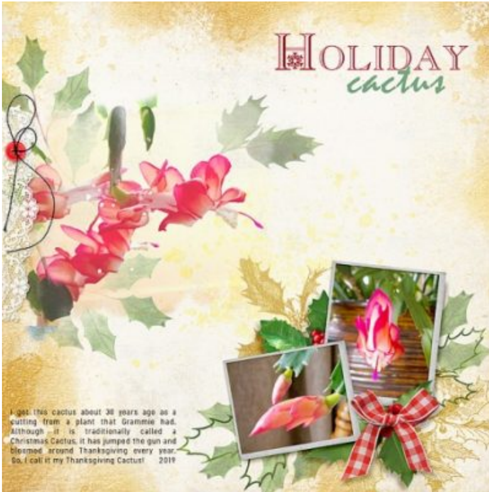
Layout by Angie