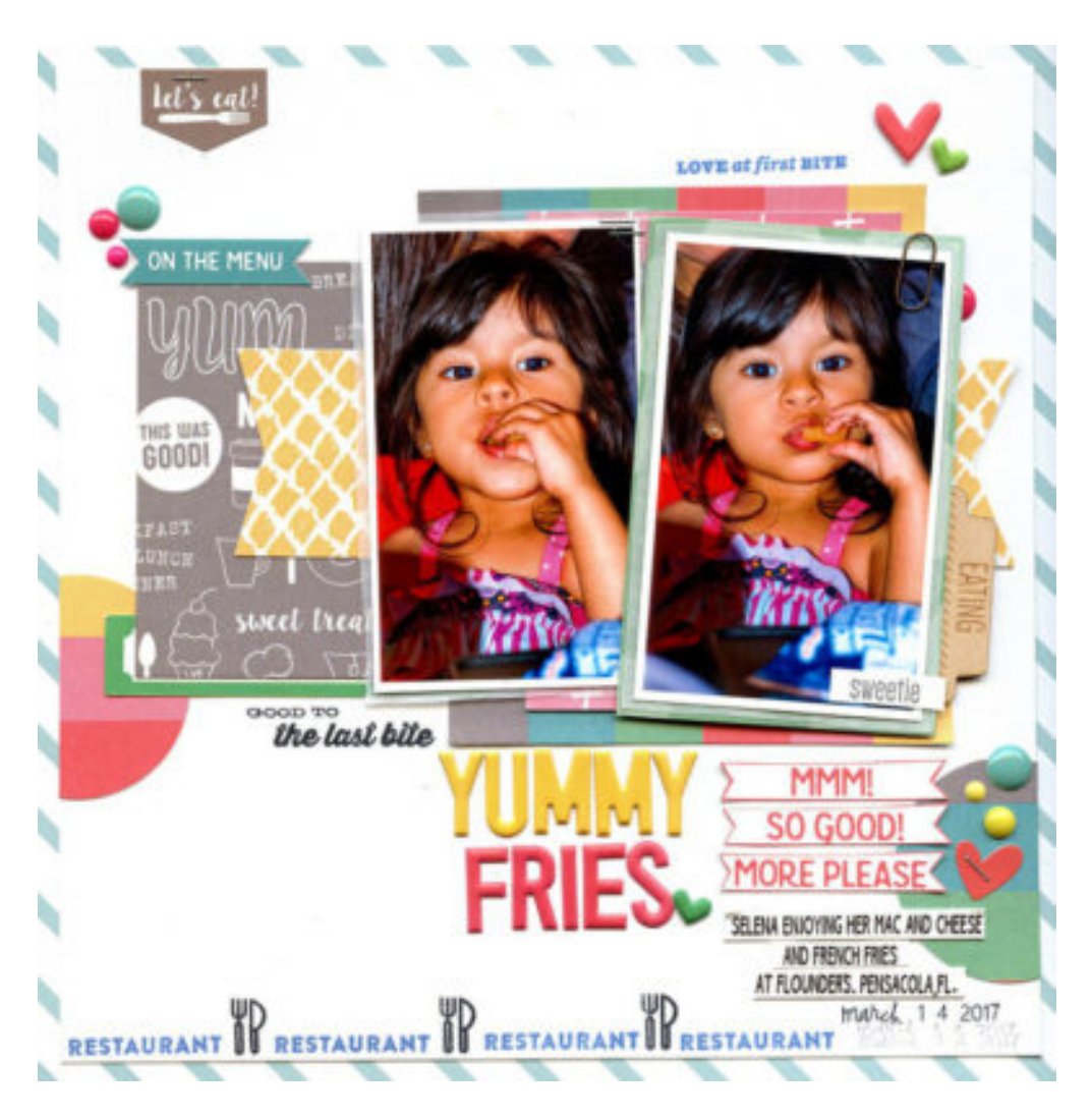
Layout by SJ Luvscrappin