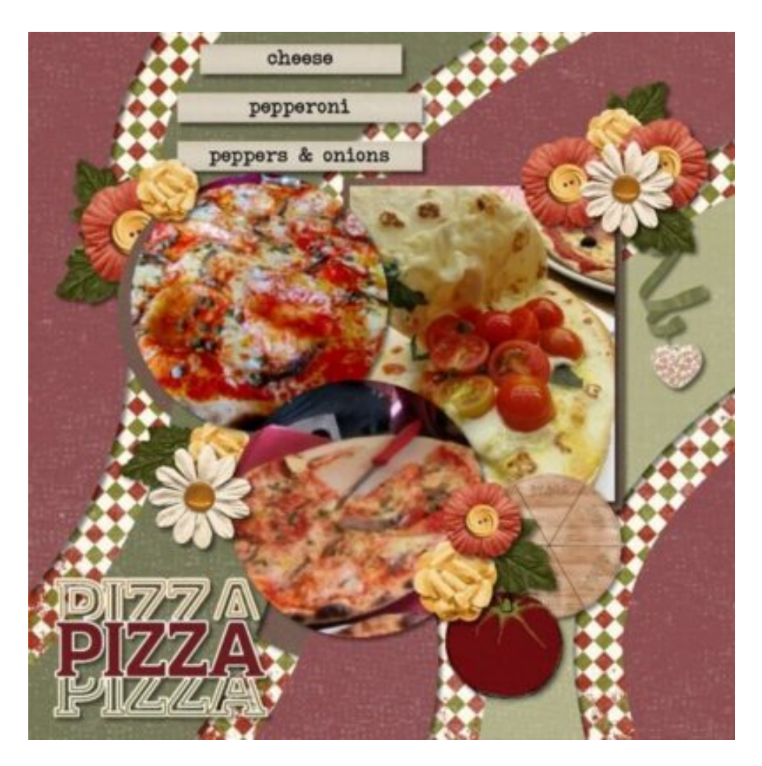
Layout by Maureen