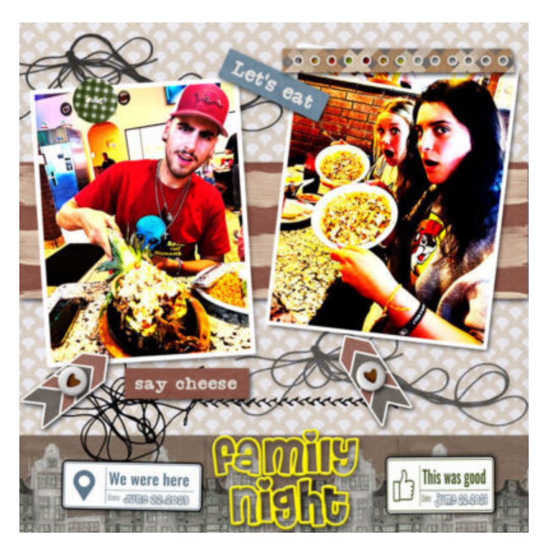
Layout by Cheryl