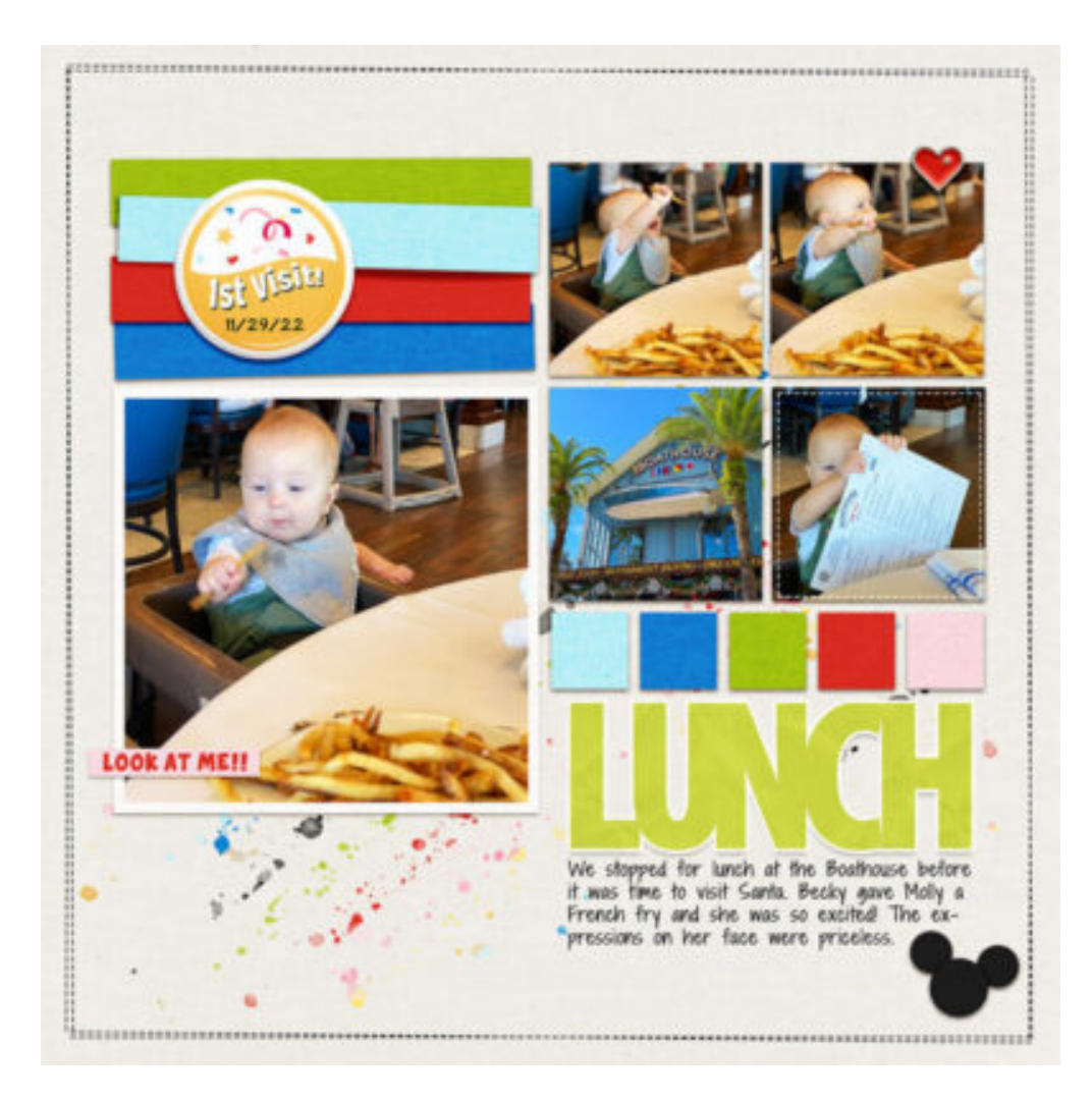
Layout by Donna