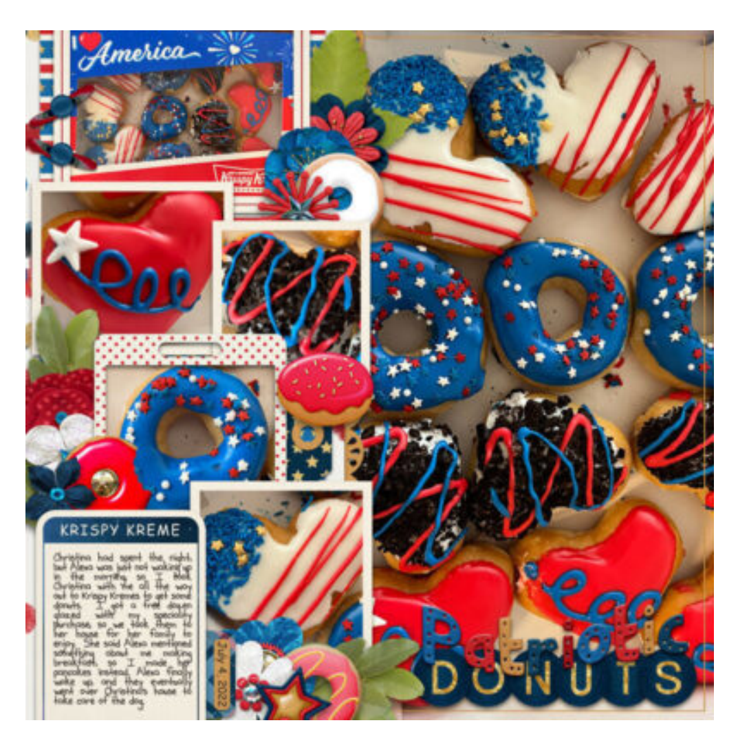
Layout by LynnZant