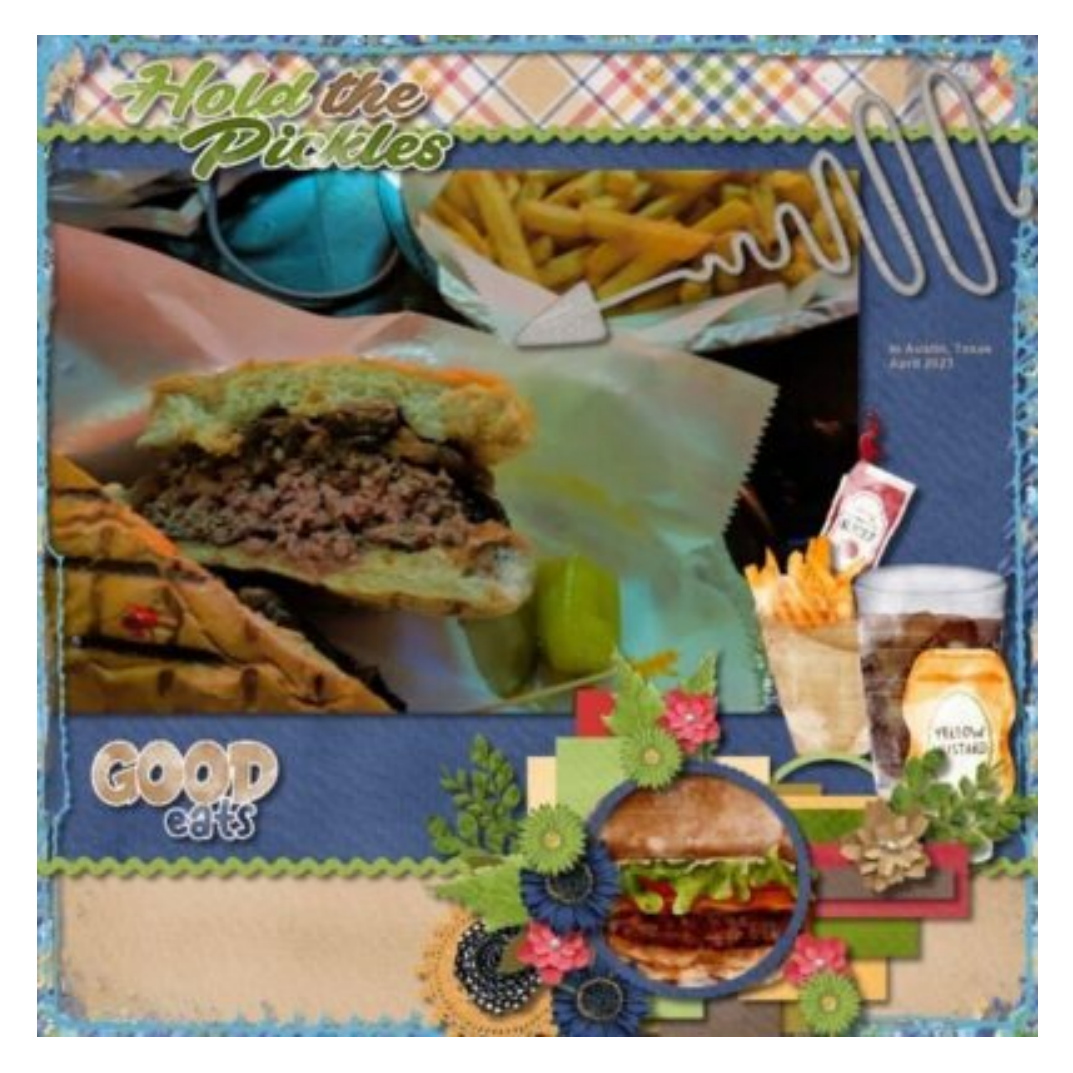
Layout by Maureen