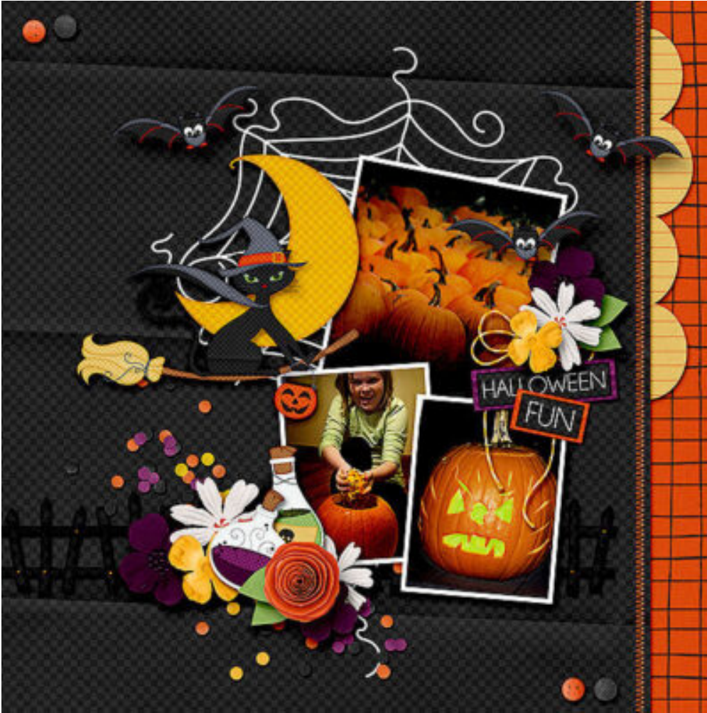
Layout by AmaneseFe