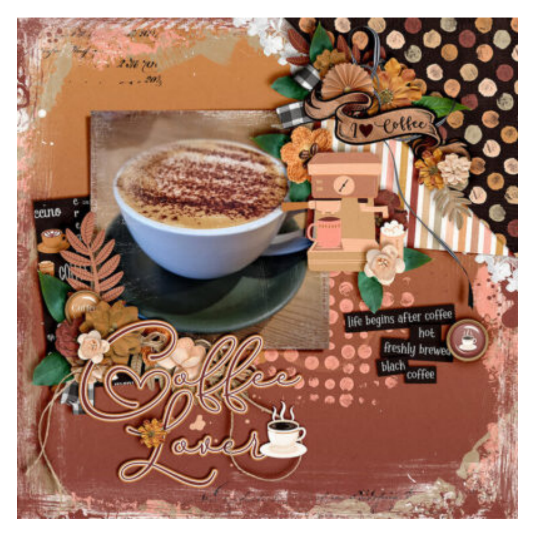
Page by Christellevandyk