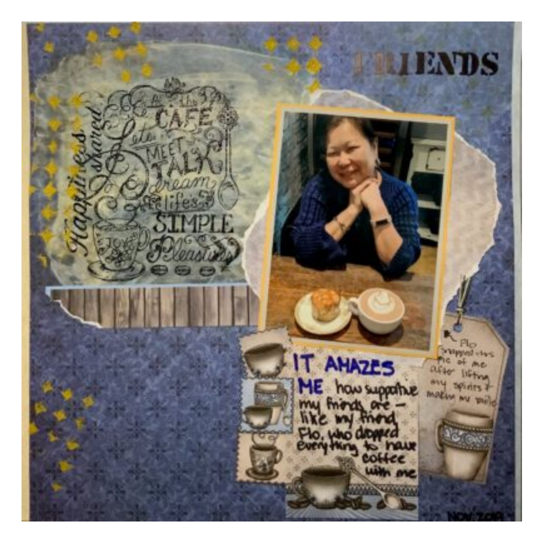
Page by Elissa