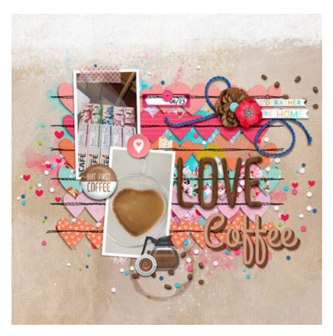
Layout by Ferdy