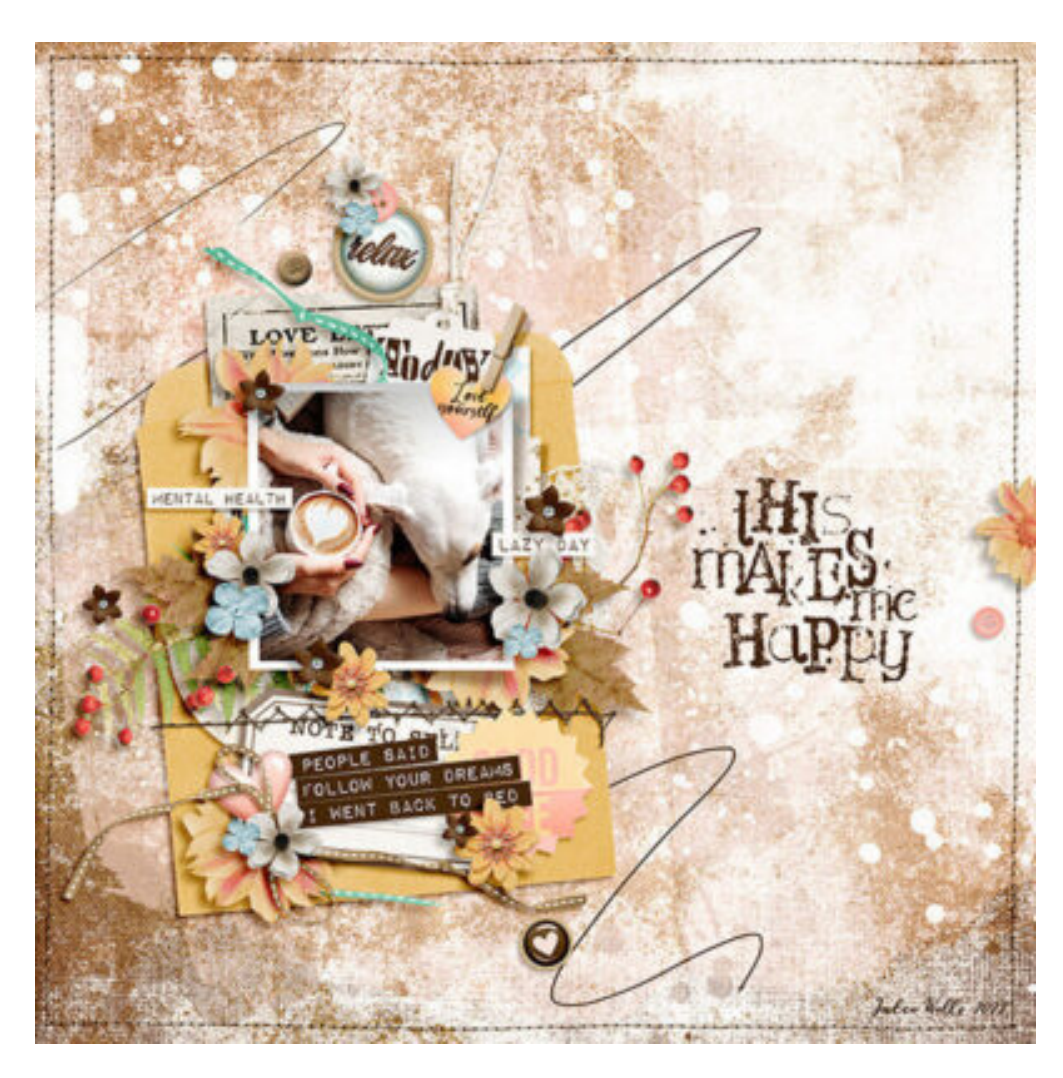
Layout by Julie