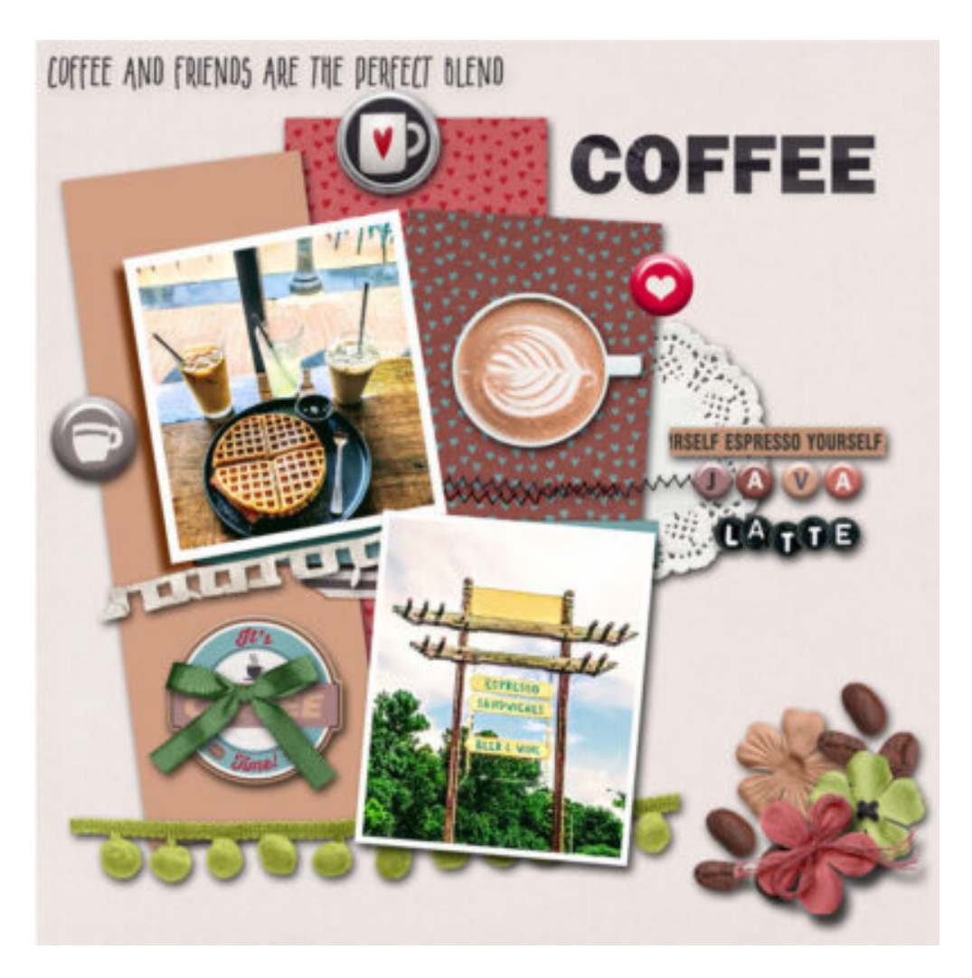
Layout by Cheryl