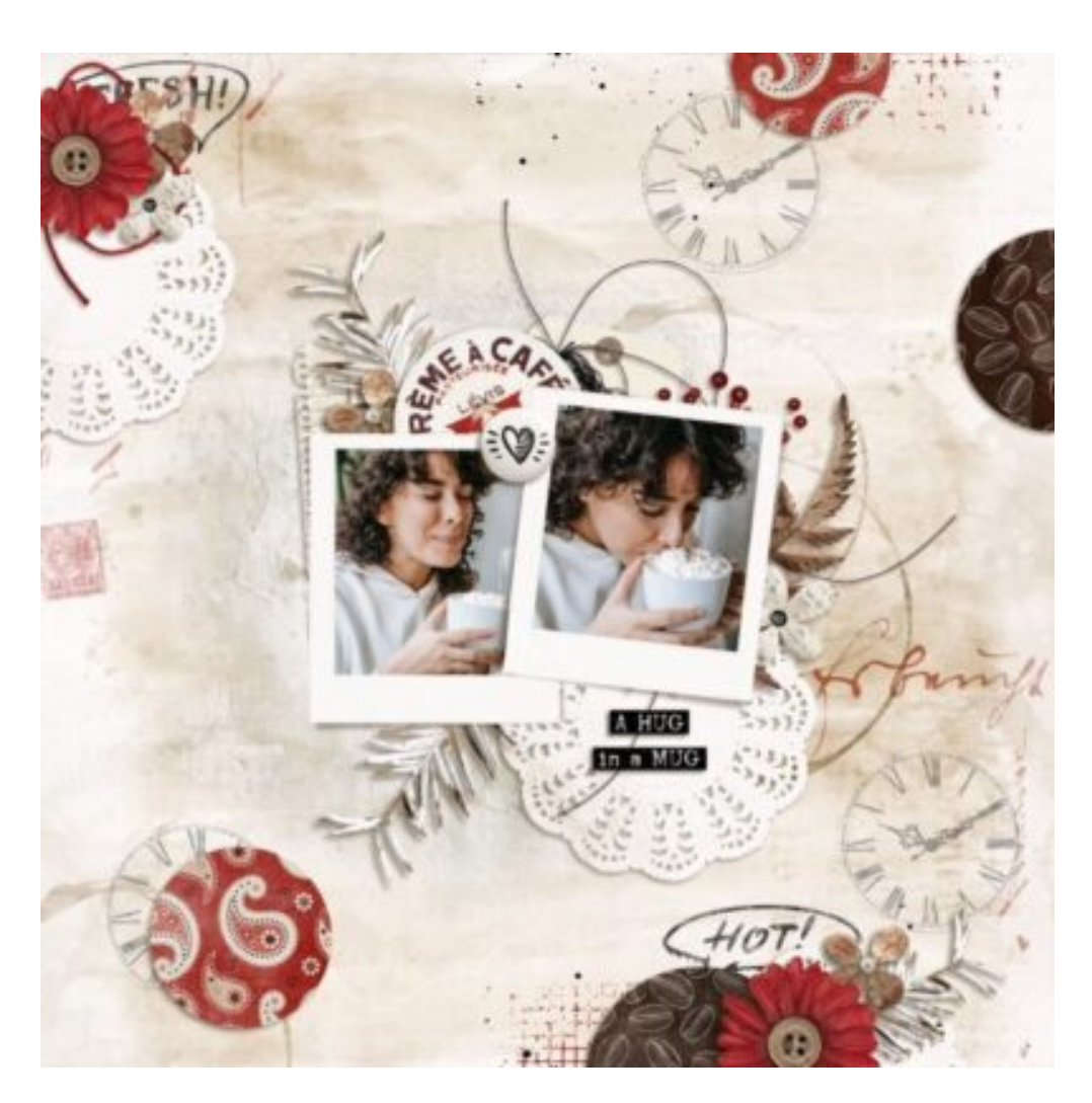
Layout by Lou