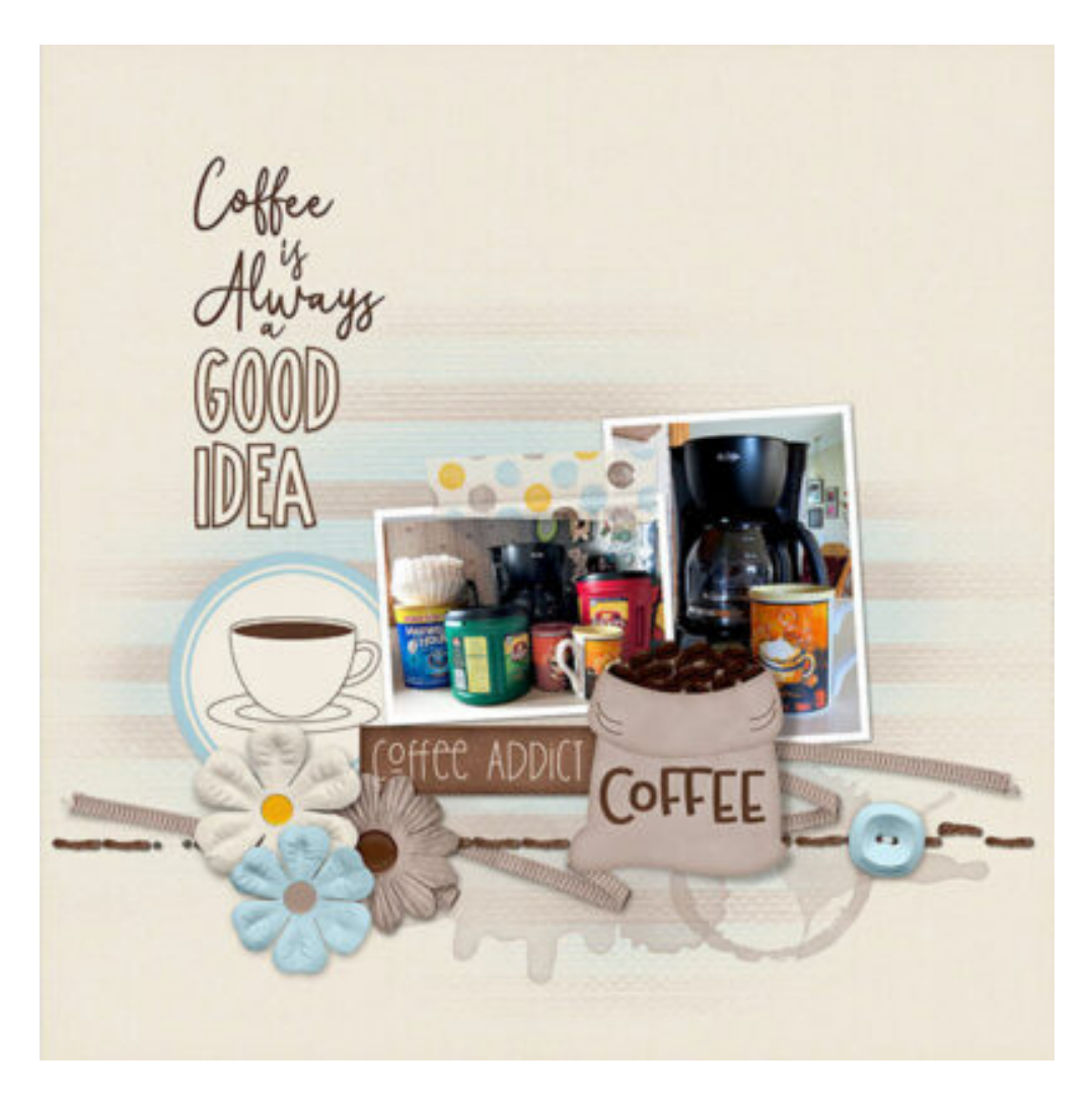
Layout by Joyce