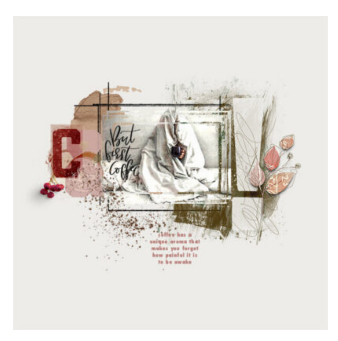
Page by Sylvia