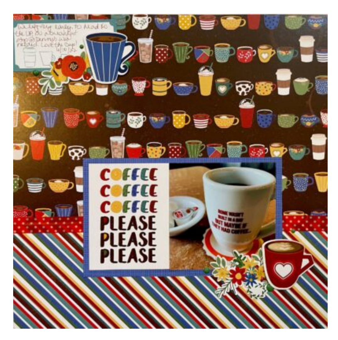
Layout by KeddyO