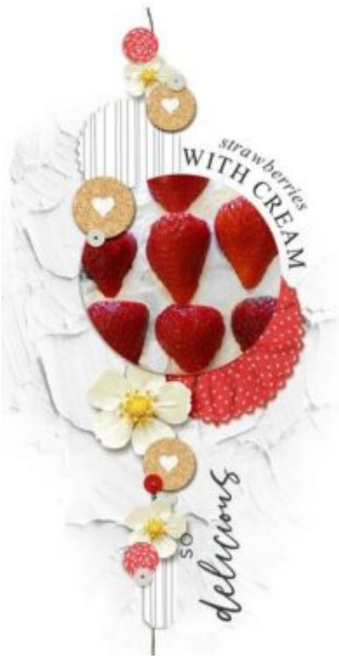
Layout by Jen