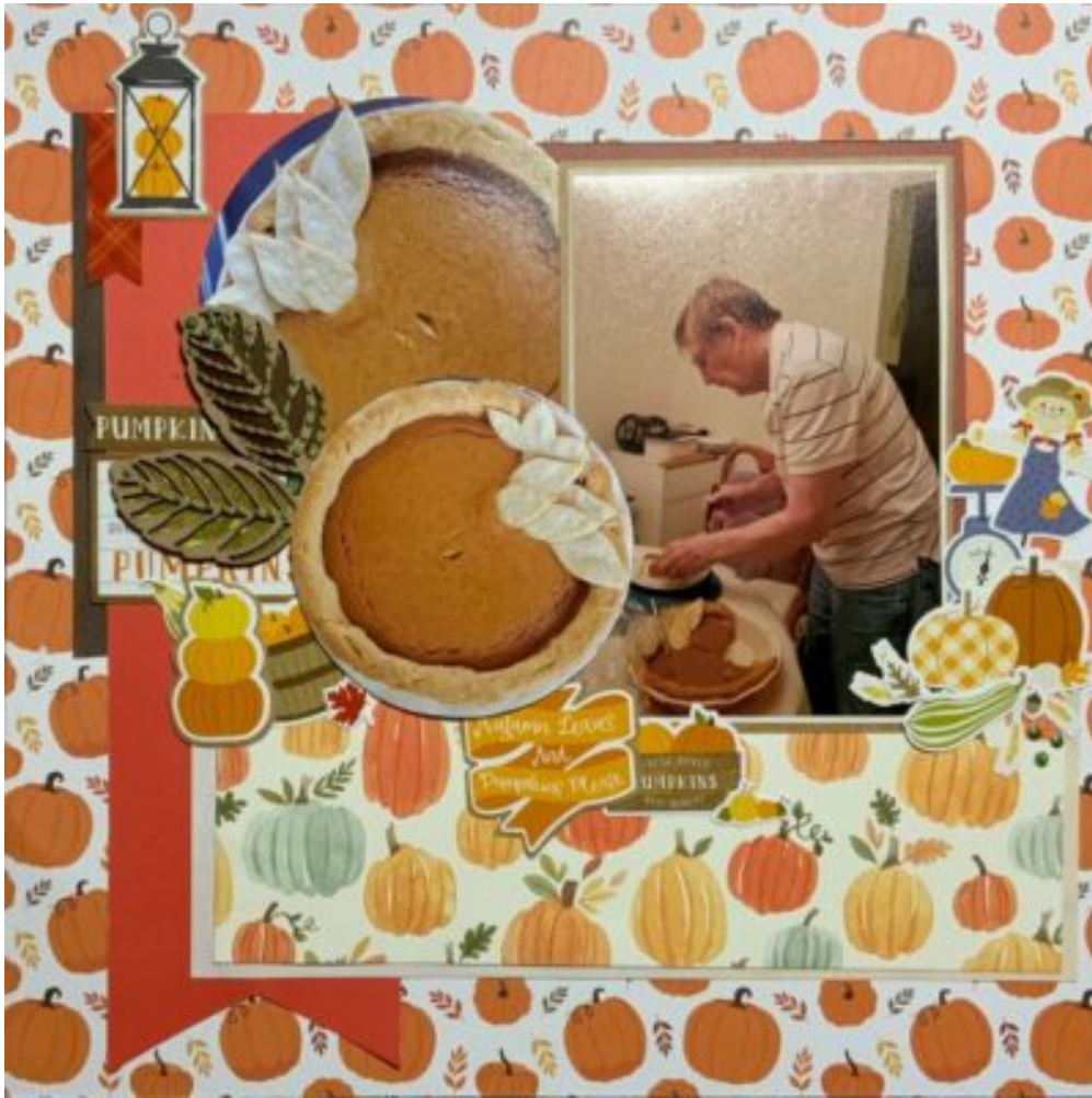
Layout by Lis