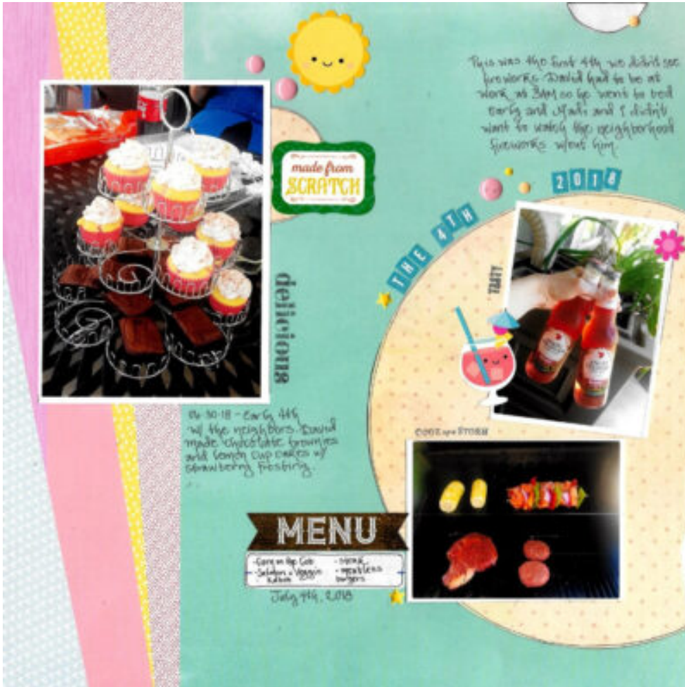
Layout by Doreena