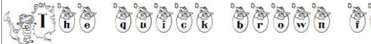
BJF Dragons E:\CAROLE-ENPSP\RESSOURCES\FONT\SEASONAL\BJF Dragons.ttf