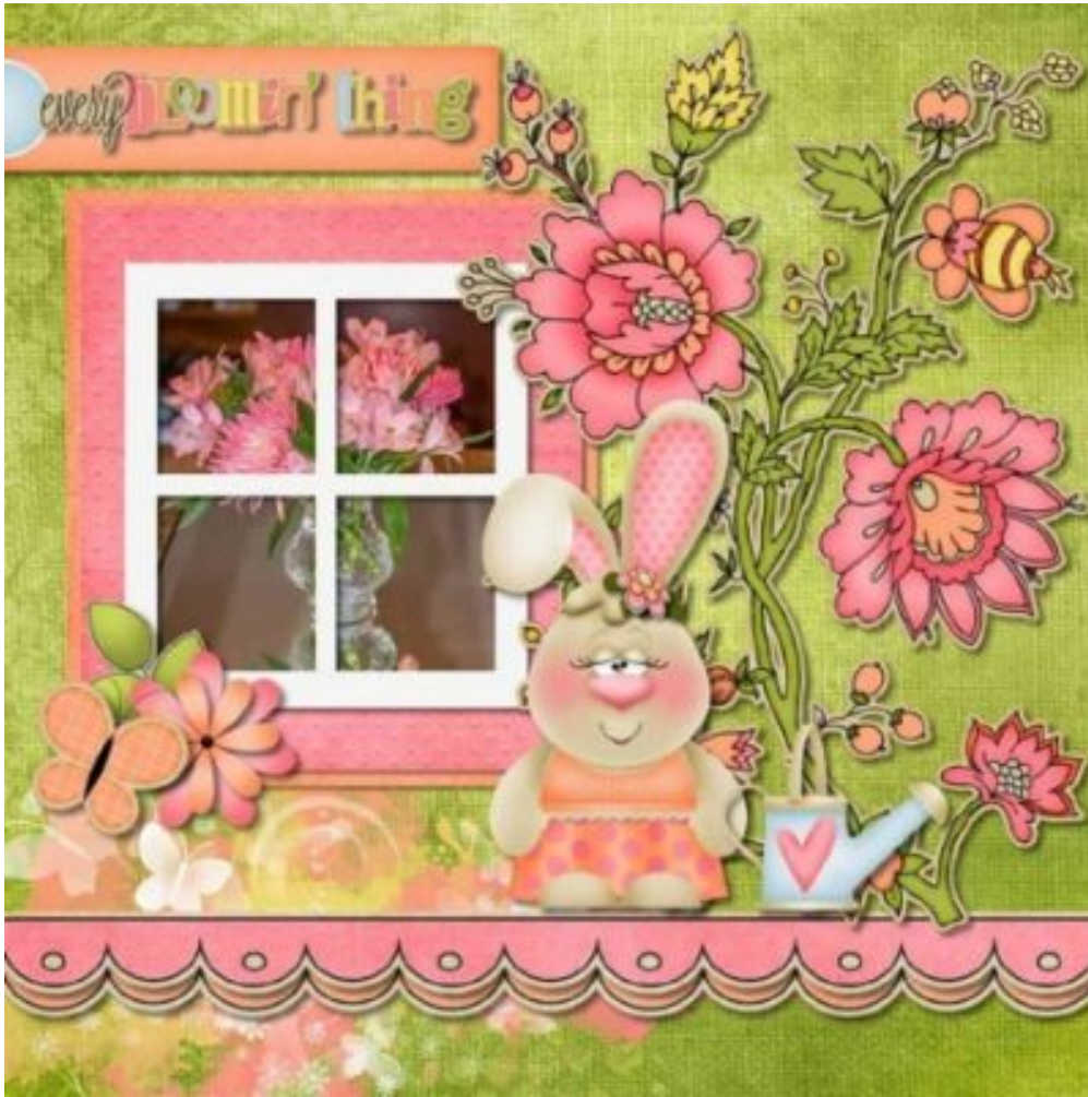
Page by Janice