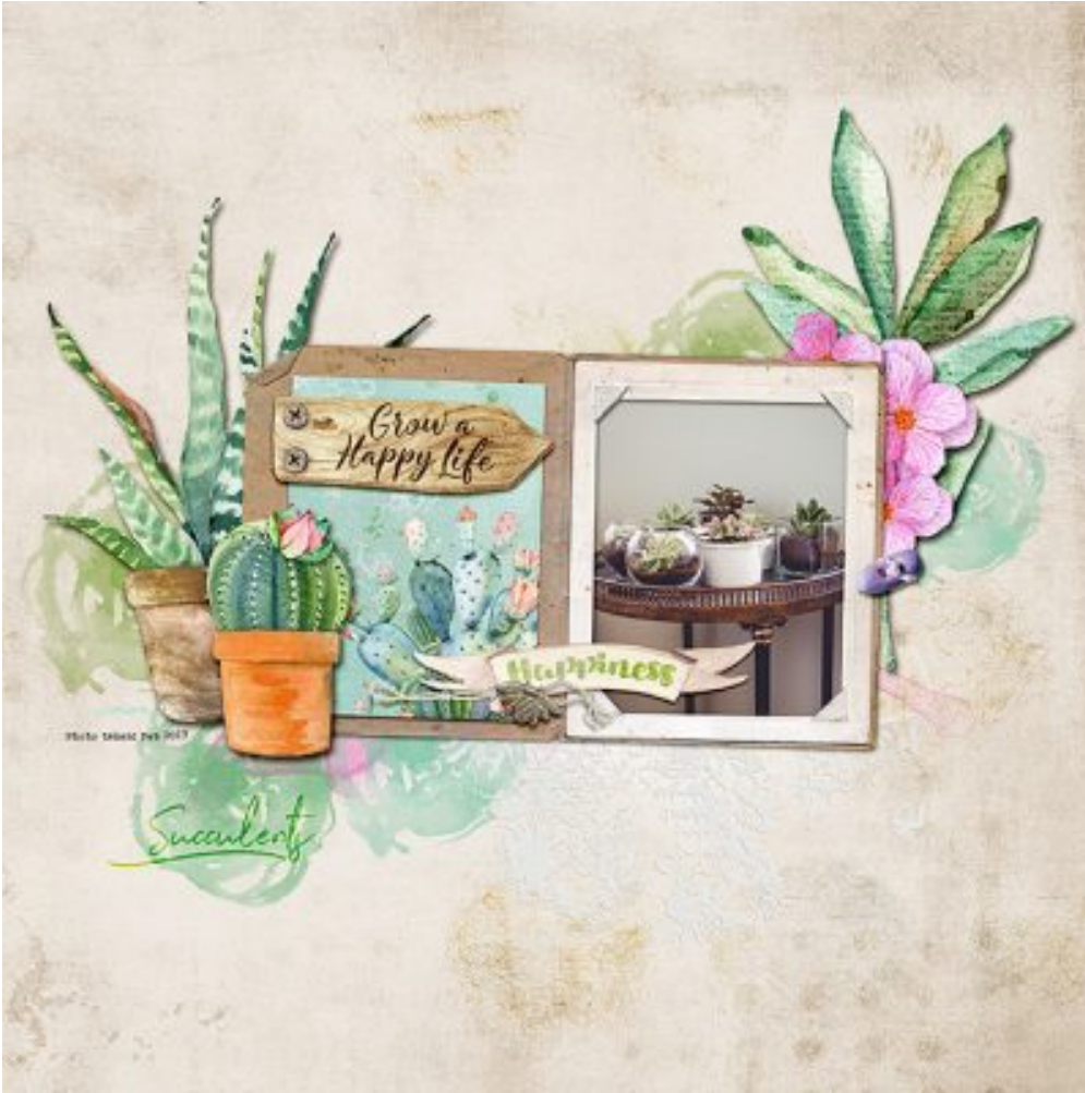
Layout by Jenn