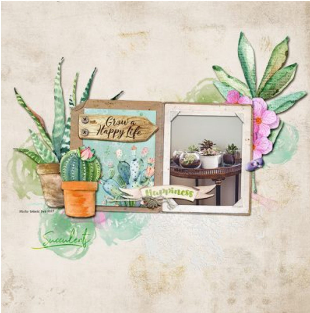
Layout by Jenn