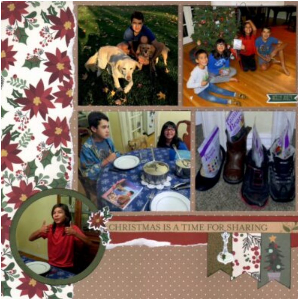
Layout by Cheryl

If you want more holiday inspiration, check out the post about Santa .