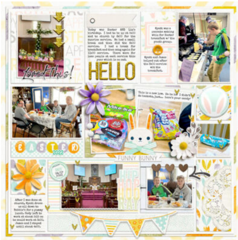
Layout by Karen