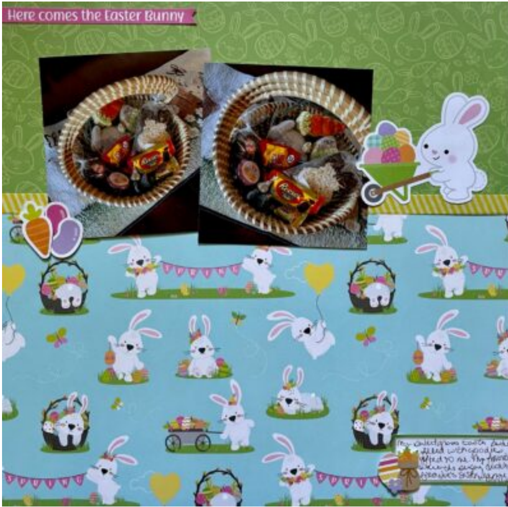
Layout by Kelly