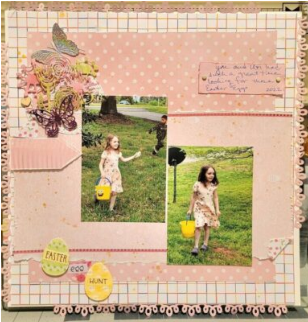
Layout by Toni