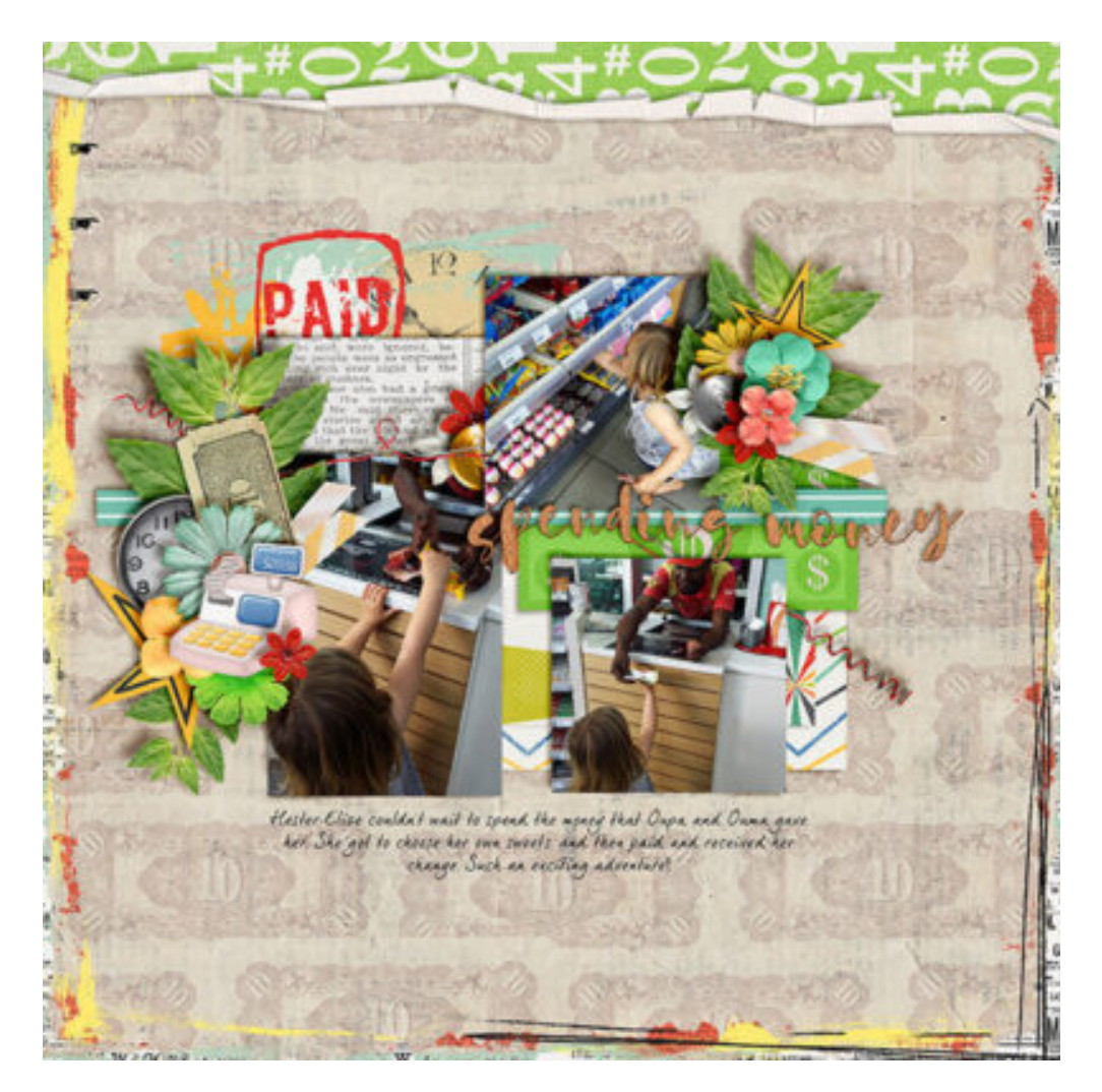
Layout by Christelle