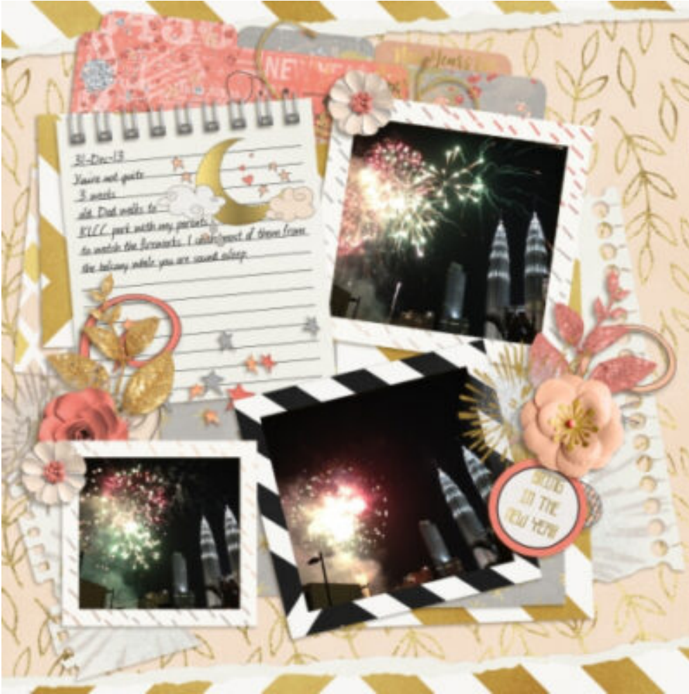
Layout by Lou