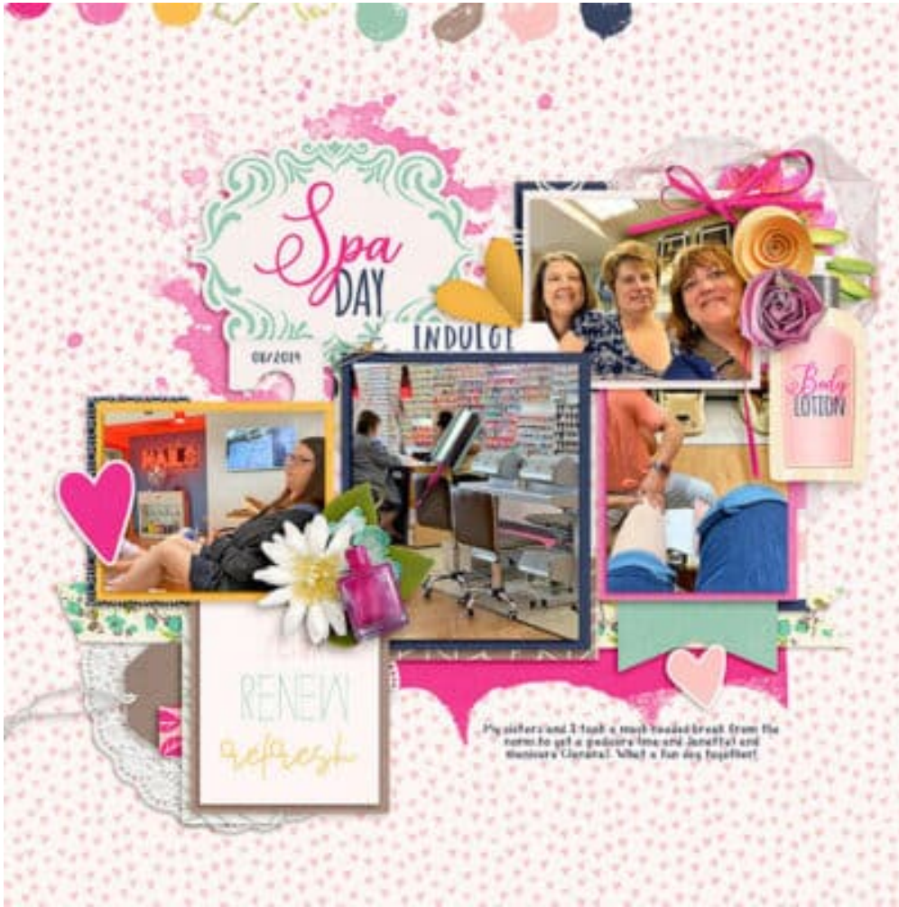
Layout by cutiejo1