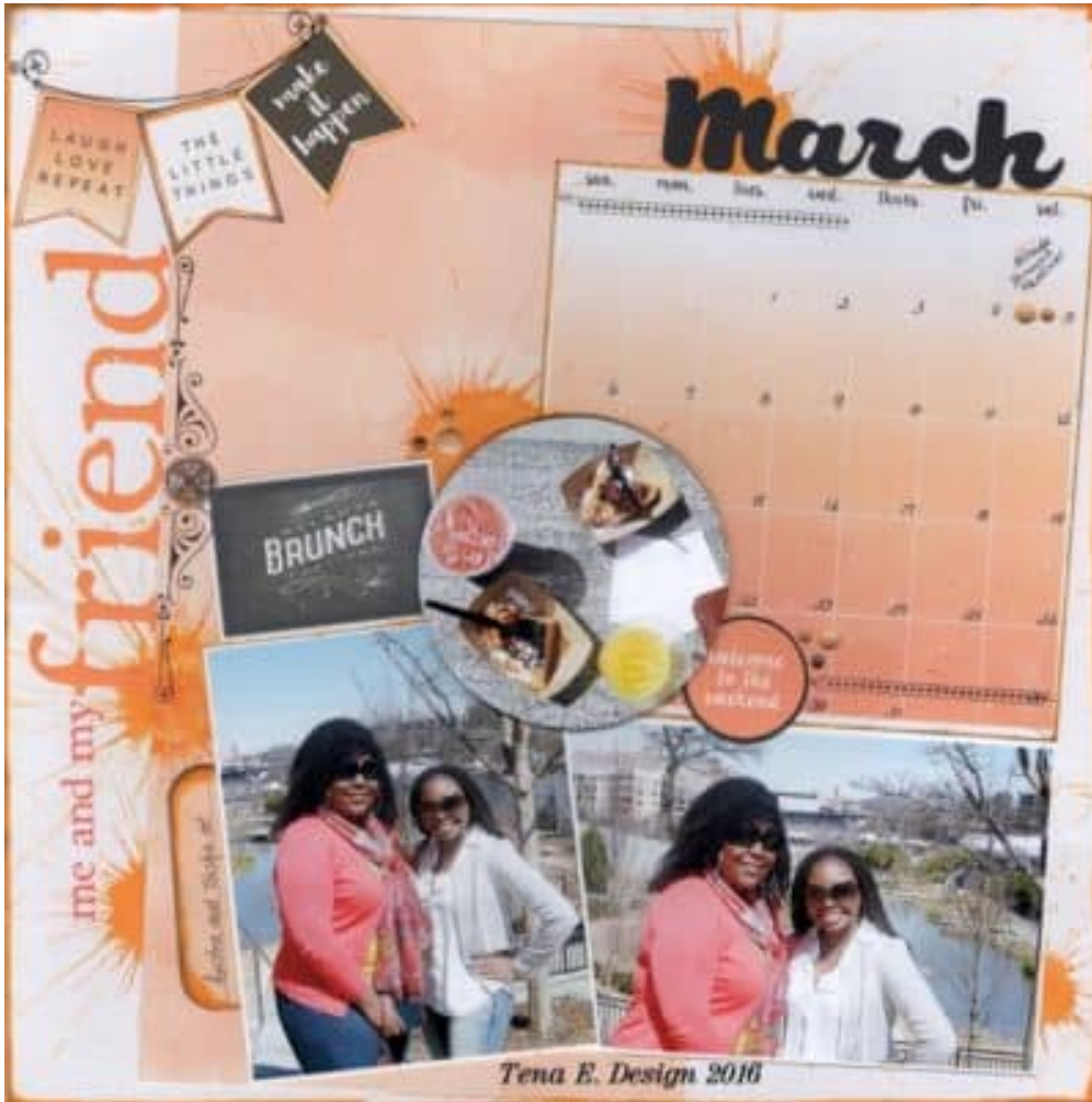
Layout by Tena E.