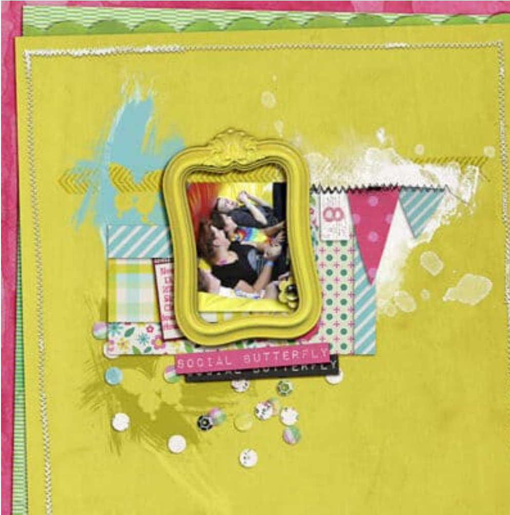
Layout by Beth