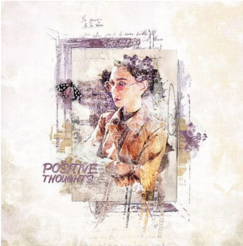
Layout by Marianne