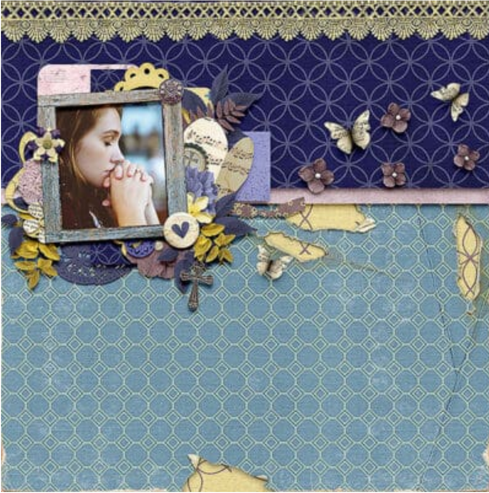
Layout by Michelle