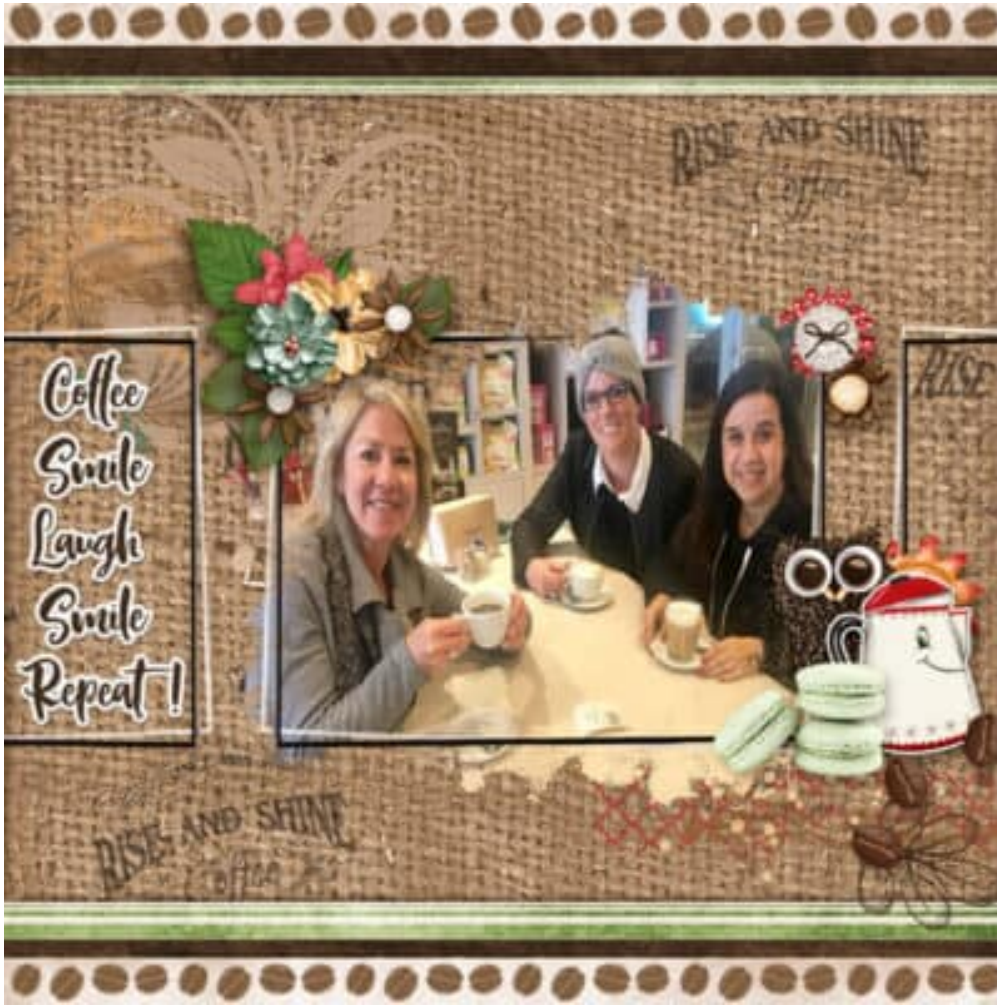
Layout by Jojores