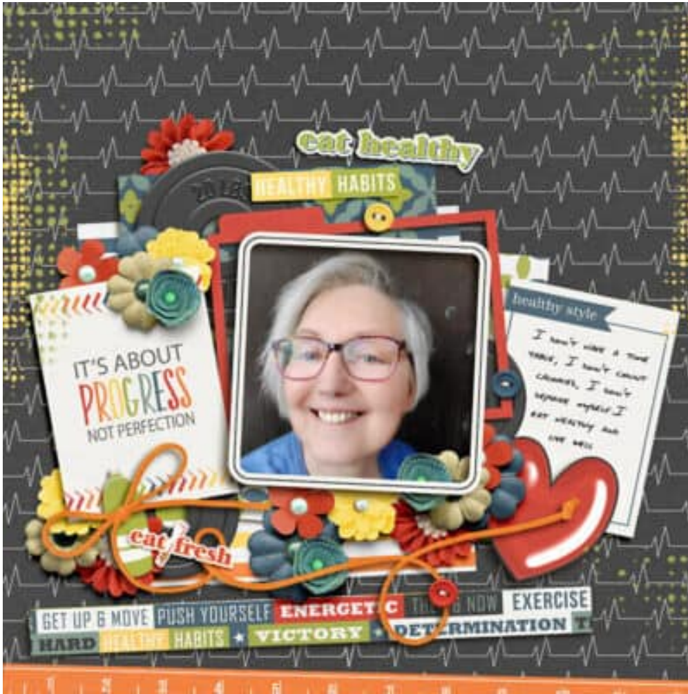
Layout by Rae