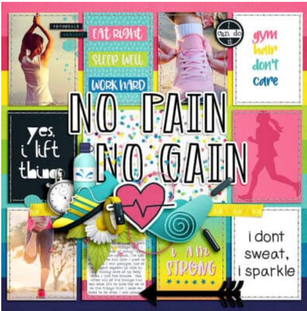
Layout by Neverland Scraps