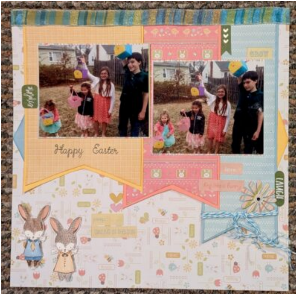
Layout by Jennifer