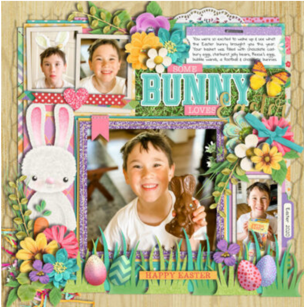
Layout by Charity