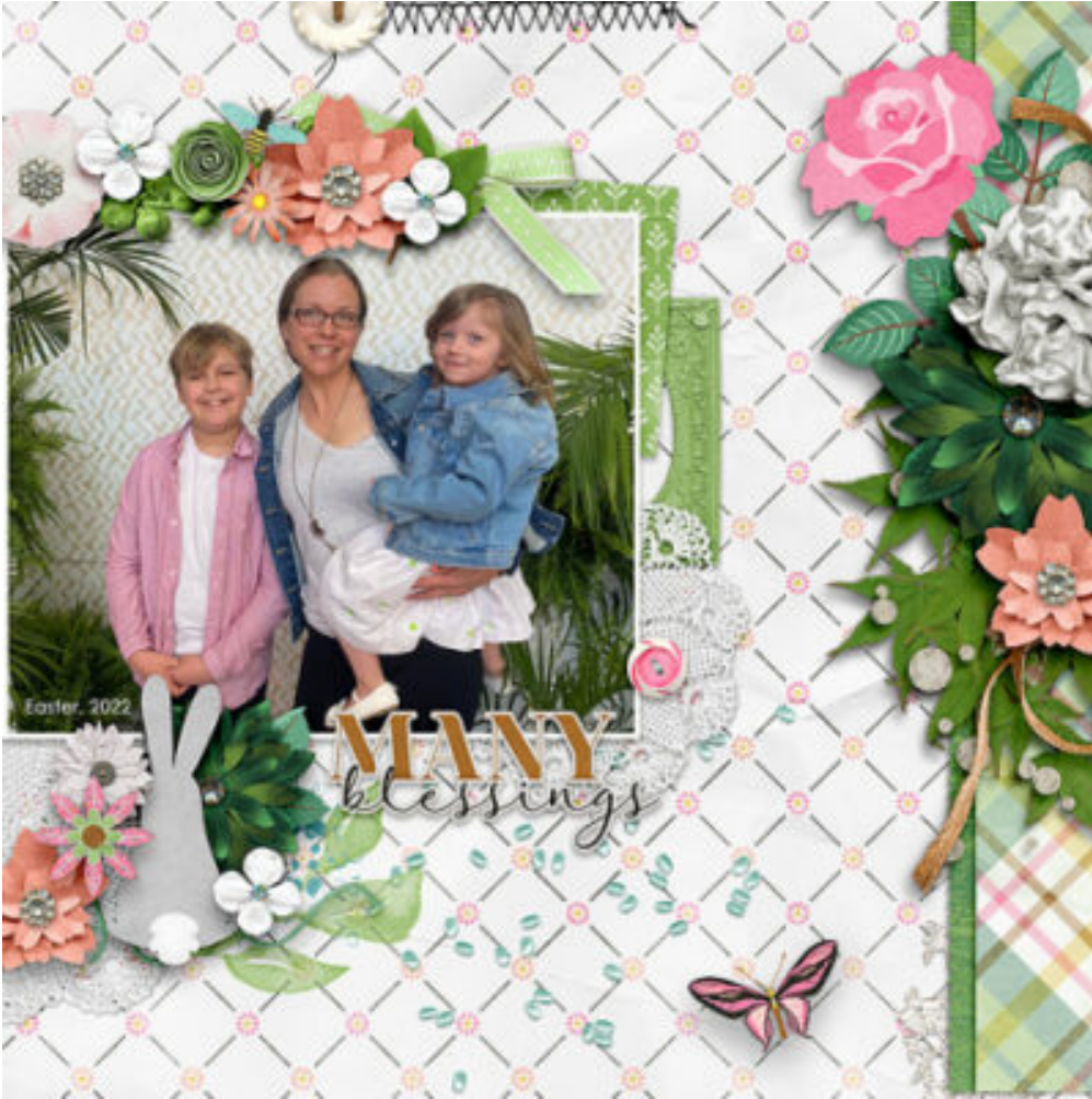
Page by Beatrice