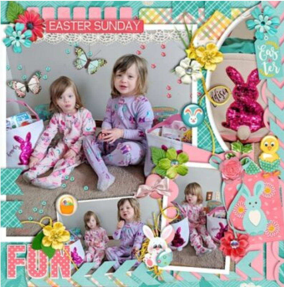
Layout by Beatrice