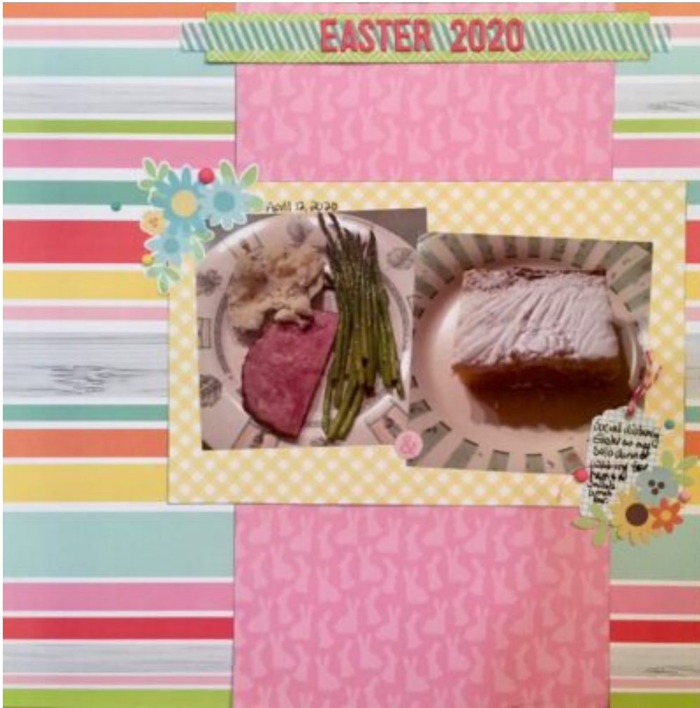
Page by Kelly