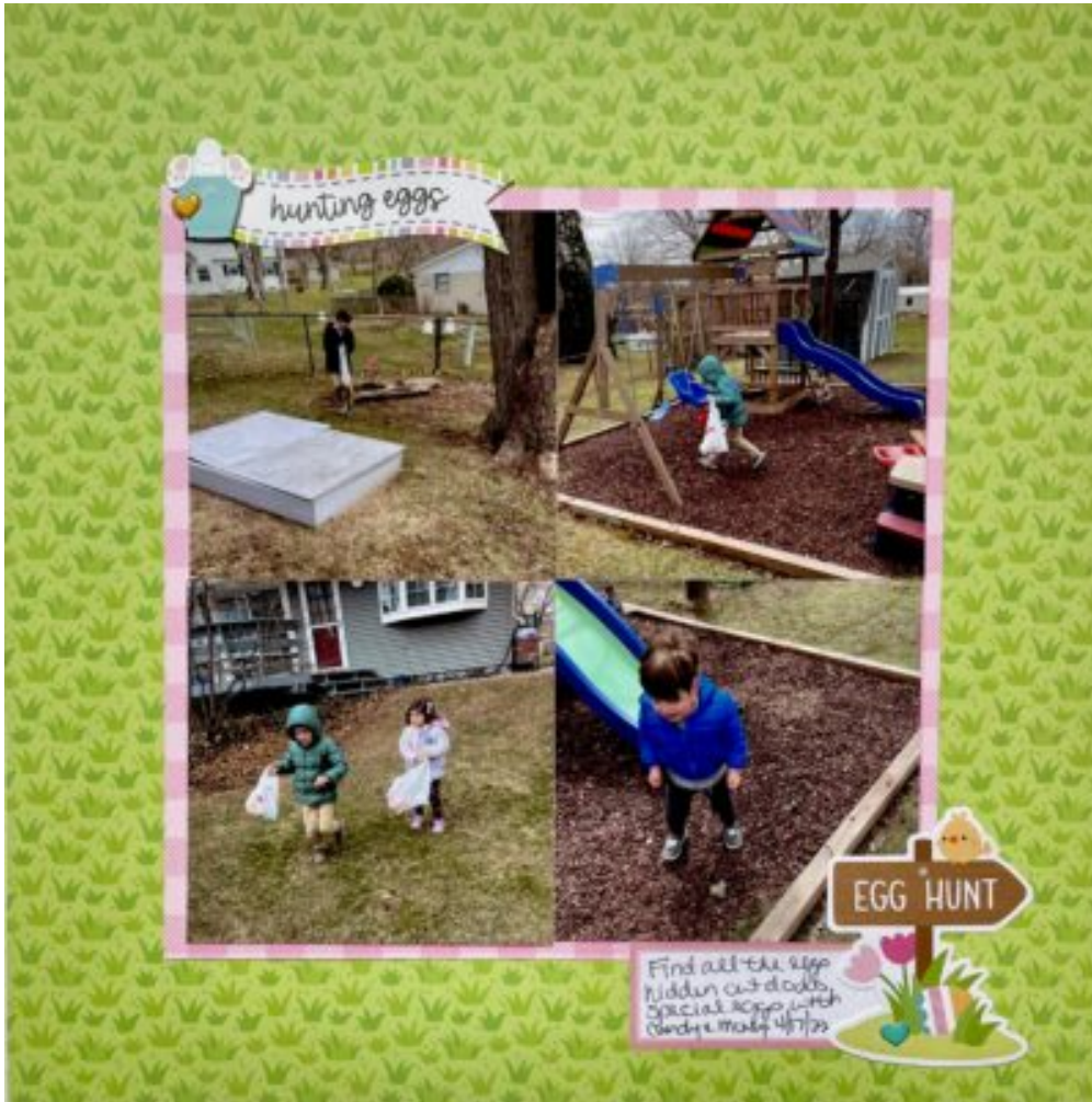
Layout by Kelly