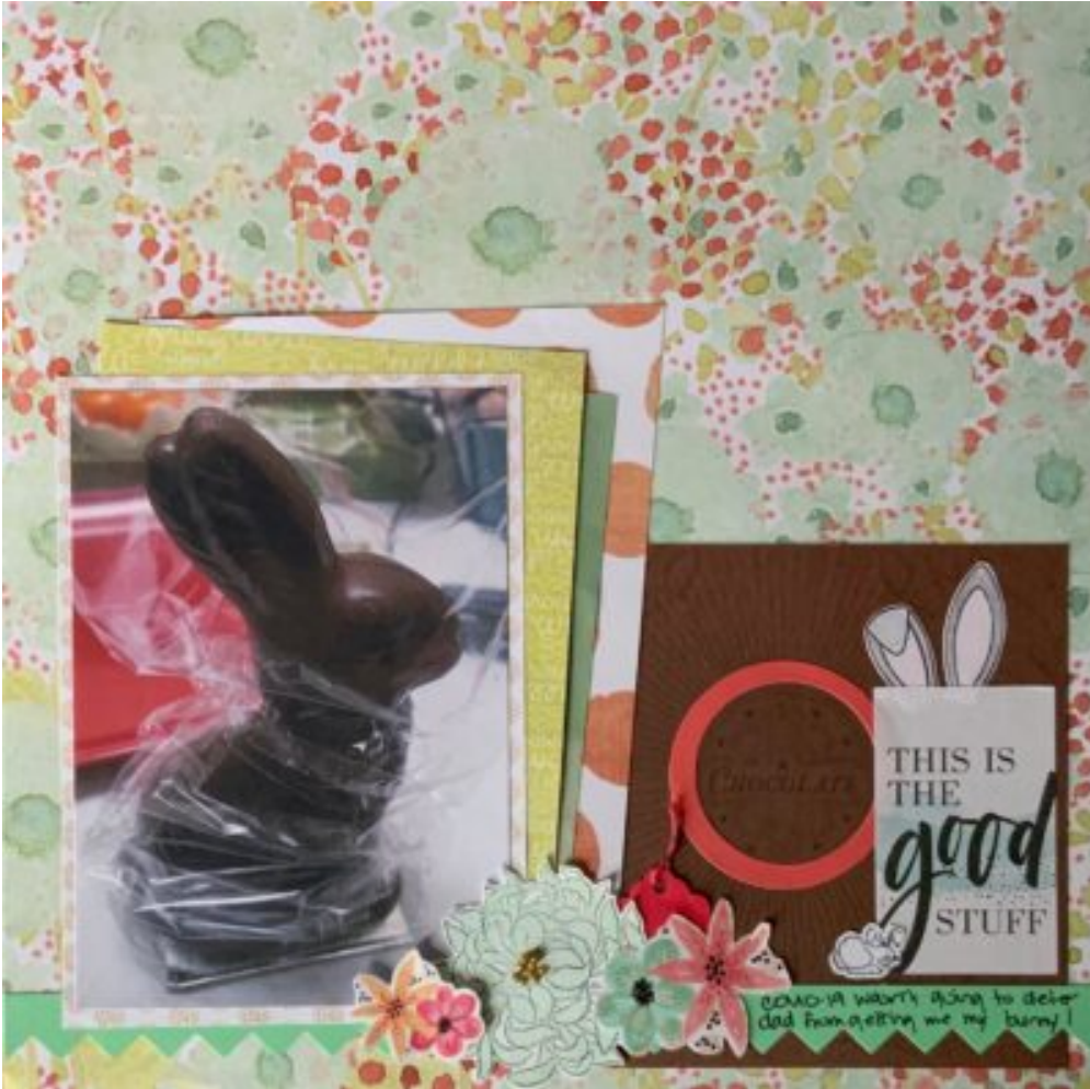
Page by Elissa