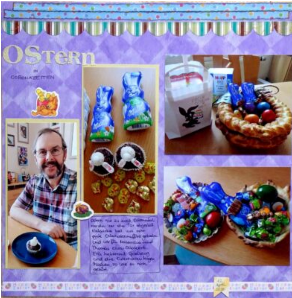
Layout by Susi