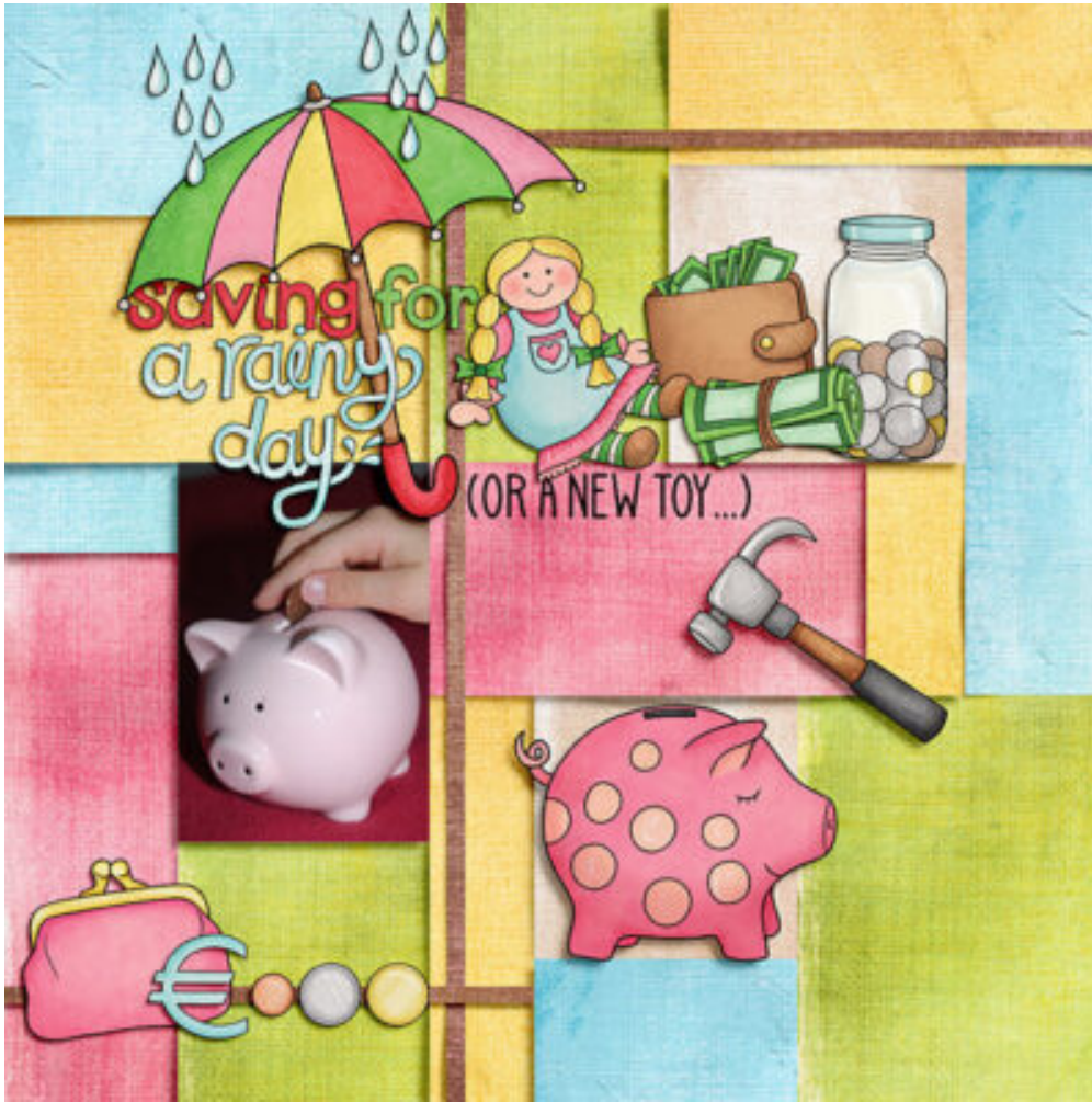
Layout by Cinderella_cindy