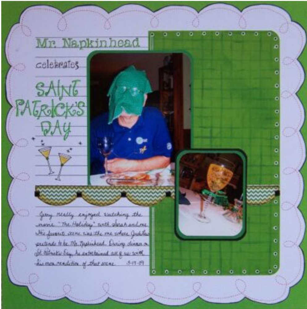
Layout by Betty