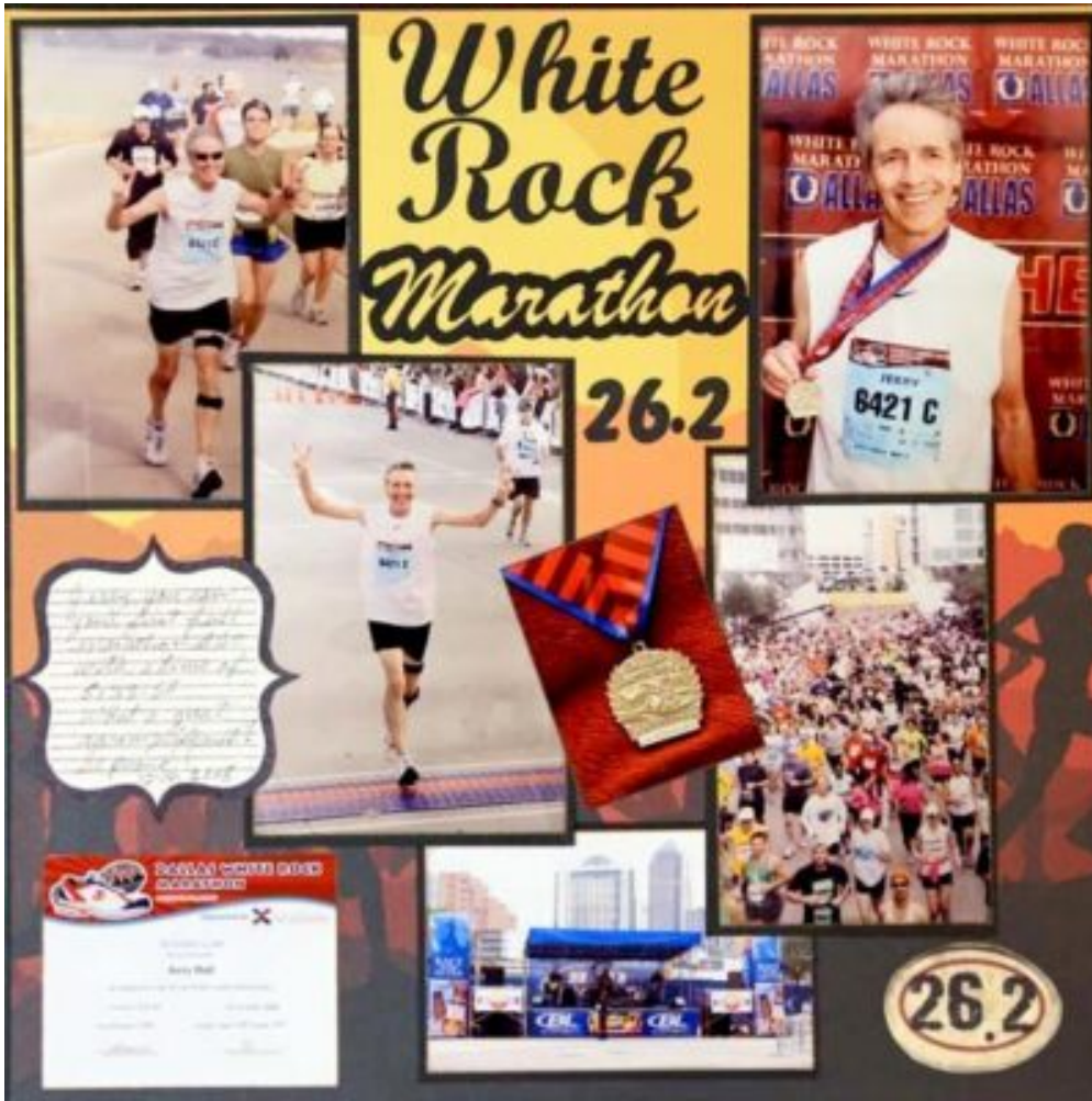
Layout by Anajul