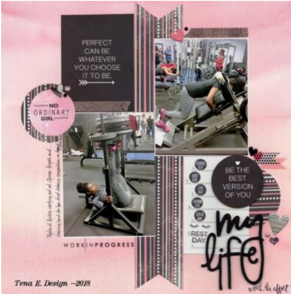
Layout by Tena