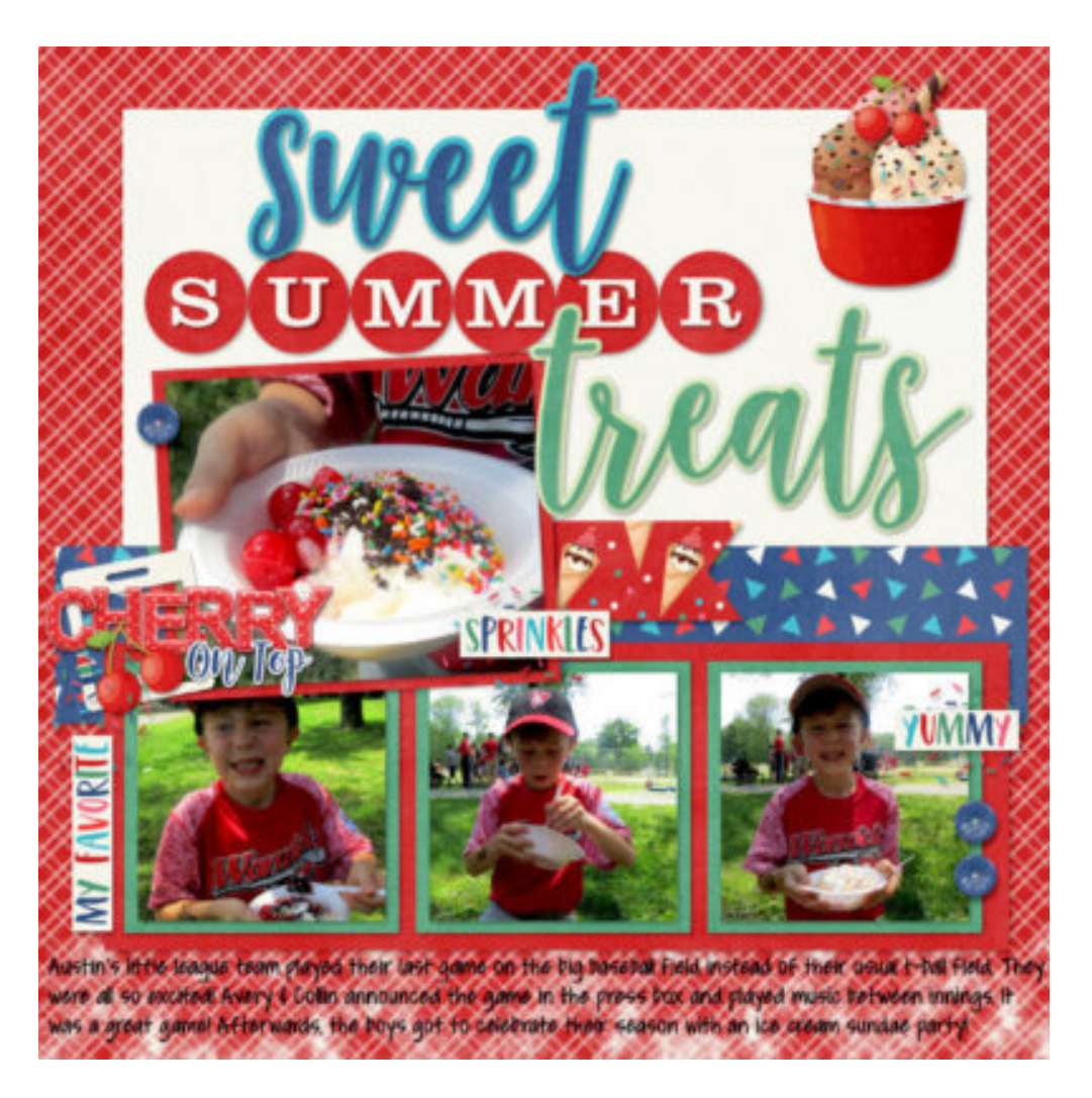
Layout by 3blueeyedbabies