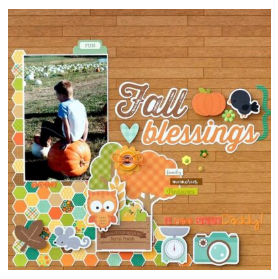
Layout by Vivian