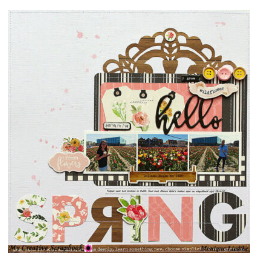
Layout by Monique