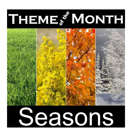
Theme - Seasons