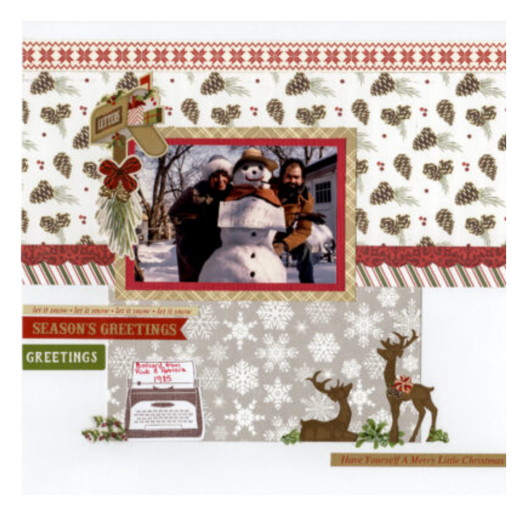
Layout by Betty