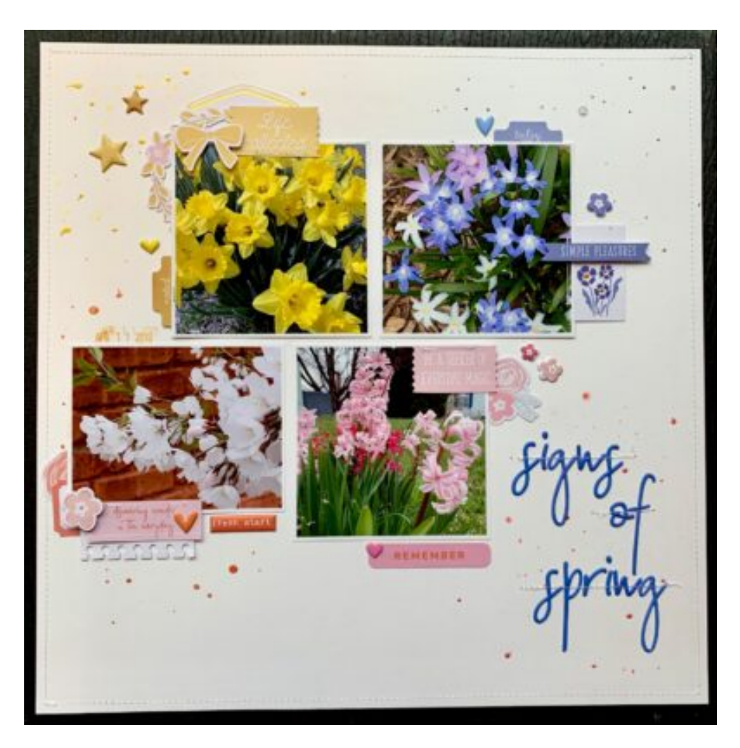
Layout by Tina