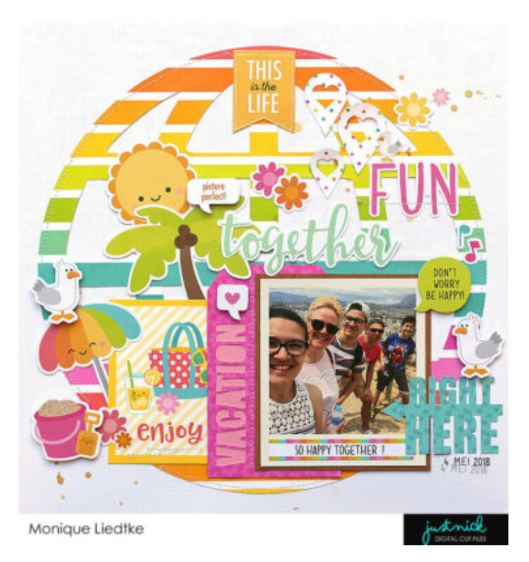
Layout by Monique