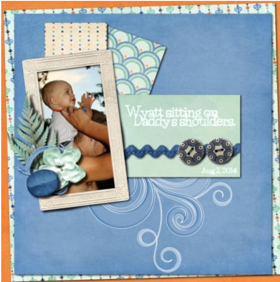
Layout by Jodi Watson

For a different approach to stacking paper, move them partially off the page and showcase the corners in the center. It is an interesting way to add colors and patterns without actually cutting the papers in strips or shapes.