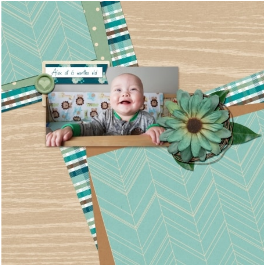
Layout by Kayl Turesson