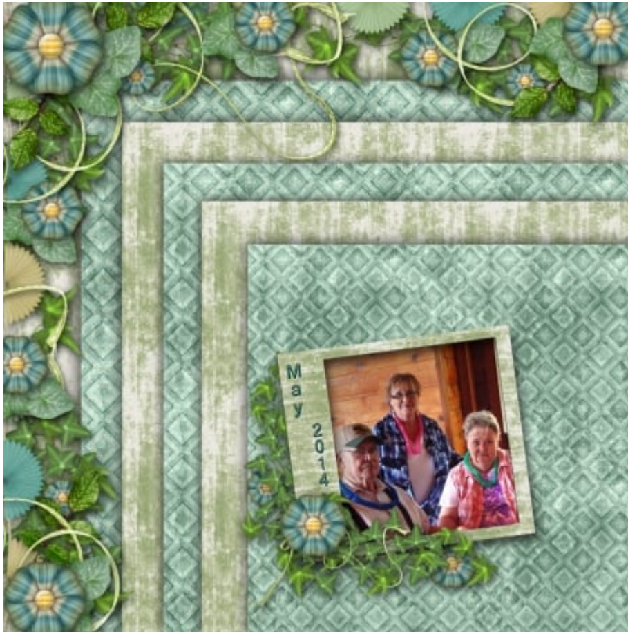
Layout by Dawn Prater

If you prefer, you can stack papers in the center of your page. If you want the effect to be visible, you need to slightly resize your papers. Here is an example of stacking papers that are centered on the page. This will then show up on all four sides of the project.