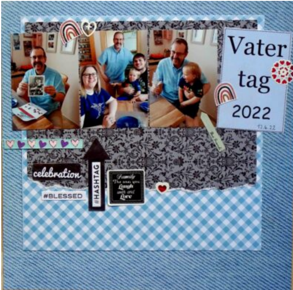
Layout by Susi