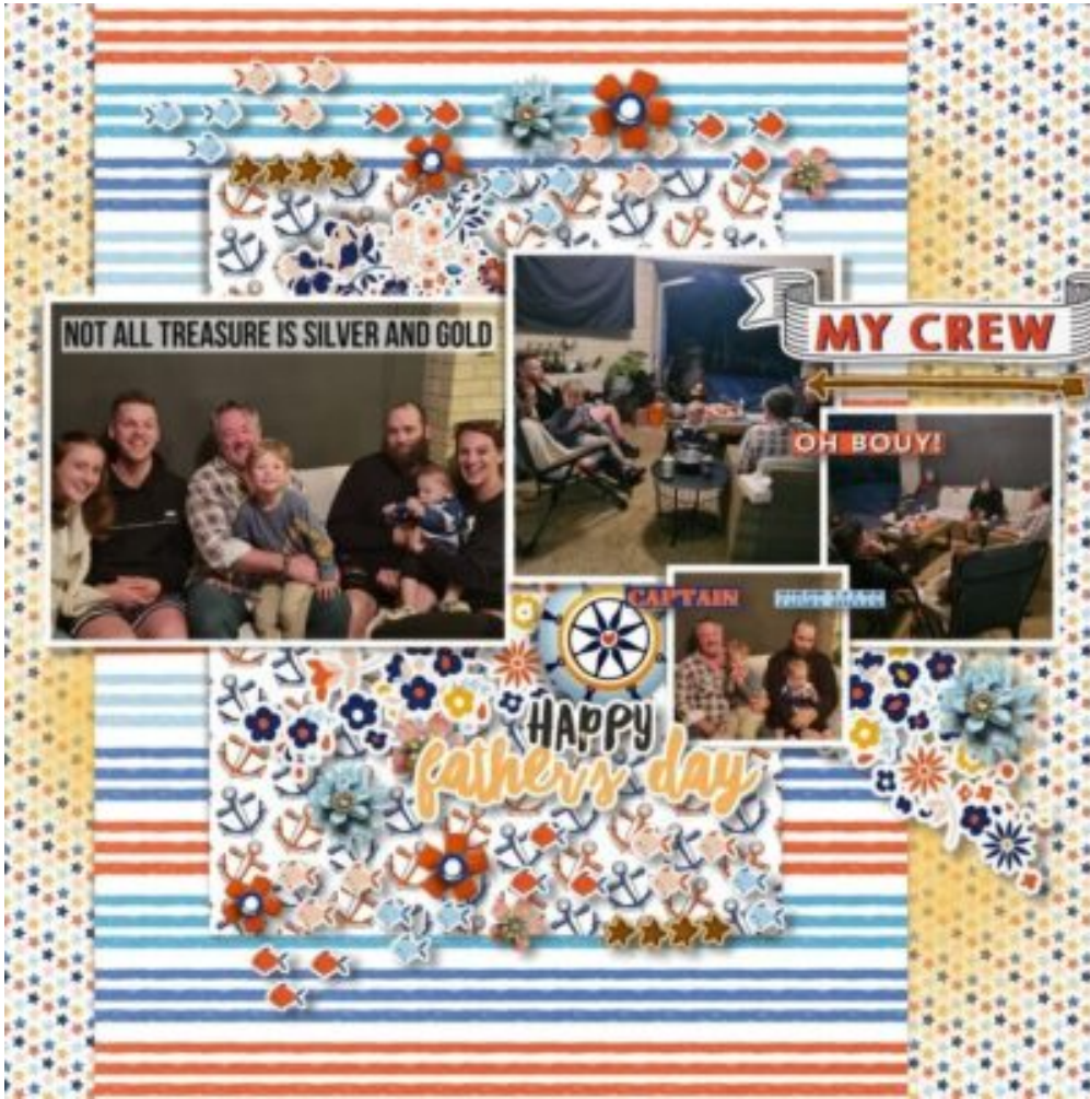
Project by Silent Ranks