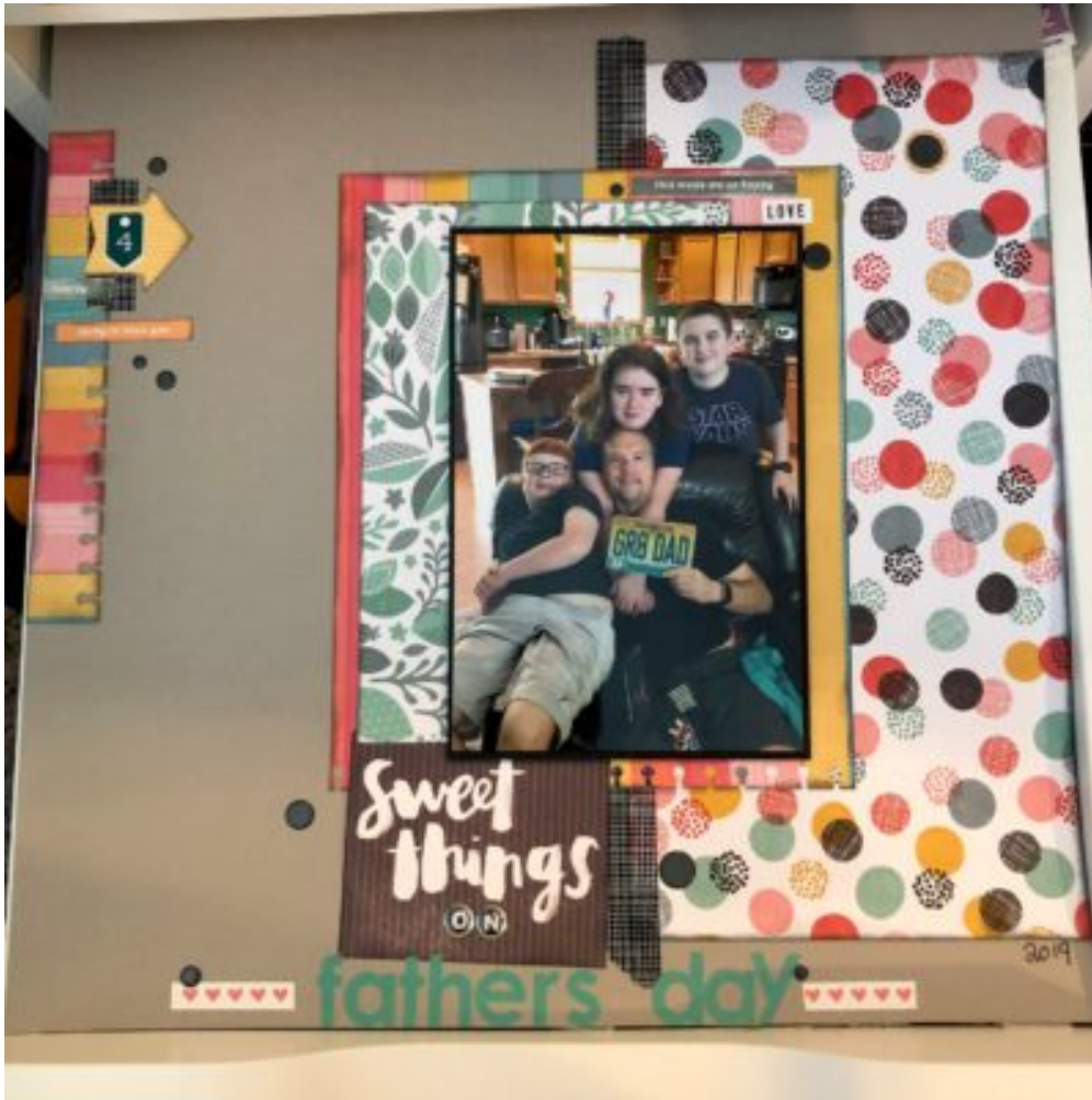
Page by Papers 2 Pages