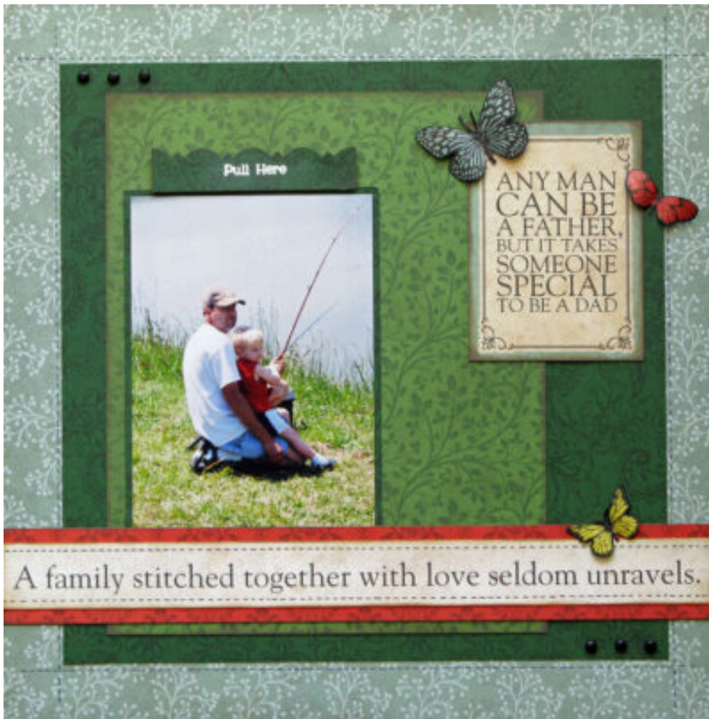
Layout by Susan