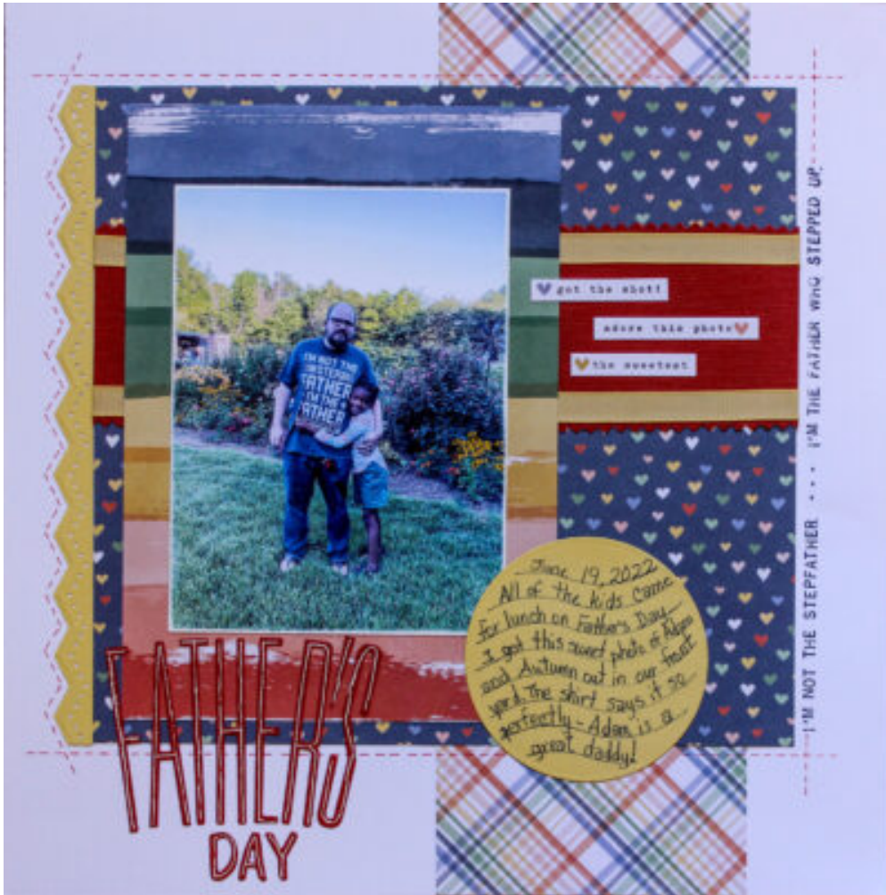
Layout by Betty