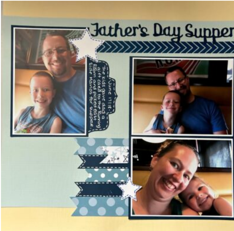
Layout by Scrapanda