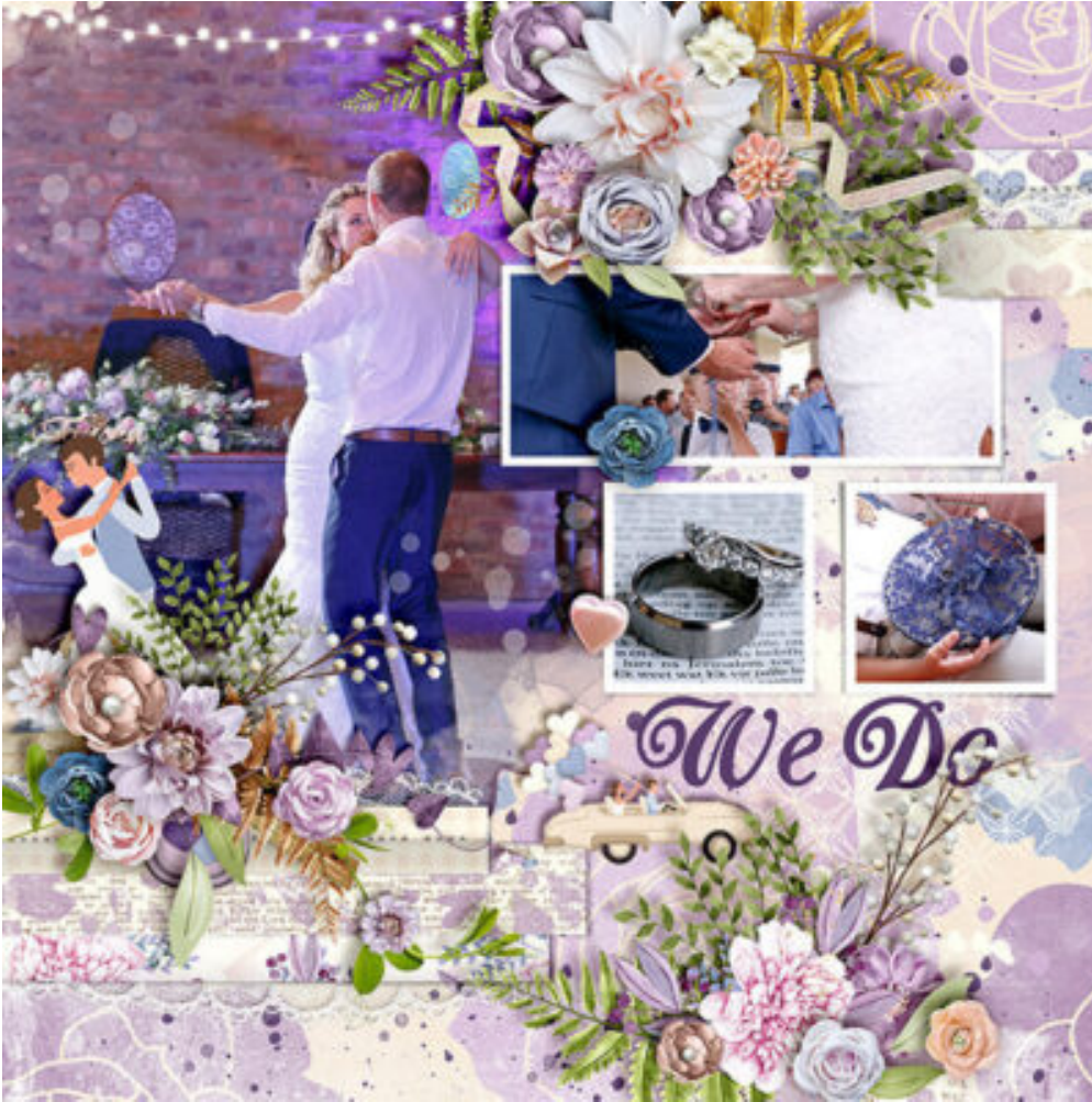
Layout by Christelle