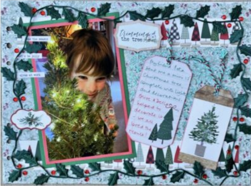
Layout by Rachel