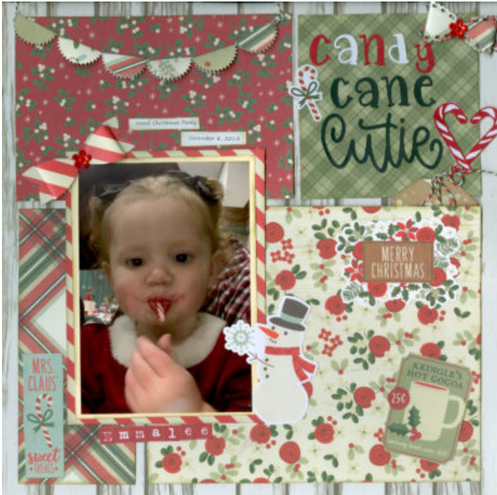
Layout by Pam