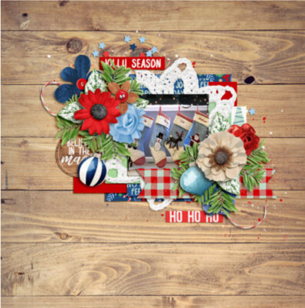
Layout by Carrie1977