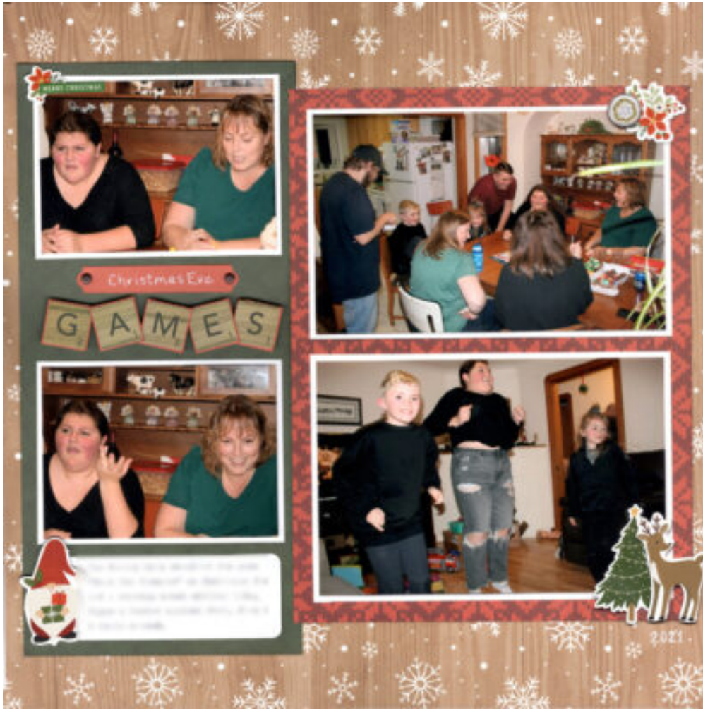
Layout by Judy2408