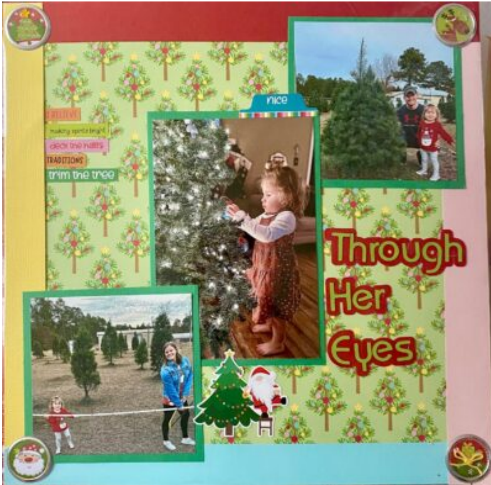
Layout by Debbie